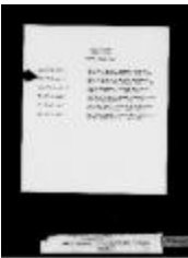
West Coast Agency - Ahousaht Residential School - School Land (Plan), 1907-1936 (2055994)