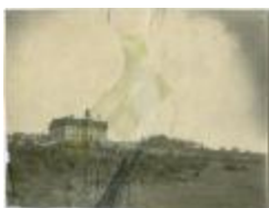
[Brandon Industrial Institute, Brandon, Man.] (13d-c5711-d9)