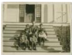
The preacher and the W.M.S. Home boys on the steps of the Home, Kitimaat