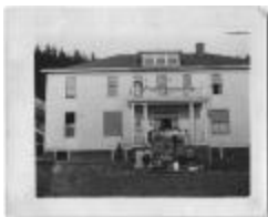
Elizabeth Long Memorial Home, Kitimaat : staff and children (13d-c5703-d23)