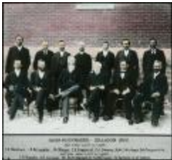
Indian missionaries, Brandon (13d-c5711-d56)