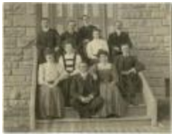
[Staff of the Red Deer Industrial School] (13d-c5706-d11)