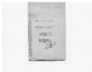
Field Book, 1 January 1904 (91a-c000062-d0001-001)