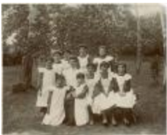
S.S. class, Brandon Industrial Institute (13d-c5711-d12)