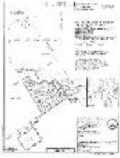
Plan, 1 July 1905 (91a-c000045-d0001-001)