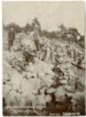
[Garden boys harvesting cabbages under the watchful eye of their instructor, Brandon Indian School farm] (13d-c5711-d16)