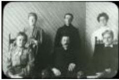
Staff at Norway House School (13d-c5712-d124)