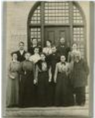
Staff of the Brandon Indian Industrial Institute (13d-c5711-d7)