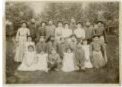
Indian children from Fisher River, Portage la Prairie Indian Boarding School