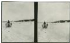
[Travelling by ox team, Norway House] (13d-c5712-d7)