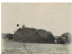
[Bringing in the hay, Brandon Indian School farm] (13d-c5711-d14)