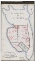
Plan, 3 April 1905 (91a-c000046-d0001-001)