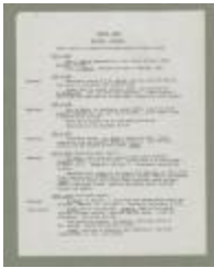
Indian Work in British Columbia (38f-c000062-d0003-001)