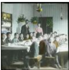
[Brandon boys in the dining room, Brandon Industrial Institute] (13d-c5711-d5)