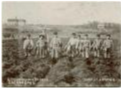
[Garden boys, Brandon Indian School : boys and their instructor showing some of the fruits of their labours in the carrot patch] (13d-c5711-d17)