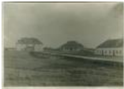
Interior of the Hudson's Bay Company Fort at Norway House (13d-c5712-d48)