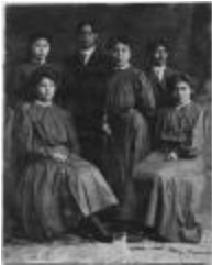
Graduate students of the Coqualeetza Industrial Institute (13d-c5701-d15)