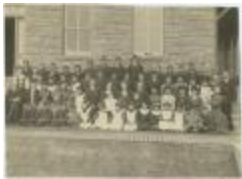
[Teachers and students, Red Deer Industrial Institute] (13d-c5706-d7)