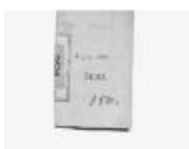
Field Book, 1 November 1904 (91a-c000057-d0001-001)