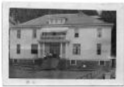
Elizabeth Long Memorial Home : before cement foundation (13d-c5703-d5)