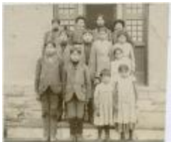
[Students of the Brandon Industrial Institute] (13d-c5711-d10)