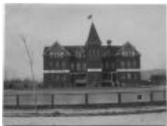
["We Mourn Our Beloved Queen" : Coqualeetza Industrial Institute] (13d-c5701-d7)