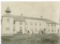
[Staff and students assembled outside the Indian Boarding School at Norway House] (13d-c5712-d39)