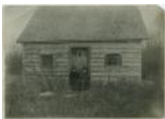
Norway House jail on Jail Island : two government nurses sitting on steps (13d-c5712-d49)