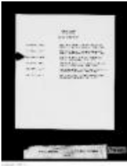
West Coast Agency - Ahousaht Residential School - School Land, 1930-1936 (2055996)