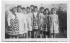
Girls at the Crosby Girls' School wearing aprons sent from Beaver Band Club of Trail, B.C. (13d-c5702-d14)