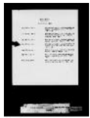
Williams Lake Agency - Caribou Residential School - Cadet Corps Band Set - Accounts, 1945-1946 (2056009)