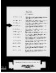
Lytton Agency - St. George's Residential School - Cadets Corps Band Set - Supplies - Accounts, 1924-1930 (2056066)