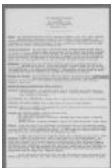
The Coqualeetza Fellowship and The Information Centre (38f-c000931-d0001-001)