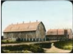
Barn at Brandon (13d-c5711-d55)