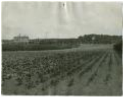
View of the Brandon Indian Institute and garden, Brandon, Man. (13d-c5711-d23)