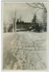
[Brandon Institute in winter (side view)] (13d-c5711-d50)