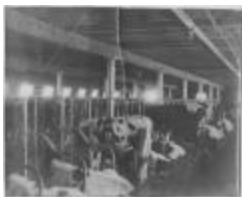
[Cows in stalls in the dairy barn, Brandon Institute] (13d-c5711-d32)