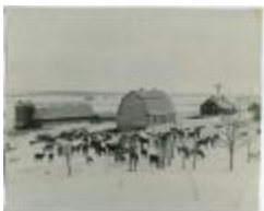
General view of the barns and livestock, Brandon Institute (13d-c5711-d25)