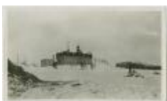
Brandon Institute (13d-c5711-d39)