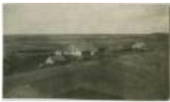
The Farm Buildings And Some Of The Fields Ready For Seeding (13d-c5711-d36)