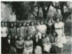
This Snap Was Taken A Year Ago, So All Our Big Girls Are Not Here Now (13d-c5711-d4)