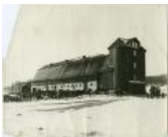
[Cows outside the dairy barn, Brandon Institute] (13d-c5711-d26)