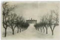
Brandon Indian Institute in winter (13d-c5711-d49)