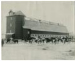
[Cows outside the dairy barn in winter, Brandon Institute] (13d-c5711-d27)