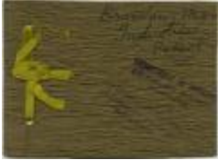
With heartiest Christmas greetings ... from the principal and staff of the Indian Industrial School, Brandon, Man. (13d-c5711-d54)