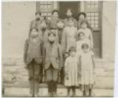
[Students of the Brandon Industrial Institute] (13d-c5711-d10)