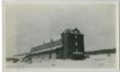
Dairy barn and silos, Brandon Institute (13d-c5711-d40)