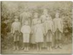
[Some staff and students of the Brandon Industrial Institute] (13d-c5711-d11)