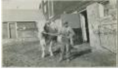
[Handling a bull, Brandon Industrial Institute] (13d-c5711-d47)