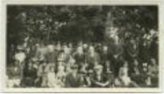
Scholars and staff, Brandon Institute (13d-c5711-d43)