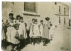
Girls at the Indian school in the great lone land, Brandon, Man. (13d-c5711-d19)