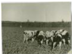
Cows in the garden, Brandon Institute (13d-c5711-d24)