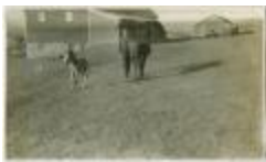
[The new filly, Brandon Institute] (13d-c5711-d45)