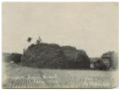
[Bringing in the hay, Brandon Indian School farm] (13d-c5711-d14)