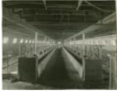
[Interior of the dairy barn, Brandon Institute] (13d-c5711-d30)