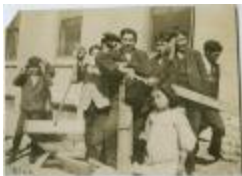
Children at the Brandon Indian School (13d-c5711-d20)