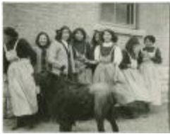
Girls, Brandon Indian School (13d-c5711-d21)