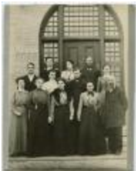
Staff of the Brandon Indian Industrial Institute (13d-c5711-d7)