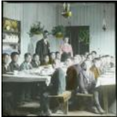
[Brandon boys in the dining room, Brandon Industrial Institute] (13d-c5711-d5)