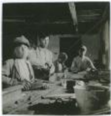
[Carpentry class, Brandon Industrial Institute] (13d-c5711-d22)