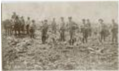
[Harvest time in the vegetable garden, Brandon Indian School farm] (13d-c5711-d18)