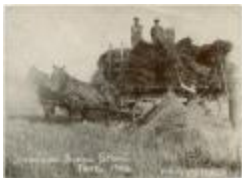
[Gathering stooks, Brandon Indian School farm] (13d-c5711-d15)