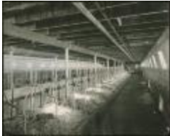
[Interior of the dairy barn, Brandon Institute] (13d-c5711-d31)