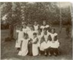
S.S. class, Brandon Industrial Institute (13d-c5711-d12)