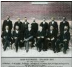
Indian missionaries, Brandon (13d-c5711-d56)