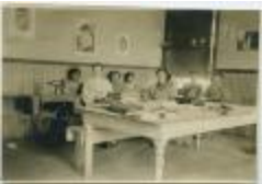
[Sewing class, Brandon Industrial Institute] (13d-c5711-d13)