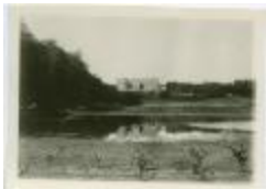
Brandon Indian Institute, Man.