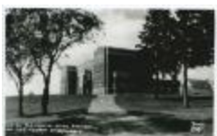
Indian Residential School, Brandon. United Church of Canada (13d-c5711-d1)