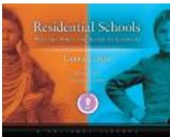
Residential schools : with the words and images of survivors (7873518)