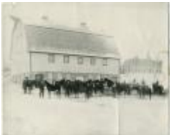
[Horses outside the barn in winter, Brandon Institute] (13d-c5711-d29)