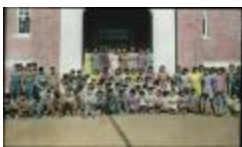
Pupils in front of Brandon Residential School, Man. (13d-c5711-d57)