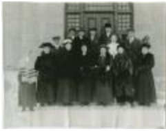
Staff of the Brandon Institute (13d-c5711-d35)