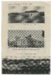
Morley Indian Residential School. rebuilt in 1935 (MOA_20180215_001)