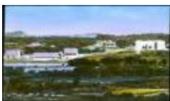
Brandon Indian Inst., Man. (13d-c5711-d58)