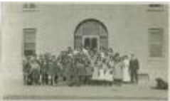
Scholars and staff, Brandon Institute (13d-c5711-d46)