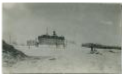
Brandon Indian Institute, Man. (13d-c5711-d51)