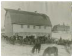
[Horses outside the barn in early spring, Brandon Institute] (13d-c5711-d28)