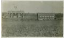
[Barns and pasture, Brandon Industrial Institute] (13d-c5711-d48)