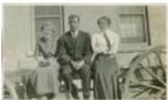
[Three staff members sitting on a fence, Brandon Institute] (13d-c5711-d44)