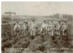
[Garden boys, Brandon Indian School : boys and their instructor showing some of the fruits of their labours in the carrot patch] (13d-c5711-d17)