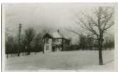
House of the instructor in carpentry, Brandon, Man. (13d-c5711-d38)