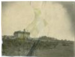
[Brandon Industrial Institute, Brandon, Man.] (13d-c5711-d9)