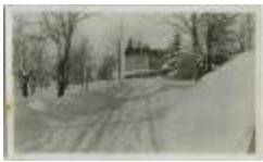
Brandon Institute in winter (side view) (13d-c5711-d41)