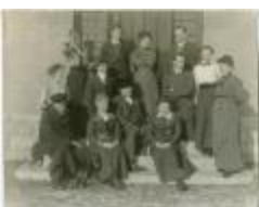
Staff of the Brandon Institute (13d-c5711-d34)