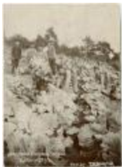
[Garden boys harvesting cabbages under the watchful eye of their instructor, Brandon Indian School farm] (13d-c5711-d16)