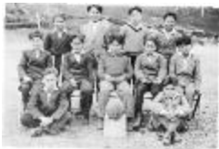
Alert Bay School - Junior Soccer Team (13a-c004554-d0109-001)