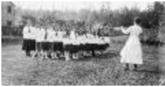
Alert Bay Girls - Prize Giving Day (13a-c004554-d0035-001)