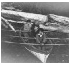
Boys of our school, St. Michael's, in row boat (13a-c004554-d0067-001)