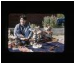
Unidentified young man with indigenous art (UCCPMR_20180221_005)