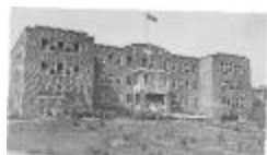
St. Michael's School, Alert Bay, B.C. - taken on the day of our closing exercises (13a-c004554-d0062-001)