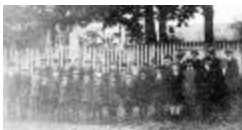
St. Michael's Boys' School students, Alert Bay, BC (13a-c004554-d0017-001)