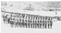
Alert Bay School - Cadet Corps (13a-c004554-d0115-001)