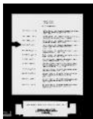
Lytton Agency - St. George's Residential School - Cadets Corps Band Set - Supplies - Accounts, 1924-1930 (2056066)