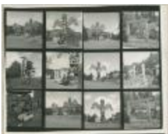
Totem Poles And Children (38f-c000860-d0001-001)