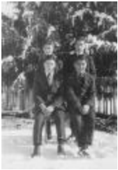
The Boys' Industrial School, Alert Bay, B.C. - Class V (13a-c004554-d0056-001)