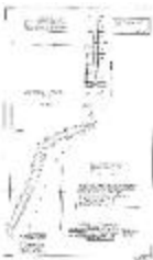
Plan, 1 January 1948 (91a-c000060-d0001-001)