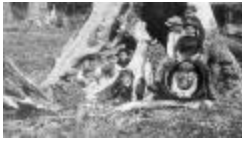
"Dioflues" [?] and Co., with tub and old stump (13a-c004554-d0021-001)