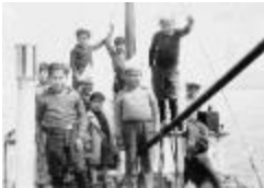
St. Michael's School, Alert Bay, B.C. - Boys of this school (13a-c004554-d0098-001)