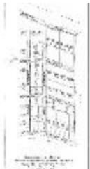
Plan, 1 January 1915 (91a-c000064-d0001-001)