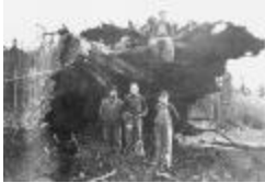
Alert Bay School - Our boys at work (13a-c004554-d0106-001)