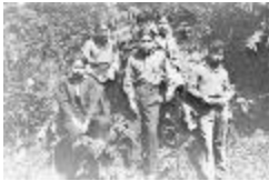
Alert Bay School - Boys of our school (13a-c004554-d0118-001)