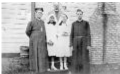
Group outside Alert Bay Preventorium, B.C. (13a-c004554-d1169-001)