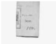
Field Book, 1 November 1904 (91a-c000057-d0001-001)