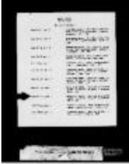
Kwawkwalth Agency - Alert Bay Residential School - Livestock - Supplies - Accounts, 1938-1947 (2056693)