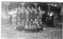
Industrial School boys - St. Michael's School Boy's Home, Alert Bay, B.C. (13a-c004554-d0016-001)