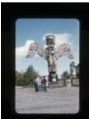
Three unidentified boys and a totem (UCCPMR_20180221_003)