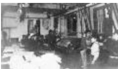
Alert Bay School - Laundry Room (13a-c004554-d0078-001)