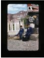
Two unidentified boys and a totem (UCCPMR_20180221_002)