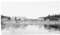
St. Michael's School, Alert Bay, B.C. (13a-c002177-d0053-001)