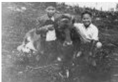
St. Michael's school, Alert Bay, B.C. - All Massett boys of this school (13a-c004554-d0095-001)