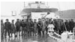
St. Michael's School, Alert Bay, B.C. - Junior Boys visit HMCS "Skeena" (13a-c004554-d0099-001)