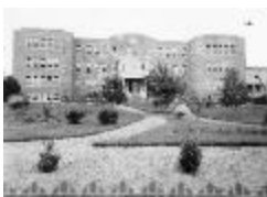
St. Michael's School, Alert Bay, B.C., 1937 (13a-c002177-d0054-001)