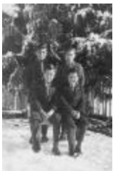
Boys' Industrial School, Alert Bay, B.C. - Class IV (13a-c004554-d0058-001)