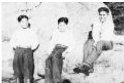
Alert Bay School - Boys of our school (13a-c004554-d0120-001)