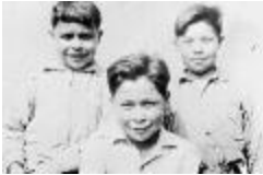
Boys of St. Michael's School, Alert Bay, B.C. (13a-c004554-d0124-001)