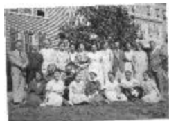
St. Michael's School, Alert Bay, B.C. - Staff (13a-c004554-d1103-001)