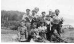
School Boys from Industrial School, Alert Bay, BC. Written on back of picture, "Show me a group of whites who take their work as seriously as these. All land clearing at the school is done by hand. Here are some of the force". (13a-c001805-d0002-001)