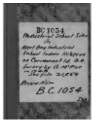
Field Notes, 1 January 1948 (91a-c000056-d0001-001)