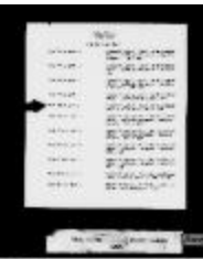
Kwawkwalth Agency - Alert Bay Residential School - School Land, 1932-1948 (2057052)