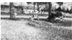
Dairy cow "Ann" and calf - Industrial School, Alert Bay, B.C. (13a-c004554-d0046-001)