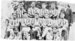
Alert Bay School Football Team (13a-c004554-d0108-001)