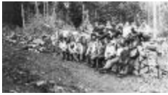
Alert Bay School Wood pacing crew - Job done! (13a-c004554-d0027-001)