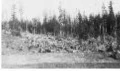
Panorama of cleared land on farm, Alert Bay School - Photo #3 (13a-c004554-d0015-001)