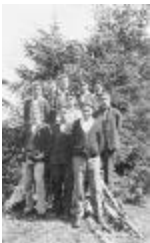
St. Michael's School, Alert Bay, B.C. - Boys of this school