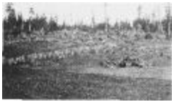
Panorama of farm, Alert Bay School - photo #2 (13a-c004554-d0014-001)