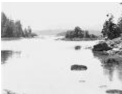
Coastal waters near Alert Bay, B.C. (13a-c004554-d0085-001)