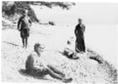
Boys of St. Michael's School, Alert Bay, B.C. (13a-c004554-d0123-001)