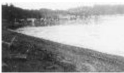
Alert Bay Village from beach near St. Michael's Boys' School (sawmill and church in centre) (13a-c004554-d0002-001)