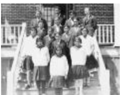
Alert Bay School Music Class (13a-c004554-d0071-001)