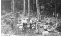
Alert Bay School - boys loading wood (13a-c004554-d0024-001)