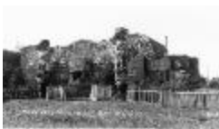
St. Michael's Indian Residential School (13a-c002120-d0001-001)