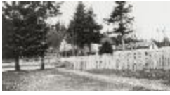
St. Michael's Industrial School for Boys, viewed from approach (13a-c004554-d0012-001)