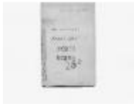
Field Book, 1 January 1904 (91a-c000062-d0001-001)