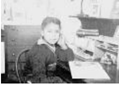
Boys of St. Michael's School, Alert Bay, B.C. (13a-c004554-d0122-001)