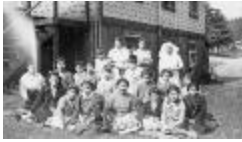
St. Michael's Preventorium, Alert Bay, B.C. - Patients and staff (13a-c004554-d1095-001)