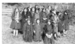
St. Michael's School, Alert bay - Girls of this school (13a-c004554-d0101-001)