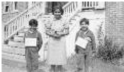
Sewing-room demonstration in activities parade at Alert Bay School (13a-c002177-d0057-001)