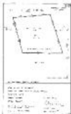
Plan, 1 January 1980 (91a-c000059-d0001-001)