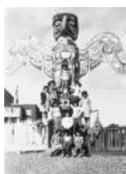
Students and Totem pole at St. Michael's School, Alert Bay (13a-c002177-d0059-001)