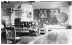
Alert Bay School, B.C. - Wireless station (13a-c004554-d0072-001)