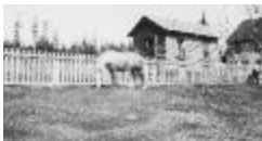
Alert Bay School - Principal's shack and horse "Pat" (13a-c004554-d0047-001)