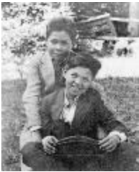
St. Michael's School, Alert Bay, B.C. - All Massett boys of this school (13a-c004554-d0096-001)