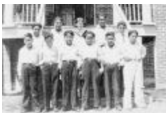
Alert Bay School - Dancers at 1930 Christmas Concert (13a-c004554-d0070-001)