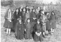
Girls - St. Michael's School, Alert Bay, B.C. (13a-c004554-d0063-001)