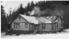
Preventorium, St. Michael's School, Alert Bay, BC (13a-c002177-d0065-001)