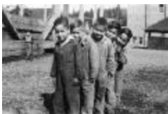
Young School Boys (13a-c002120-d0007-001)