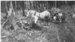
Alert Bay School - Hauling wood (13a-c004554-d0025-001)