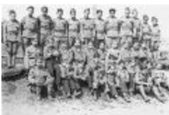
Cadets, St. Michael's School, Alert Bay, B.C.