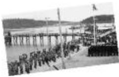
School Cadets and Girl Guides on parade in Alert Bay, B.C. (13a-c004554-d1100-001)