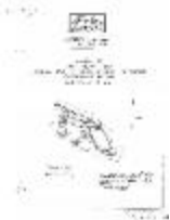
Plan, 1 January 1891 (91a-c000065-d0001-001)