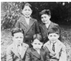
St. Michael's School, Alert Bay, B.C. - All Massett boys of this school (13a-c004554-d0092-001)