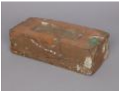
Building Brick (3045/1)