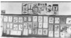
St. Michael's School, Alert Bay, B.C. - Drawings by children at this school (13a-c004554-d0100-001)