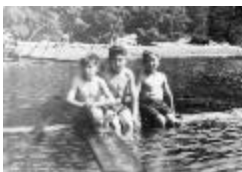
St. Michael's School, Alert Bay, B.C. - Boys of this school (13a-c004554-d0086-001)