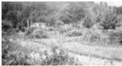
Preventorium and school garden, Alert Bay School (13a-c002177-d0070-001)