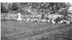
Alert Bay Girls - Prize Giving Day (13a-c004554-d0039-001)