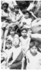
St. Michael's School, Alert Bay, B.C. - Boys of this school (13a-c004554-d0087-001)