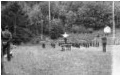
St. Michael's School, Alert Bay, B.C. - Cadets doing outdoor callisthenic exercises (13a-c004554-d1098-001)