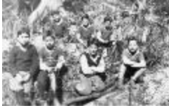
St. Michael's School, Alert Bay, B.C. - All Massett boys of this school (13a-c004554-d0093-001)