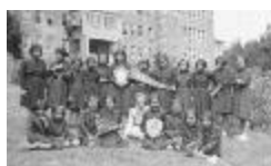
St. Michael's School, upper and lower girls' school teams (13a-c002177-d0060-001)