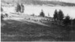
Alert Bay from behind Boy's School - Principal's shed and part of orchard in foreground (13a-c004554-d0006-001)