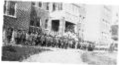
St. Michael's School, Alert Bay, B.C. - All the children of this school (13a-c004554-d0069-001)