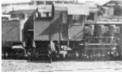
One of our St. Michael's boys at a lumber camp railway (13a-c004554-d0073-001)