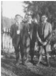
The Boys' Industrial School, Alert Bay, B.C. - Class VI (13a-c004554-d0057-001)