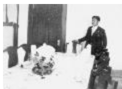
St. Michael's School, Alert Bay, B.C. - Staff dining room and senior student (13a-c004554-d0076-001)