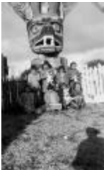
Pupils at St. Michael's Indian Residential School (13a-c002120-d0004-001)