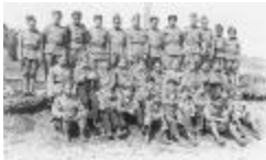
St. Michael's School, Alert Bay, B.C. - Boys of this school (13a-c004554-d0082-001)