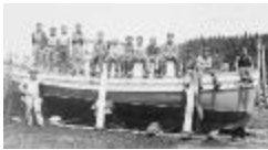
Alert Bay - the "St. Michael" crew and students who built the boat (13a-c002177-d0068-001)