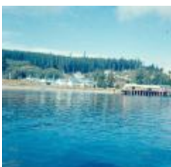
St. Michael's Indian Residential School, Alert Bay, BC (13a-c001543-d0001-001)