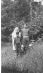
Alert Bay Preventorium, B.C. - My boy ___; he made and gave me the "Totem" picture frame, a swell patient. (13a-c004554-d1093-001)