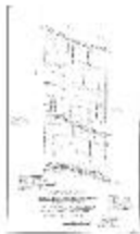
Plan, 1 January 1937 (91a-c000058-d0001-001)