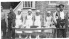
St. Michael's School, Alert Bay B.C., First Aid and Home Nursing Demonstration, 1943 (13a-c002177-d0058-001)