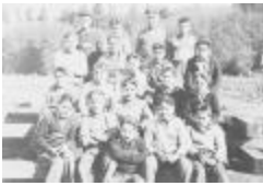
St. Michael's School, Alert Bay, BC - Boys of this school (13a-c004554-d0084-001)