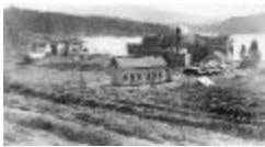
St. Michael's School, Alert Bay, B.C. (13a-c004554-d0105-001)