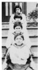
St. Michael's School, Alert Bay, B.C. - Massett Girls (13a-c004554-d0102-001)