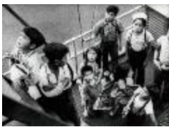
School Children on Deck of Boat (13a-c002179-d0002-001)