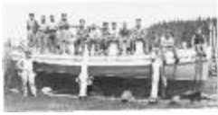
The boat, "St. Michael Alert Bay School" (13a-c004554-d0079-001)