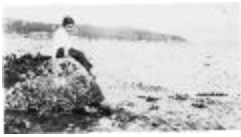
Boys of St. Michael's School, Alert Bay, B.C. (13a-c004554-d0121-001)