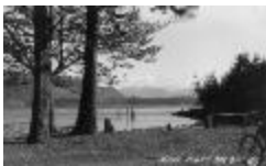
Looking to the Right from the School's Front Door (13a-c002120-d0002-001)