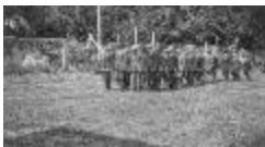
Prize Giving Day - Boy Scouts of Industrial School, Alert Bay, B.C. (13a-c004554-d0018-001)