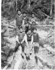
St. Michael's School, Alert Bay, B.C. - All Massett boys of this school (13a-c004554-d0094-001)