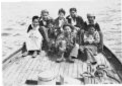
St. Michael's School, Alert Bay, B.C. - Boys of this school (13a-c004554-d0097-001)