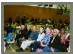
Moderator And friends (5223)