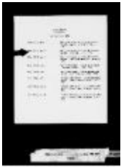
West Coast Agency - Alberni Residential School - Livestock, 1931-1940 (2055999)