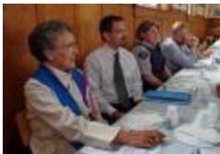
Some representatives of the church and government (38f-c001524-d0006-001)