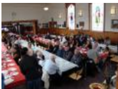
The community gathers (38f-c001524-d0004-001)