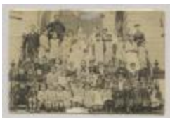
Teachers and students of Crosby Home (38f-c000133)