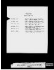
West Coast Agency - Ahousaht Residential School - Inspectors' Reports, 1933-1940 (2055993)