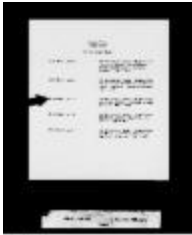
New Westminster Agency - Coqualeetza Industrial School - Inspector Of Construction, 1921-1934 (2057047)