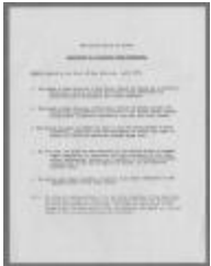
Management Of Government-Owned Residences (38f-c000528-d0017-001)