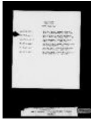
West Coast Agency - Ahousaht Residential School - School Land (Plan), 1907-1936 (2055994)