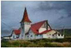
Grace United Church (38f-c001524-d0085-001)