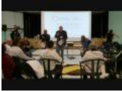
United Church Act of Reconciliation (MDNNE121)