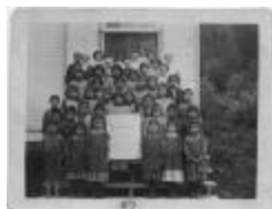
[Elizabeth Long Memorial Home : children and auxiliary women with banner] (13d-c5703-d17)