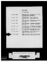
Skeena River Agency - Crosby Girls Residential School (Port Simpson) - Audit Reports, 1935-1948 (2056052)