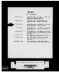
Skeena River Agency - Port Simpson United Church Residential School - Payments Of Grants, 1931-1948 (2056053)