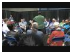
British Columbia National Event: Church Sharing Circle PM 96 (SC096)