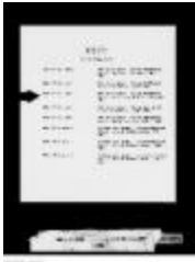
West Coast Agency - Alberni Residential School - Cadet Corps Band Set - Accounts, 1930 (2056000)