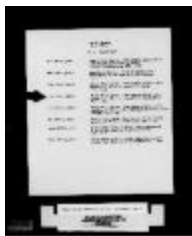
Skeena River Agency - Port Simpson United Church Residential School - Inspector Of Construction, 1913-1914 (2056054)