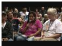
British Columbia National Event: Church Sharing Circle PM 100 (SC100)