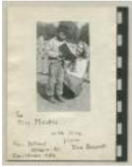
My Family (38f-c000576-d0001-001)