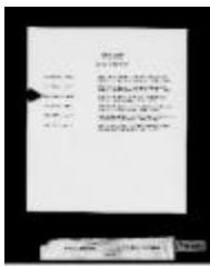
West Coast Agency - Ahousaht Residential School - School Land, 1930-1936 (2055996)