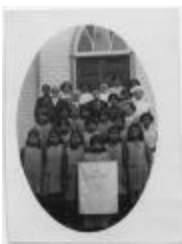
[Elizabeth Long Memorial Home : children and auxiliary women with banner] (13d-c5703-d18)