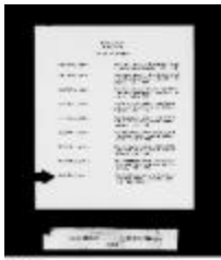
New Westminster Agency - Coqualeetza Industrial School - Teachers' Salaries, 1943-1947 (2055956)