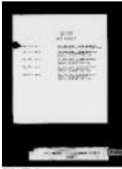
West Coast Agency - Alberni Residential School - Establishment (Plans), 1892-1895 (2056005)