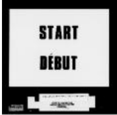
Kamloops Agency - Kamloops Industrial School - Agricultural Land - Irrigation With Accompanying Supplies And Accounts (Plans), 1912-1926 (2096117)