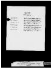
West Coast Agency - Ahousaht Residential School - School Land (Plan), 1907-1936 (2055994)