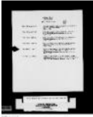
Kamloops Agency - Kamloops Industrial School - Agricultural Land - Irrigation With Accompanying Supplies And Accounts (Plans), 1912-1926 (2056034)