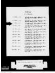
Lytton Agency - St. George's Residential School - Livestock - Accounts, 1933-1943 (2056065)