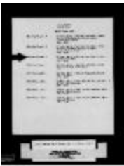
Kootenay Agency - Kootenay Residential School - Livestock - Accounts, 1925-1944 (2056039)