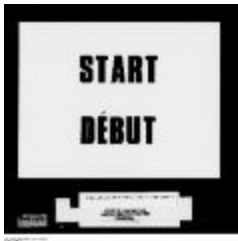
Kamloops Agency - Kamloops Industrial School - Agricultural Land - Irrigation With Accompanying Supplies And Accounts (Plans), 1912-1926 (2096117)