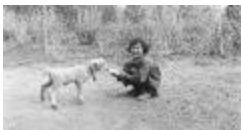
St. George's School, Lytton, B.C. - School girl feeding lamb (13a-c004554-d1038-001)