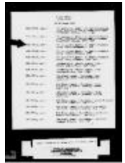
New Westminster Agency - St. Mary's Residential School - Livestock - Supplies, 1931 (2056079)