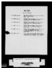
Kamloops Agency - Kamloops Industrial School - Agricultural Land - Irrigation With Accompanying Supplies And Accounts (Plans), 1926-1932 (2056717)