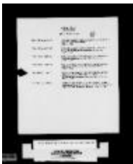
Kamloops Agency - Kamloops Industrial School - Agricultural Land - Irrigation With Accompanying Supplies And Accounts (Plans), 1912-1926 (2056034)