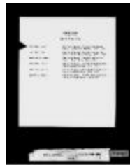
West Coast Agency - Ahousaht Residential School - Inspectors' Reports, 1933-1940 (2055993)