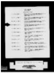
Kamloops Agency - Kamloops Residential School - Livestock - Supplies - Accounts, 1920-1938 (2056029)