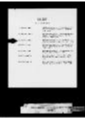
Williams Lake Agency - Caribou Residential School - Livestock - Supplies, 1927-1932 (2056008)