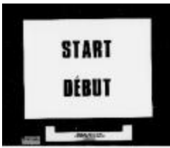
Kootenay Agency - Kootenay Residential School - Livestock - Accounts, 1925-1944 (2096121)