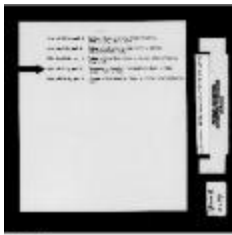
Vancouver Agency - Squamish Residential School - School Lands, 1922-1932 (2054384)