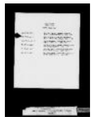
West Coast Agency - Ahousaht Residential School - School Land (Plan), 1907-1936 (2055994)