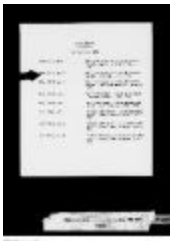
West Coast Agency - Alberni Residential School - Livestock, 1931-1940 (2055999)