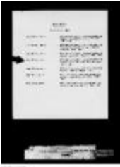
Williams Lake Agency - Caribou Residential School - Cadet Corps Band Set - Accounts, 1945-1946 (2056009)