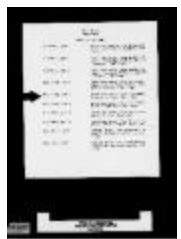
Stuart Lake Agency - Lejac Residential School - Livestock, 1925-1940 (2056023)