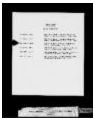
West Coast Agency - Ahousaht Residential School - School Land, 1930-1936 (2055996)