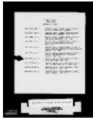
Vancouver Agency - Sechelt Residential School - Livestock - Accounts, 1923-1946 (2056058)