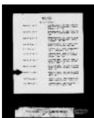
Kwawkwalth Agency - Alert Bay Residential School - Livestock - Supplies - Accounts, 1938-1947 (2056693)