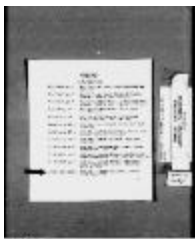
West Coast Agency - Clayoquot Roman Catholic School - Establishment, 1897 (2054355)