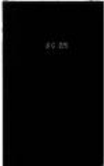
Field Book, 1 January 1891 (91a-c000063-d0001-001)