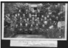
Photograph, 1890 (10a-c000779-d0003-001)