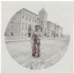
Outdoor portrait of Chief Washakie or Shoots-on-the-Run or The Rattle, posed in front of Shoshone School, Shoshone Reservation, Wyoming. (NMAI_20180402_001)