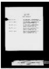
West Coast Agency - Alberni Residential School - Establishment (Plans), 1892-1895 (2056005)