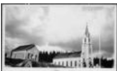
Photograph, 1895 (10a-c000480-d0035-001)