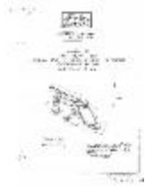
Plan, 1 January 1891 (91a-c000065-d0001-001)