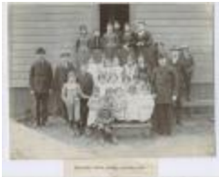
Methodist Indian School, Nanaimo, 1896 (38f-c000151-d0001-001)