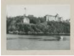
[Alberni?] Residential School (38f-c000591-d0001-002)