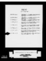
Lytton Agency - St. George's Residential School - Irrigation Accounts, 1935-1948 (2057080)