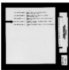
Vancouver Agency - Squamish Residential School - School Lands, 1922-1932 (2054384)