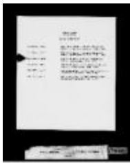
West Coast Agency - Ahousaht Residential School - School Land, 1930-1936 (2055996)