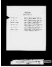
West Coast Agency - Ahousaht Residential School - Inspectors' Reports, 1933-1940 (2055993)