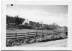
Alberni Residential School (13d-c5699-d17)