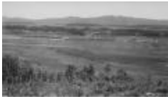
Morley, Alberta (a034670)