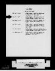
Stikine Agency - Lower Post Residential School (Teslin Lake) - Establishment - Supplies - Accounts (Plans), 1946-1949 (2056176)