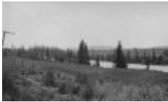
Bow River, Morley (a034669)