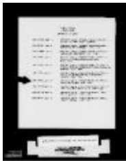
Vancouver Agency - Sechelt Residential School - Livestock - Accounts, 1923-1946 (2056058)