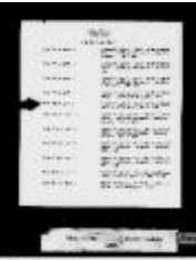
Kwawkwalth Agency - Alert Bay Residential School - School Land, 1932-1948 (2057052)