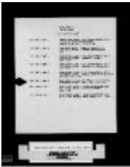
Skeena River Agency - Port Simpson United Church Residential School - School Land, 1913-1914 (2056055)