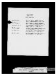
West Coast Agency - Ahousaht Residential School - School Land (Plan), 1907-1936 (2055994)