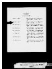
West Coast Agency - Alberni Residential School - Livestock, 1931-1940 (2055999)