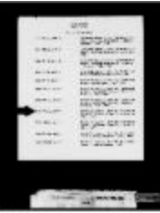
Kwawkwalth Agency - Alert Bay Residential School - Livestock - Supplies - Accounts, 1921-1932 (2055984)