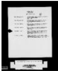
Kamloops Agency - Kamloops Industrial School - Agricultural Land - Irrigation With Accompanying Supplies And Accounts (Plans), 1912-1926 (2056034)