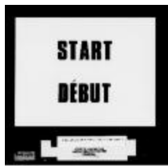
Kamloops Agency - Kamloops Industrial School - Agricultural Land - Irrigation With Accompanying Supplies And Accounts (Plans), 1912-1926 (2096117)