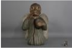
Baptismal Font (A1776 a-c)