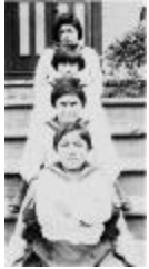
St. Michael's School, Alert Bay, B.C. - Massett Girls (13a-c004554-d0102-001)