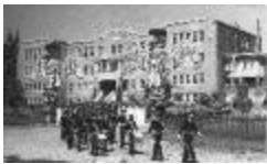
Cadet Corps, St. Michael's School, Alert Bay, BC (13a-c002177-d0069-001)