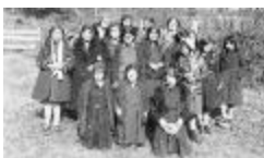
St. Michael's School, Alert bay - Girls of this school (13a-c004554-d0101-001)