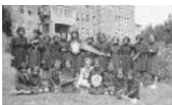
St. Michael's School, upper and lower girls' school teams (13a-c002177-d0060-001)