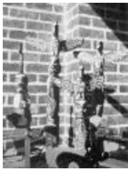
Alert Bay, B.C. - Small totem poles (13a-c004554-d1080-001)