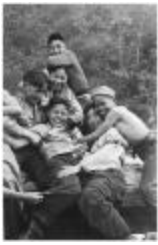
Play Time. A group of boys at Alert Bay school. (13a-c001805-d0003-001)