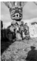
Pupils at St. Michael's Indian Residential School (13a-c002120-d0004-001)