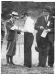
Alert Bay School, B.C. - unidentified group of men (13a-c004554-d1101-001)