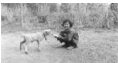
St. George's School, Lytton, B.C. - School girl feeding lamb (13a-c004554-d1038-001)