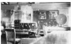
Alert Bay School, B.C. - Wireless station (13a-c004554-d0072-001)