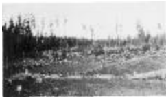
Panorama of Farm, Alert Bay School - Photo #1 (13a-c004554-d0013-001)