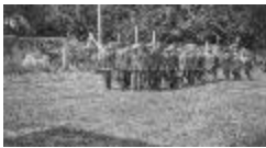
Prize Giving Day - Boy Scouts of Industrial School, Alert Bay, B.C. (13a-c004554-d0018-001)