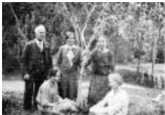
St. George's School, Lytton, B.C. - part of our Staff, consisting of (left to right), self, Sewing Matron, Laundry Matron, Girls' Matron, Supervising Matron (13a-c004554-d1037-001)