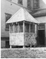
Alert Bay Girls' Home - Outbuilding constructed by Boys' School (13a-c004554-d0043-001)