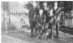
Boys' Industrial School, Alert Bay, B.C. - Class III (13a-c004554-d0061-001)