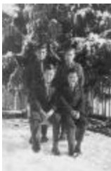
Boys' Industrial School, Alert Bay, B.C. - Class IV (13a-c004554-d0058-001)