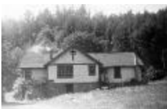
The Preventorium, Alert Bay, B.C. (13a-c002177-d0056-001)