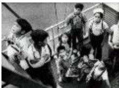
School Children on Deck of Boat (13a-c002179-d0002-001)