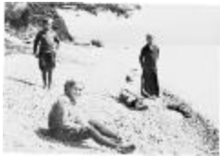
Boys of St. Michael's School, Alert Bay, B.C. (13a-c004554-d0123-001)