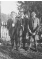
The Boys' Industrial School, Alert Bay, B.C. - Class VI (13a-c004554-d0057-001)