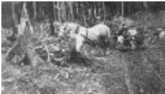
Alert Bay School - Hauling wood (13a-c004554-d0025-001)