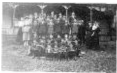
Industrial School boys - St. Michael's School Boy's Home, Alert Bay, B.C. (13a-c004554-d0016-001)