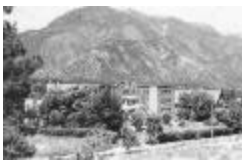
St. George's School, Lytton, BC (13a-c002177-d0257-001)