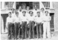
Alert Bay School - Dancers at 1930 Christmas Concert (13a-c004554-d0070-001)