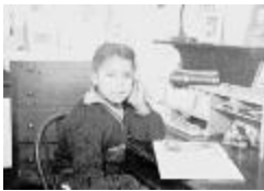
Boys of St. Michael's School, Alert Bay, B.C. (13a-c004554-d0122-001)