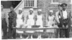
St. Michael's School, Alert Bay B.C., First Aid and Home Nursing Demonstration, 1943