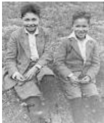
Five of our finest boys (13a-c004554-d0065-001)