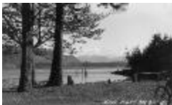
Looking to the Right from the School's Front Door (13a-c002120-d0002-001)