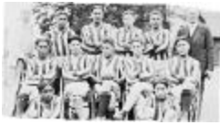
Alert Bay School Football Team (13a-c004554-d0108-001)