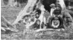
"Dioflues" [?] and Co., with tub and old stump (13a-c004554-d0021-001)