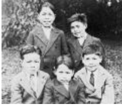
St. Michael's School, Alert Bay, B.C. - All Massett boys of this school (13a-c004554-d0092-001)