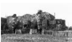
St. Michael's Indian Residential School (13a-c002120-d0001-001)