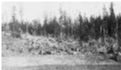
Panorama of cleared land on farm, Alert Bay School - Photo #3 (13a-c004554-d0015-001)