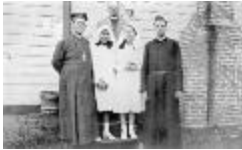
Group outside Alert Bay Preventorium, B.C. (13a-c004554-d1169-001)