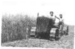
Harvesting operations, Alert Bay School (13a-c002177-d0066-001)