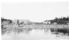
St. Michael's School, Alert Bay, B.C. (13a-c002177-d0053-001)