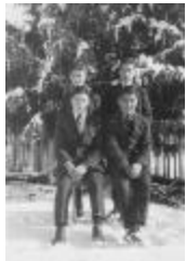
The Boys' Industrial School, Alert Bay, B.C. - Class V (13a-c004554-d0056-001)