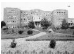
St. Michael's School, Alert Bay, B.C., 1937