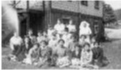
St. Michael's Preventorium, Alert Bay, B.C. - Patients and staff (13a-c004554-d1095-001)