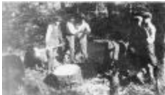
Alert Bay School - Boys sawing and splitting wood (13a-c004554-d0026-001)