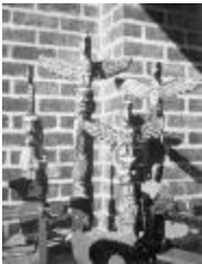
Alert Bay, boys' handicrafts (13a-c002177-d0061-001)