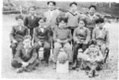
Alert Bay School - Junior Soccer Team (13a-c004554-d0109-001)