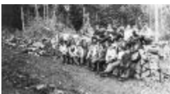
Alert Bay School Wood picing crew - Job done! (13a-c004554-d0027-001)