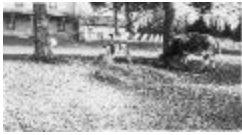
Dairy cow "Ann" and calf - Industrial School, Alert Bay, B.C. (13a-c004554-d0046-001)