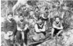
St. Michael's School, Alert Bay, B.C. - All Massett boys of this school (13a-c004554-d0093-001)