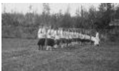
Alert Bay Girls - Prize Giving Day (13a-c004554-d0038-001)