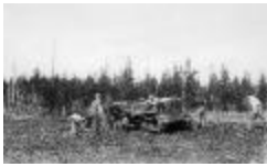
Farming at the Alert School. (13a-c001805-d0009-001)