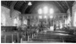
St. George's School Chapel, Lytton, BC (13a-c002177-d0255-001)