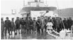
St. Michael's School, Alert Bay, B.C. - Junior Boys visit HMCS "Skeena" (13a-c004554-d0099-001)