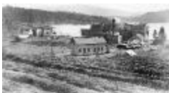
St. Michael's School, Alert Bay, B.C. (13a-c004554-d0105-001)