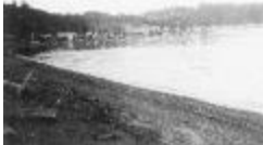
Alert Bay Village from beach near St. Michael's Boys' School (sawmill and church in centre) (13a-c004554-d0002-001)