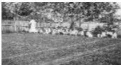
Alert Bay Girls - Prize Giving Day (13a-c004554-d0039-001)