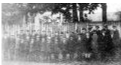
St. Michael's Boys' School students, Alert Bay, BC (13a-c004554-d0017-001)