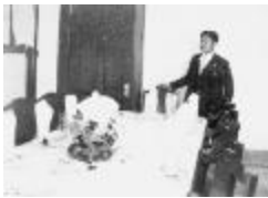
St. Michael's School, Alert Bay, B.C. - Staff dining room and senior student (13a-c004554-d0076-001)