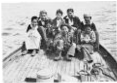
St. Michael's School, Alert Bay, B.C. - Boys of this school (13a-c004554-d0097-001)