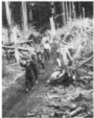
Alert Bay School - boys packing blocks of wood from forest (13a-c004554-d0023-001)