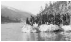
Lytton, B.C. - Group of St. George's students standing on beached ice blocks, at edge of Lytton Creek (13a-c004554-d1039-001)