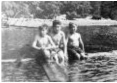
St. Michael's School, Alert Bay, B.C. - Boys of this school (13a-c004554-d0086-001)