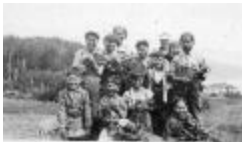
School Boys from Industrial School, Alert Bay, BC. Written on back of picture, "Show me a group of whites who take their work as seriously as these. All land clearing at the school is done by hand. Here are some of the force". (13a-c001805-d0002-001)