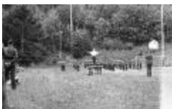
St. Michael's School, Alert Bay, B.C. - Cadets doing outdoor callisthenic exercises (13a-c004554-d1098-001)