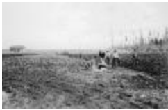
Farming at the Alert Bay School (13a-c001805-d0010-001)