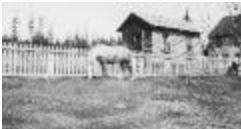
Alert Bay School - Principal's shack and horse "Pat" (13a-c004554-d0047-001)