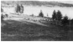
Alert Bay from behind Boy's School - Principal's shed and part of orchard in foreground (13a-c004554-d0006-001)