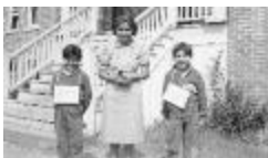
Sewing-room demonstration in activities parade at Alert Bay School (13a-c002177-d0057-001)