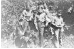
Alert Bay School - Boys of our school (13a-c004554-d0118-001)