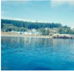
St. Michael's Indian Residential School, Alert Bay, BC (13a-c001543-d0001-001)