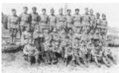
St. Michael's School, Alert Bay, B.C. - Boys of this school (13a-c004554-d0082-001)