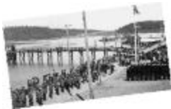
School Cadets and Girl Guides on parade in Alert Bay, B.C. (13a-c004554-d1100-001)