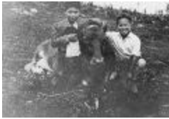
St. Michael's school, Alert Bay, B.C. - All Massett boys of this school (13a-c004554-d0095-001)