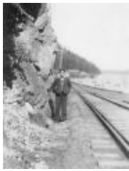
Lumber camp railway line near Alert Bay, B.C. (13a-c004554-d0089-001)