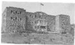
St. Michael's School, Alert Bay, B.C. - taken on the day of our closing exercises (13a-c004554-d0062-001)