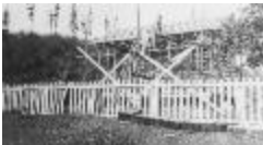
Alert Bay School - Principal building shack (13a-c004554-d0045-001)