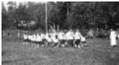
Alert Bay Girls - Prize Giving Day (13a-c004554-d0037-001)