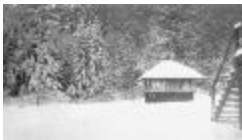
Alert Bay School, B.C. - Lots of snow behind preventorium (13a-c004554-d1081-001)