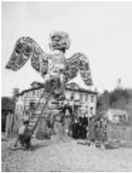
Alert Bay, B.C. - Totem pole (13a-c004554-d1075-001)