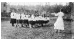
Alert Bay Girls - Prize Giving Day (13a-c004554-d0035-001)