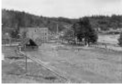
Alert Bay School (13a-c002177-d0055-001)