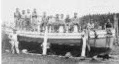
Alert Bay - the "St. Michael" crew and students who built the boat (13a-c002177-d0068-001)