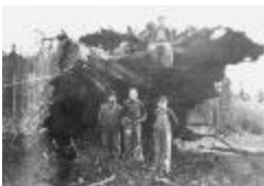
Alert Bay School - Our boys at work (13a-c004554-d0106-001)