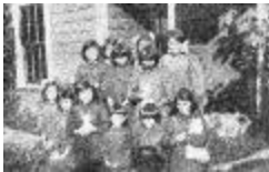
Lytton School Girls (13a-c005013-d0010-001)