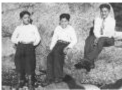
Five of our finest boys (13a-c004554-d0064-001)