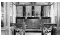
St. George's Church - Interior, Lytton, B.C. (13a-c004554-d1040-001)