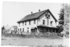
Alert Bay "Boys" - The old Boys School (39 years old) (13a-c004554-d1086-001)