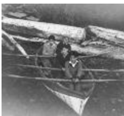
Boys of our school, St. Michael's, in row boat (13a-c004554-d0067-001)