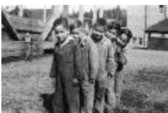
Young School Boys (13a-c002120-d0007-001)