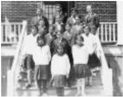
Alert Bay School Music Class (13a-c004554-d0071-001)