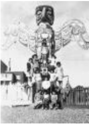
Students and Totem pole at St. Michael's School, Alert Bay (13a-c002177-d0059-001)