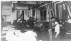
Alert Bay School - Laundry Room (13a-c004554-d0078-001)