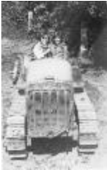
Alert Bay School - girls that stayed in summer time (13a-c004554-d0113-001)