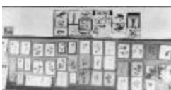
St. Michael's School, Alert Bay, B.C. - Drawings by children at this school (13a-c004554-d0100-001)