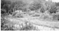
Preventorium and school garden, Alert Bay School (13a-c002177-d0070-001)