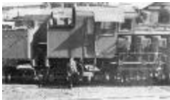
One of our St. Michael's boys at a lumber camp railway (13a-c004554-d0073-001)