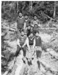
St. Michael's School, Alert Bay, B.C. - All Massett boys of this school (13a-c004554-d0094-001)