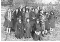
Girls - St. Michael's School, Alert Bay, B.C. (13a-c004554-d0063-001)