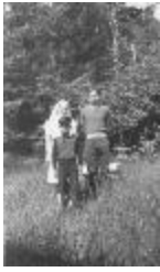
Alert Bay Preventorium, B.C. - My boy ___; he made and gave me the "Totem" picture frame, a swell patient. (13a-c004554-d1093-001)