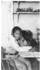
Alert Bay School, B.C. - One of our boys sitting at wireless radio desk (13a-c004554-d0074-001)