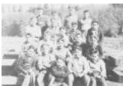
St. Michael's School, Alert Bay, BC - Boys of this school (13a-c004554-d0084-001)