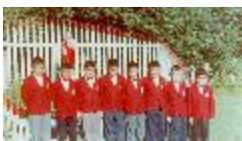
Boys of Sechelt IRS (13a-c005007-d0383-001)