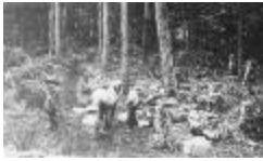
Alert Bay School - boys loading wood (13a-c004554-d0024-001)