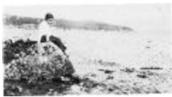
Boys of St. Michael's School, Alert Bay, B.C. (13a-c004554-d0121-001)