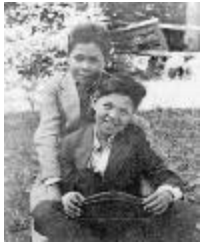
St. Michael's School, Alert Bay, B.C. - All Massett boys of this school (13a-c004554-d0096-001)