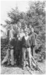
St. Michael's School, Alert Bay, B.C. - Boys of this school (13a-c004554-d0083-001)