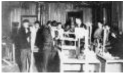
Alert Bay School - wood working class (13a-c004554-d0075-001)