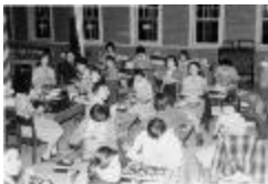
Pupils at St. George's School (13a-c001966-d0001-001)