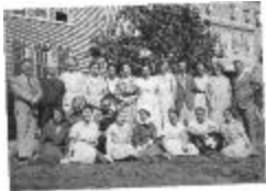
St. Michael's School, Alert Bay, B.C. - Staff (13a-c004554-d1103-001)