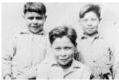
Boys of St. Michael's School, Alert Bay, B.C. (13a-c004554-d0124-001)