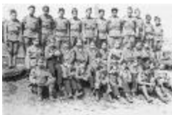
Cadets, St. Michael's School, Alert Bay, B.C. (13a-c004554-d1102-001)