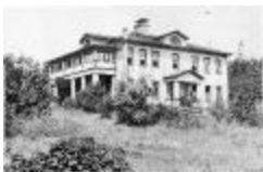
Alert Bay "Girls" - The Girls' Home on Cormorant Island, north end of Vancouver Island (13a-c004554-d1087-001)