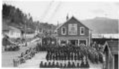
Alert Bay, B.C. - School Cadets and Girls Guides assembled in town for special ceremony [Remembrance Day?] (13a-c004554-d1099-001)