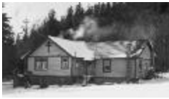
Preventorium, St. Michael's School, Alert Bay, BC (13a-c002177-d0065-001)