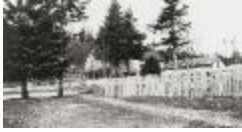
St. Michael's Industrial School for Boys, viewed from approach (13a-c004554-d0012-001)