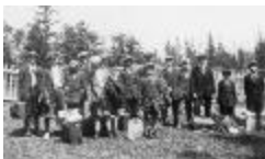
Alert Bay boys - off for the holidays (13a-c004554-d0032-001)