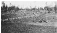
Panorama of farm, Alert Bay School - photo #2 (13a-c004554-d0014-001)