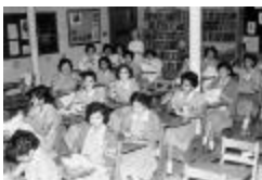
Pupils at St. George's School (13a-c001966-d0002-001)