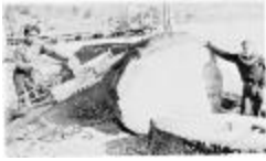
Alert Bay School - Our boys sawing wood (13a-c004554-d0107-001)