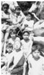
St. Michael's School, Alert Bay, B.C. - Boys of this school (13a-c004554-d0087-001)