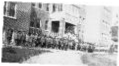
St. Michael's School, Alert Bay, B.C. - All the children of this school (13a-c004554-d0069-001)