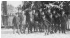
Boys' Industrial School, Alert Bay, B.C. - Class I (13a-c004554-d0059-001)