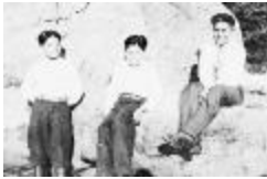
Alert Bay School - Boys of our school (13a-c004554-d0120-001)