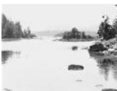
Coastal waters near Alert Bay, B.C. (13a-c004554-d0085-001)