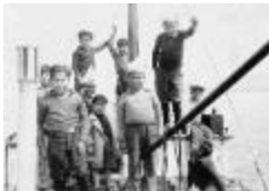
St. Michael's School, Alert Bay, B.C. - Boys of this school (13a-c004554-d0098-001)