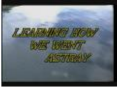
Learning how we went astray (38f-c001581-d0004-001)