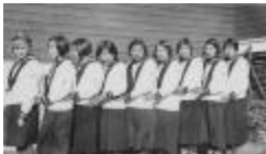
C.G.I.T. Canadian Girls in Training, United Church (a034751)