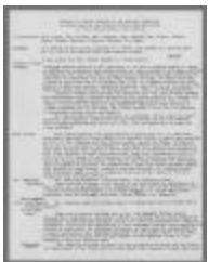
Minutes of a regular meeting of the Advisory Committee on Indian Work in the Alberni Valley (38f-c000516-d0004-001)