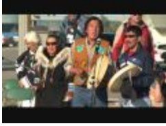
Opening Ceremonies (MDNNE114b)