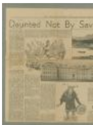
Daunted Not By Savage Curses (38f-c000058-d0022-001)