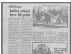
Indian School Here 80 Years (38f-c000527-d0002-001)