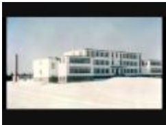
Survol des témoignages au Québec / Overview of Quebec statements (MDQH101)