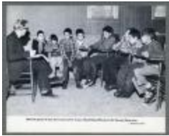
Midweek group of boys (38f-c000941-d0001-003)