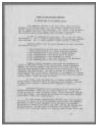
Report Of The Advisory Committee To Indian Work In The Alberni Valley (38f-c000516-d0001-001)