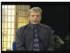
Questions about Residential Schools (38f-c001581-d0007-001)