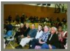
Moderator And friends (5223)