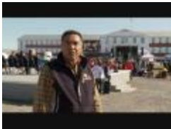
Bearing Witness (MDNNE103a)