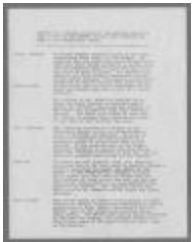
Minutes of a regular meeting of the Advisory Board to Indian Work in the Alberni Valley (38f-c000516-d0006-001)