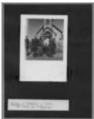
Photograph, 1939 (10a-c000618-d0001-001)