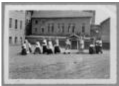
Photograph, 10 June 1951 (10a-c000617-d0010-001)