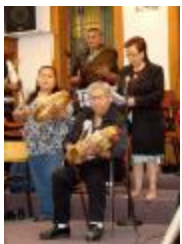
The Four Crest Singers (38f-c001524-d0177-001)