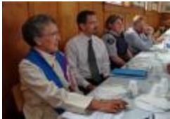
Some representatives of the church and government (38f-c001524-d0006-001)