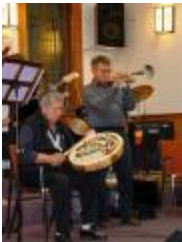
The Four Crest Singers (38f-c001524-d0174-001)