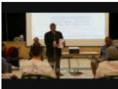
Presbyterian Act of Reconciliation (MDNNE117)