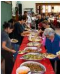
The feast (38f-c001524-d0071-001)