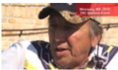
Pipe Ceremony (MDWNE111b)