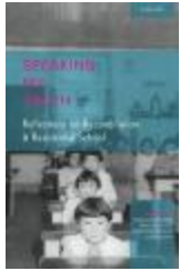
"Speaking my truth" : reflections on reconciliation & residential school (7283167)