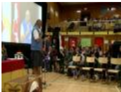
Expressions of Reconciliation - Day 4 (MDNNE108)