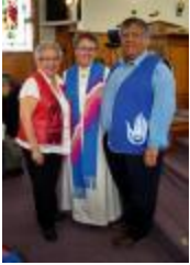
United Church and First Nations elders (38f-c001524-d0063-001)