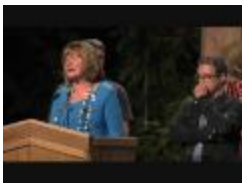
Honorary Witnesses on Truth and Reconciliation (MDOCE104)