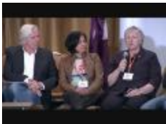
Honorary Witnesses on Moving Forward (MDOCE106)