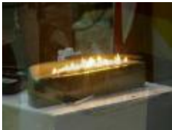
Expressions of Reconciliation - Day 2 (MDNNE107)