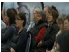
Screening of Hope (MDNNE118a)