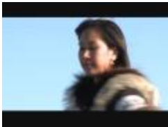
Welcome to Inuvik (MDNNE122a)