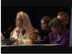
A National Journey for Reconciliation (MDAB652)