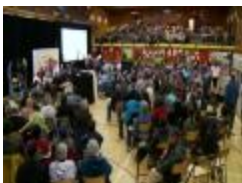
Interpreters of the Truth (MDNNE110)