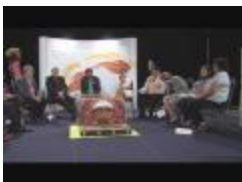
Road to Reconciliation (MDANE107)