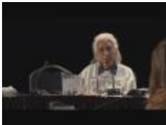
Commissioners Sharing panel (MDANE102)