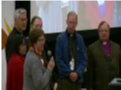
Expressions of Reconciliation - Anglican Church (MDNNE106a)