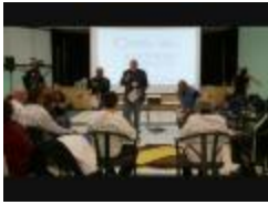
United Church Act of Reconciliation (MDNNE121)