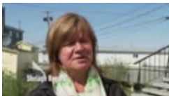
Honourary Witness Ceremony (MDNNE126)