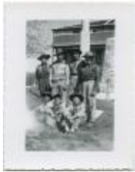
Boys' supervisor and a few of his 24 Boy Scouts, File Hills Residential School, Sask.