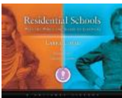
Residential schools : with the words and images of survivors (7873518)