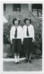
[Two Indian girls from the C.G.I.T. group, File Hills Residential School, Sask.] (13d-c5708-d9)