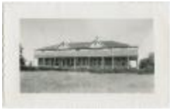
File Hills Indian Residential School, Balcarres, Sask. (13d-c5708-d17)