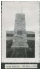
Cairn unveiled June 4th, 1939 (13d-c5708-d2)