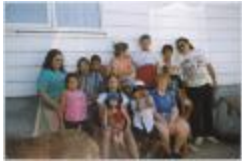
Healing Fund -Trip to Kenossee Lake, White Bear Reserve, Birtle Residential School -Wanapew United Church File Hills First Nation (13d-c5708-d33)