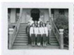
Graduating class, File Hills Residential School (13d-c5708-d24)