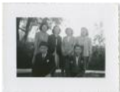
Pupils who went to Brandon for Yr. IX or Gr. X, File Hills Residential School (13d-c5708-d28)