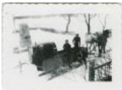
Two lady staff members going into Balcarres by sleigh (13d-c5708-d32)