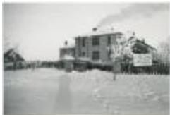
File Hills Residential School, Saskatchewan (13d-c5708-d7)