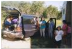
Healing Fund- Loading vans for Trip to Kenossee, White Bear and Birtle Residential School. Wanapew United Church, File Hills (13d-c5708-d33-p15)