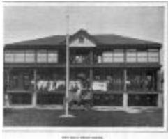
File Hills Indian School (13d-c5708-d23)