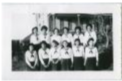
C.G.I.T. group, File Hills Residential School, Sask. (13d-c5708-d8)