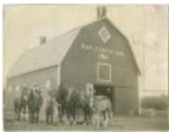
Indian home on the File Hills Colony (13d-c5708-d4)