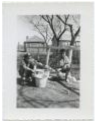
[Two boys who have finished white washing a fence, File Hills Residential School, Sask.] (13d-c5708-d29)