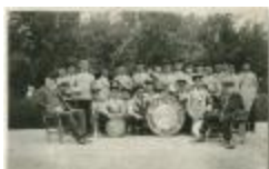
File Hills Indian Colony Band (13d-c5708-d5)