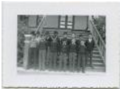
Members of the Cubs, File Hills Residential School, Sask. (13d-c5708-d21)