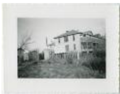
[Entrance to File Hills Residential School, Sask.] (13d-c5708-d13)