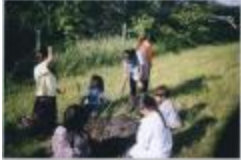
Wiener Roast -cross Placing Day (13d-c5708-d33-p8)