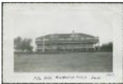
File Hills Residential School Sask [Saskatchewan] (13d-c5708-d1)