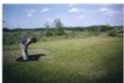
Ron Keewatin -preparing sacred fire pit (13d-c5708-d33-p4)