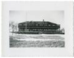
View of File Hills Residential School from the girls' playground (13d-c5708-d15)