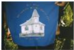
Quilt square for General Council 2000 Toronto (13d-c5708-d33-p9)