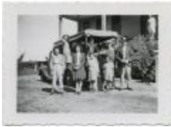
[Students going home to Fort Qu'Appelle from File Hills Residential School, Sask.] (13d-c5708-d30)