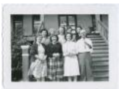
[Faculty of File Hills Residential School, Sask.] (13d-c5708-d27)