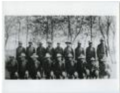
Indian Boy Scouts, File Hills Residential School, Sask. (13d-c5708-d20)