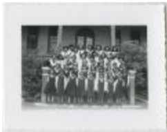
[C.G.I.T. group, File Hills Residential School, Sask.] (13d-c5708-d12)