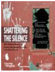
Shattering the silence : the hidden history of Indian residential schools in Saskatchewan (992527243603479)