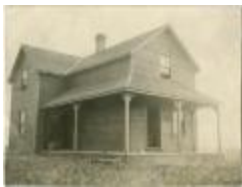
[Maple Grove Farm 1911 : a barn and horse team on the File Hills Colony belonging to a graduate of an Industrial School] (13d-c5708-d3)