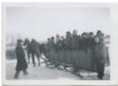
[Students on a box sleigh, File Hills Indian Residential School] (13d-c5708-d31)