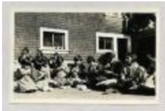
Junior Knitting Class, Ahousaht (38f-c000112-d0001-001)