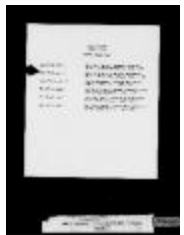
West Coast Agency - Ahousaht Residential School - School Land (Plan), 1907-1936 (2055994)