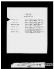
West Coast Agency - Ahousaht Residential School - Inspectors' Reports, 1933-1940 (2055993)