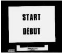
Kootenay Agency - Kootenay Residential School - Livestock - Accounts, 1925-1944 (2096121)