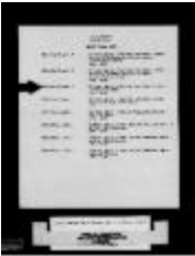
Kootenay Agency - Kootenay Residential School - Livestock - Accounts, 1925-1944 (2056039)