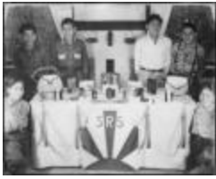
Photograph, 1958 (10a-c000480-d0054-001)