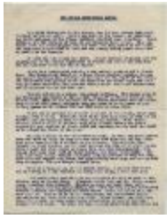
The Indian Residential School (MOA_20180215_005)