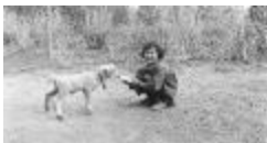
St. George's School, Lytton, B.C. - School girl feeding lamb (13a-c004554-d1038-001)