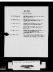
Kamloops Agency - Kamloops Industrial School - Agricultural Land - Irrigation With Accompanying Supplies And Accounts (Plans), 1926-1932 (2056717)