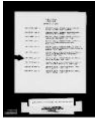
Vancouver Agency - Sechelt Residential School - Livestock - Accounts, 1923-1946 (2056058)