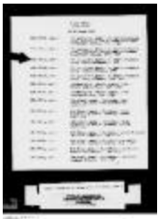
New Westminster Agency - St. Mary's Residential School - Livestock - Supplies, 1931 (2056079)