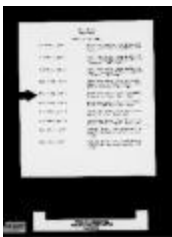
Stuart Lake Agency - Lejac Residential School - Livestock, 1925-1940 (2056023)