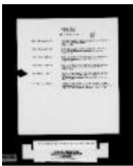
Kamloops Agency - Kamloops Industrial School - Agricultural Land - Irrigation With Accompanying Supplies And Accounts (Plans), 1912-1926 (2056034)