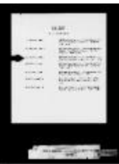
Williams Lake Agency - Caribou Residential School - Livestock - Supplies, 1927-1932 (2056008)