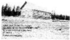
Log school built by Indians at Anahim Lake (38b-c000818-d0002-001)