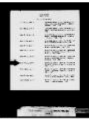
Kwawkwalth Agency - Alert Bay Residential School - Livestock - Supplies - Accounts, 1921-1932 (2055984)