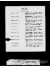
Kwawkwalth Agency - Alert Bay Residential School - Livestock - Supplies - Accounts, 1938-1947 (2056693)