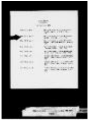
West Coast Agency - Alberni Residential School - Livestock, 1931-1940 (2055999)