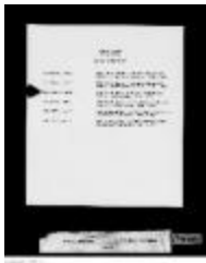
West Coast Agency - Ahousaht Residential School - School Land, 1930-1936 (2055996)