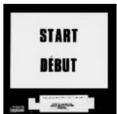
Kamloops Agency - Kamloops Industrial School - Agricultural Land - Irrigation With Accompanying Supplies And Accounts (Plans), 1912-1926 (2096117)