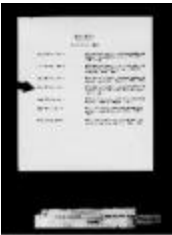
Williams Lake Agency - Caribou Residential School - Cadet Corps Band Set - Accounts, 1945-1946 (2056009)