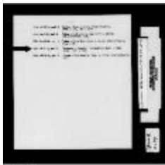
Vancouver Agency - Squamish Residential School - School Lands, 1922-1932 (2054384)