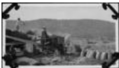
Photograph, 1926 (10a-c000511-d0027-001)