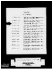
Lytton Agency - St. George's Residential School - Livestock - Accounts, 1933-1943 (2056065)