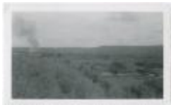
Road leading from the school across the bridge to the Reserve, Round Lake Sask. (13d-c5710-d25)