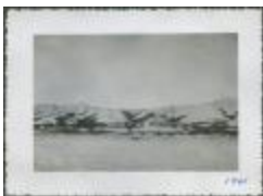
[View of the school from the lake] (13d-c5710-d2)