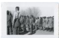
Indian children at flag raising at beginning of every school day, Round Lake, Sask. (13d-c5710-d18)