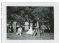
Indian Children In Theatrical Costumes : We Were Invited To Take The Program To Some Towns, But Someone With Higher Authority Than The Staff Said "no More" (13d-c5710-d4)