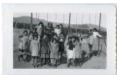
Girls with their dress-up hats at the swings on their playground, Round Lake, Sask. (13d-c5710-d20)