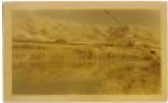
Principal's Residence, Round Lake Residential School (13d-c5710-d12)