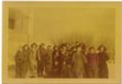
[Indian girls from Round Lake Residential School outside the mission] (13d-c5710-d13)