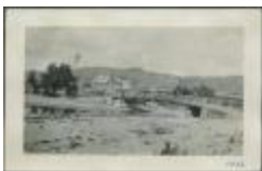
Round Lake [Residential School] (13d-c5710-d1)