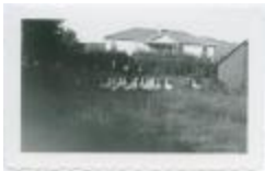
Mr. Bell's ducks with the school building in the background, Round Lake, Sask. (13d-c5710-d16)