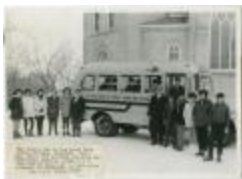
Church bus on the Round Lake Indian mission, Grenfell, Sask. : the students are from the Sintaluta Reserve, grades 7 & 8 : they are on their way to join other students at Broadview, Sask. (13d-c5710-d31)