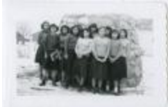
C.G.I.T. girls (not in uniform) in front of the cairn, Round Lake Residential School, Sask. (13d-c5710-d10)