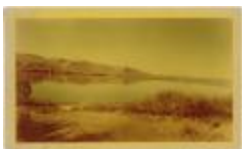
Round Lake taken from the school property : across the Lake is the Reserve (13d-c5710-d27)