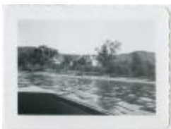
The residence and the school from the Lake with the Qu'Appelle hills in the background (13d-c5710-d23)