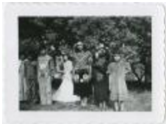
Indian Children In Theatrical Costumes : We Were Invited To Take The Program To Some Towns, But Someone With Higher Authority Than The Staff Said "no More" (13d-c5710-d7)