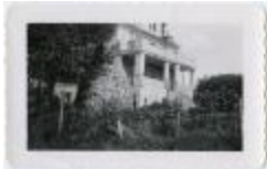
A view of the residence with the cairn, Round Lake Residential School, Sask. (13d-c5710-d24)