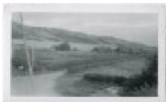
Road leading out from the school to the Principal's Residence with the Qu'Appelle hills in the background, Round Lake, Sask. (13d-c5710-d26)