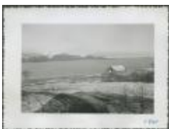
Round Lake [Residential School] (13d-c5710-d3)