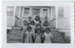
Some of the children on the steps of the school, Round Lake, Sask. (13d-c5710-d19)