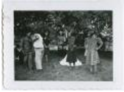
Indian Children In Theatrical Costumes : We Were Invited To Take The Program To Some Towns, But Someone With Higher Authority Than The Staff Said "no More" (13d-c5710-d5)