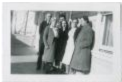
[Staff of the Round Lake Residential School, Sask.] (13d-c5710-d14)