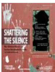
Shattering the silence : the hidden history of Indian residential schools in Saskatchewan (992527243603479)