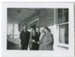
[Staff of the Round Lake Residential School, Sask.] (13d-c5710-d15)