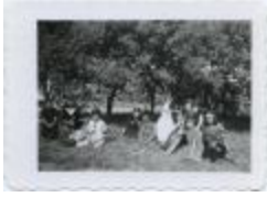
Indian Children In Theatrical Costumes : We Were Invited To Take The Program To Some Towns, But Someone With Higher Authority Than The Staff Said "no More" (13d-c5710-d6)