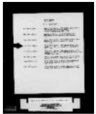
Skeena River Agency - Port Simpson United Church Residential School - Inspector Of Construction, 1913-1914 (2056054)