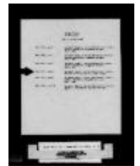
Vancouver Agency - Sechelt Residential School - Inspectors Of Construction, 1921-1922 (2057640)