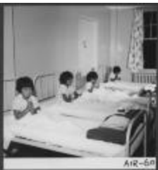
Alberni Indian Residence Alberni, B. C. Smallest girls saying prayers. (13d-c5699-d43)