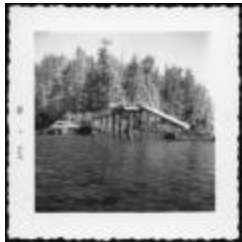
Photograph, April 1962 (10a-c000429-d0040-001)