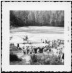
Photograph, June 1961 (10a-c000429-d0005-001)