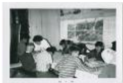
[Scenes from Norway House vacation school] (13d-c5712-d132)