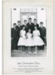
1962 Graduation Class, Alberni Indian Residential School (38f-c000154-d0001-001)