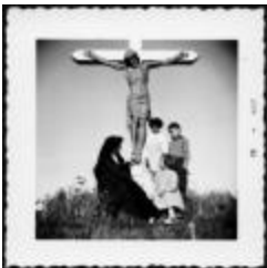
Photograph, June 1961 (10a-c000429-d0029-001)