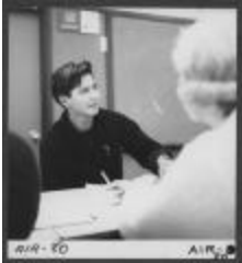
Alberni Indian Residence Alberni, B. C. E. J. Dunn School in Port Alberni. Indian boy facing camera involved with others in discussion. (13d-c5699-d51)