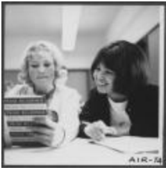
Alberni Indian Residence Alberni, B. C. Girls in class at E. J. Dunn School in Port Alberni, where some of the Indian residence students go. (13d-c5699-d49)