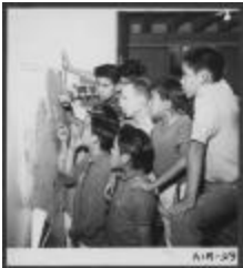
Alberni Indian Residence Alberni, B. C. Boys looking at map during study period. With them is their grade counsellor who looks after their general welfare. (13d-c5699-d36)