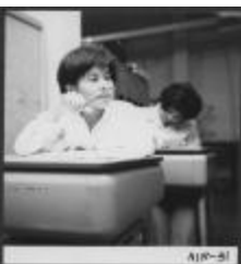
Alberni Indian Residence Alberni, B. C. Girl at desk in study room. Each grade level has its own room for study. (13d-c5699-d37)