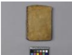
Book Cover (1597/1)