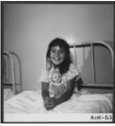
Alberni Indian Residence Alberni, B. C. Little girl in bed with doll. (13d-c5699-d45)