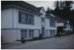
[Building facade] (13d-c5699-d74)