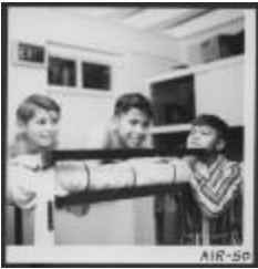
Alberni Indian Residence Alberni, B. C. Boys in boys' dormitory before bedtime. (13d-c5699-d40)