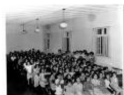
[Students in the assembly hall of the Alberni Indian Residential School] (13d-c5699-d15)