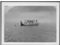
Photograph, 1960 (10a-c000430-d0009-001)