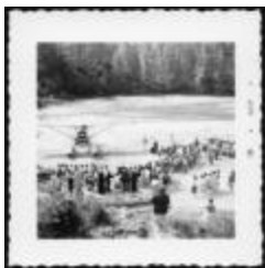
Photograph, June 1961 (10a-c000429-d0013-001)