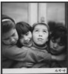
Alberni Indian Residence Alberni, B. C. Four girls in front of door of Residence. (13d-c5699-d23)