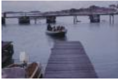
5 year olds arriving (sic) United Church school Norway House (13d-c5712-d149)