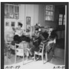
Alberni Indian Residence Alberni, B. C. Kindergarten at residence. (13d-c5699-d53)