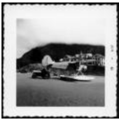
Photograph, June 1961 (10a-c000429-d0001-001)