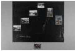
Alert Bay (432/25)