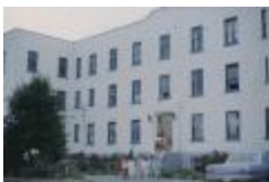
Alberni Indian Residence (13d-c5699-d72)