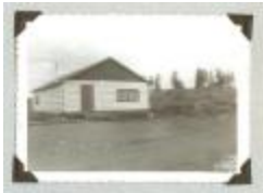
Bâtiments en 1962 (45p-c000006-Batiments en 1962)