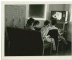
[Male students with back towards the camera watching TV] (13d-c5713-d28)