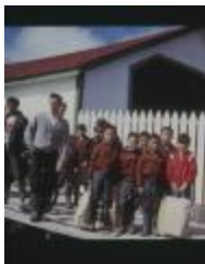
Children from the Old Norway Residential School, 1965, going home in June with new jackets (13d-c5712-d138)