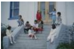
[Children seated by the front steps] (13d-c5699-d73)