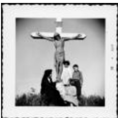
Photograph, June 1961 (10a-c000429-d0031-001)