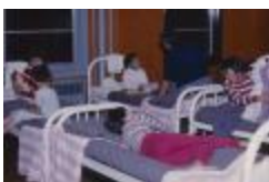
Primary grades dorm. [dormitory] at U.C. [United Church] day and residential school (13d-c5712-d156)