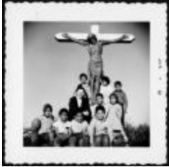
Photograph, April 1962 (10a-c000429-d0036-001)