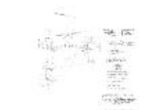
Plan, 1 January 1960 (91a-c000055-d0001-001)