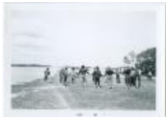
Recreation time at C.V.S., Norway House (13d-c5712-d133)