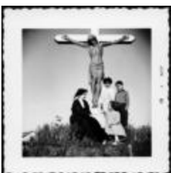
Photograph, June 1961 (10a-c000429-d0032-001)