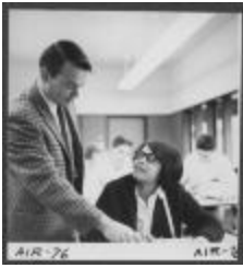
Alberni Indian Residence Alberni, B. C. Teacher and Indian student at the E. J. Dunn School in Port Alberni. (13d-c5699-d50)