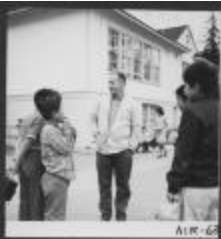
Alberni Indian Residence Alberni, B. C. Exterior of Residence. Boys with one of the housemasters. (13d-c5699-d46)