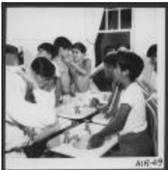
Alberni Indian Residence Alberni, B. C. Boys washing up for bed. (13d-c5699-d39)