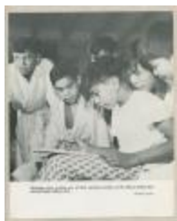
Dormitory party watches one of their painting members, at the Alberni Indian Residential School, Alberni, B.C. (38f-c000282-d0006-001)