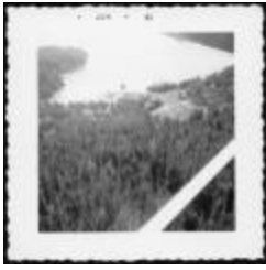
Photograph, June 1961 (10a-c000429-d0045-001)