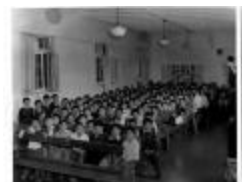
[Students in the assembly hall of the Alberni Indian Residential School] (13d-c5699-d14)