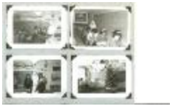
Autres photos de 1966 (45p-c000006-Autres photos 1966)