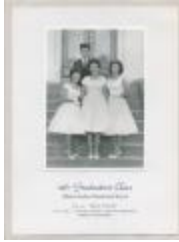
1961 Graduation Class, Alberni Indian Residential School (38f-c000153-d0001-001)