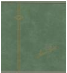
Alberni Indian Residential School Scrapbook (38f-c000003-d0001-001)