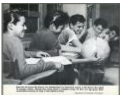
Boys from the Curve Lake Reserve (38f-c000941-d0001-006)