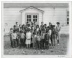
Students and teachers, Morley Indian Residential School (13d-c5705- d23)