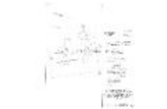
Plan, 1 January 1960 (91a-c000054-d0001-001)