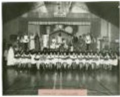
Christmas 1963 Portage la Prairie (13d-c5713-d7)