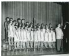
Portage Indian Student Glee Club 1967 (13d-c5713-d8)