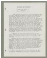
Discipline And Our Children (38f-c000924-d0004-006)