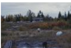
Marshy area around Norway House (13d-c5712-d145)