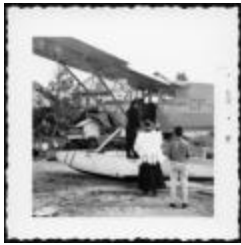
Photograph, June 1961 (10a-c000429-d0012-001)