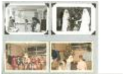
Photos diverses (45p-c000006-Photos diverses)