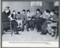
Midweek group of boys (38f-c000941-d0001-003)