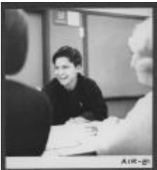
Alberni Indian Residence Alberni, B. C. Indian boy participating in discussion at E. J. Dunn School in Port Alberni. (13d-c5699-d52)