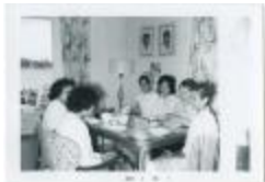
This looks like Saturday lunch hour : all these girls but one has gone out to school at Winnipeg or Portage : they were with me for about two weeks : they certainly did a fine job of Vacation School (13d-c5712-d134)