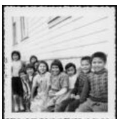
Photograph, April 1960 (10a-c000383-d0002-001)