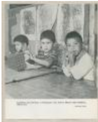
Lunch-time and small boys at kindergarten class held in Alberni Indian Residence, Alberni, B.C. (38f-c000282-d0005-001)