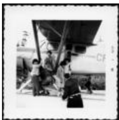
Photograph, June 1961 (10a-c000429-d0018-001)