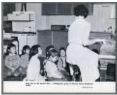
[Song Fest] (UCCPMR_20180221_006)