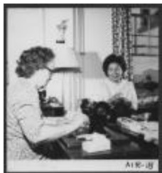
Alberni Indian Residence Alberni, B. C. Women at work in sewing-room. (13d-c5699-d32)