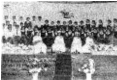
[Graduation at St. Mary's Mission IRS] (38b-c000821-d0005-001)