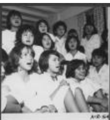
Alberni Indian Residence Alberni, B. C. Girls having sing-song before bedtime. (13d-c5699-d42)