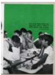
Boys at the Alberni Indian Residence, B.C., enjoy a "wash in" before starting a day at school (38f-c000919-d0002-006)