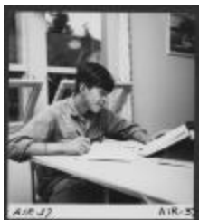
Alberni Indian Residence Alberni, B. C. Boy at homework in study room. (13d-c5699-d38)