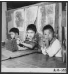
Alberni Indian Residence Alberni, B. C. Small boys at kindergarten class held at Residence. (13d-c5699-d55)