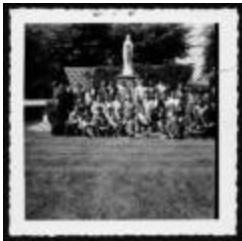
Photograph, August 1962 (10a-c000392-d0039-001)