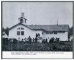
Summer school activities for Indian children at Cross Lake United (38f-c000941-d0001-014)