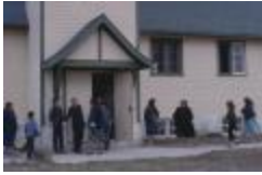
Jas. [James] Evans Memorial United Church (13d-c5712-d148)