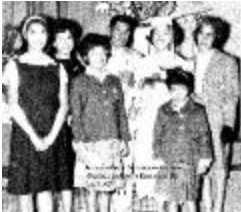
[Graduation Day at Kamloops IRS] (38b-c000821-d0008-001)