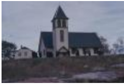
James Evans Memorial United Church (13d-c5712-d147)