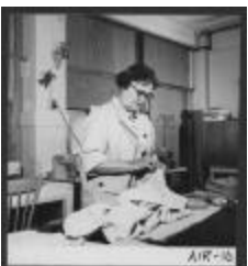
Alberni Indian Residence Alberni, B. C. Member of sewing-room staff at work. (13d-c5699-d31)