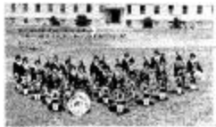
Cariboo Indian Girls' Pipe Band, William's Lake, BC (38b-c000819-d0001-001)