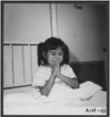
Alberni Indian Residence Alberni, B. C. Little girl saying prayers. (13d-c5699-d44)