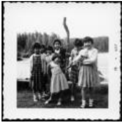
Photograph, June 1961 (10a-c000429-d0051-001)