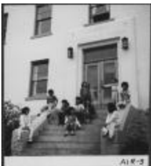
Alberni Indian Residence Alberni, B. C. Children sitting on front steps of residence. (13d-c5699-d22)