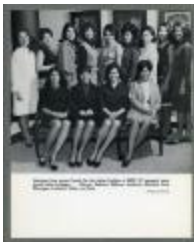
Hostesses from across Canada for the Indian Pavilion at EXPO '67 (38f-c000941-d0001-013)