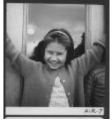
Alberni Indian Residence Alberni, B. C. Little girl outside the Residence. (13d-c5699-d24)