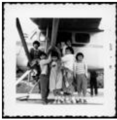
Photograph, June 1961 (10a-c000429-d0002-001)