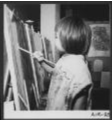
Alberni Indian Residence Alberni, B. C. Small girl painting in kindergarten at Residence. (13d-c5699-d54)