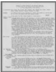
Minutes of a regular meeting of the Advisory Committee on Indian Work in the Alberni Valley (38f-c000516-d0004-001)