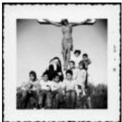
Photograph, June 1961 (10a-c000429-d0030-001)