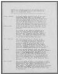
Minutes of a regular meeting of the Advisory Board to Indian Work in the Alberni Valley (38f-c000516-d0006-001)