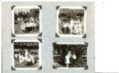
Cérémonies religieuses en 1959-1960 (45p-c000006-Cérémonies 1959)