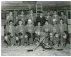
Portage Indian Residential School Mercantile Hockey Champs 1964 (13d-c5713-d37)