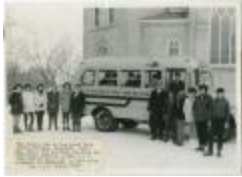
Church bus on the Round Lake Indian mission, Grenfell, Sask. : the students are from the Sintaluta Reseve, grades 7 & 8 : they are on their way to join other students at Broadview, Sask. (13d-c5710-d31)