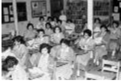
Pupils at St. George's School (13a-c001966-d0002-001)