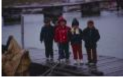
5 year olds on dock at Noway House to begin kindergarten and learn English (13d-c5712-d150)