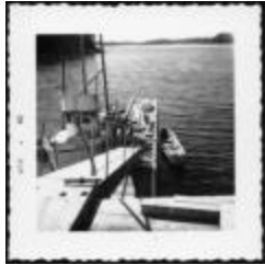
Photograph, April 1962 (10a-c000429-d0039-001)