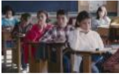
At U.C. [United Church] school (13d-c5712-d155)