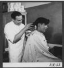
Alberni Indian Residence Alberni, B. C. Boy resident getting haircut. (13d-c5699-d34)