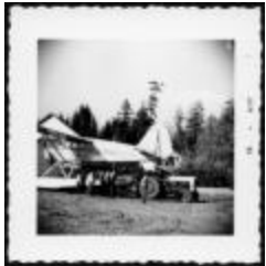
Photograph, June 1961 (10a-c000429-d0026-001)