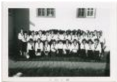
C.G.I.T. graduation service, Norway House (13d-c5712-d22)