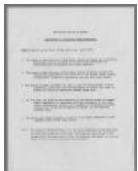
Management Of Government-Owned Residences (38f-c000528-d0017-001)