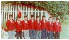
Boys of Sechelt IRS (13a-c005007-d0383-001)