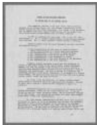
Report Of The Advisory Committee To Indian Work In The Alberni Valley (38f-c000516-d0001-001)