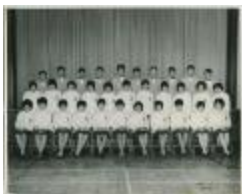
Portage la Prairie Indian Residential School Choir attend Centennial events : also go to Japan (13d-c5713-d43)