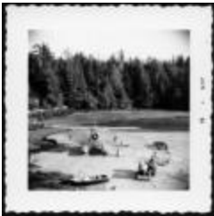
Photograph, June 1961 (10a-c000429-d0008-001)