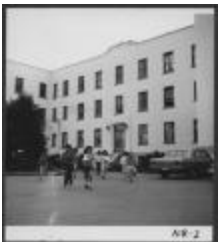
Alberni Indian Residence Alberni, B. C. Children crossing road in front of residence. (13d-c5699-d21)