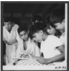
Alberni Indian Residence Alberni, B. C. Group of boys watching one boy painting.