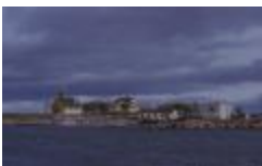
Indian Reserve (13d-c5712-d146)