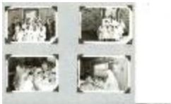
Cérémonies religieuses 1961 (45p-c000006-Cérémonies 1961)