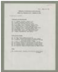
Conference Of Residential School Principals (38f-c000924-d0005-001)