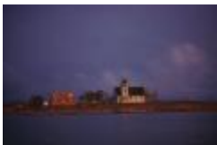
Reserve, James Evans Memorial UC [United Church] in centre (13d-c5712-d144)