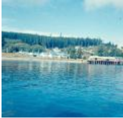
St. Michael's Indian Residential School, Alert Bay, BC (13a-c001543- d0001-001)