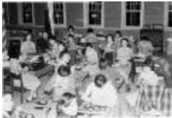
Pupils at St. George's School (13a-c001966-d0001-001)