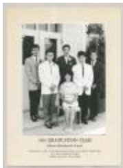
1963 Graduation Class, Alberni Residential School