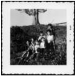
Photograph, April 1961 (10a-c000429-d0034-001)