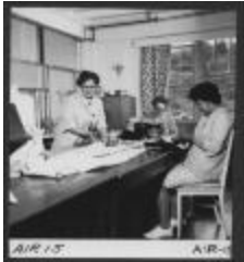
Alberni Indian Residence Alberni, B. C. Sewing room staff at work. (13d-c5699-d30)