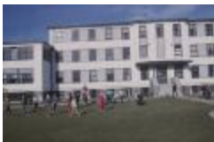
[United Church] Day and Residential School (13d-c5712-d151)