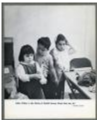
Indian children in play kitchen of Nimkish Nursery School, Alert Bay, B.C. (38f-c000941-d0001-005)