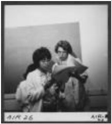
Alberni Indian Residence Alberni, B. C. Girl student with councillor [i.e. councilor]. Each grade level has its own councillor [i.e. councilor] who looks after general welfare. (13d-c5699-d35)