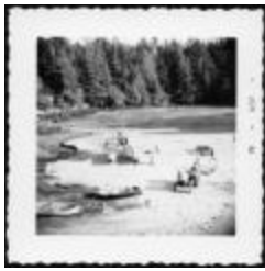
Photograph, June 1961 (10a-c000429-d0024-001)