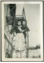
Port Simpson, B.C.: school, church, hospital (13d-c5702-d17-p32)