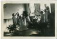
Port Simpson, B.C.: school, church, hospital (13d-c5702-d17-p9)