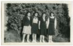
Port Simpson, B.C.: school, church, hospital (13d-c5702-d17-p23)