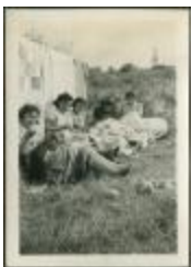
Port Simpson, B.C.: school, church, hospital (13d-c5702-d17-p28)