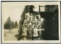
Port Simpson, B.C.: school, church, hospital (13d-c5702-d17-p56)