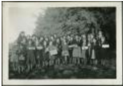
Port Simpson, B.C.: school, church, hospital (13d-c5702-d17-p48)