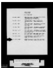
Skeena River Agency - Crosby Girls Residential School (Port Simpson) - Audit Reports, 1935-1948 (2056052)