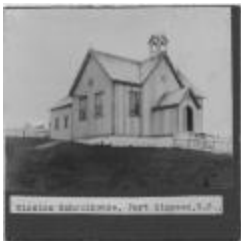
Mission school house, Port Simpson, B.C. (13d-c5702-d4)