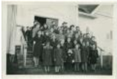
Port Simpson, B.C.: school, church, hospital (13d-c5702-d17-p16)