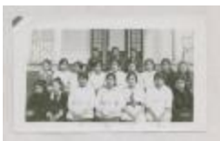
The Officers for past year of the Na Na Kwa Band, Port Simpson (38f-c000145-d0001-001)