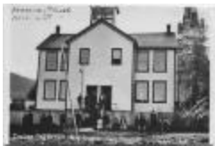
Indian day school, Port Simpson : Duke of Wellington, 79 years old (13d-c5702-d16)