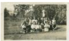
Port Simpson, B.C.: school, church, hospital (13d-c5702-d17-p14)