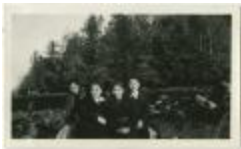
Port Simpson, B.C.: school, church, hospital (13d-c5702-d17-p26)