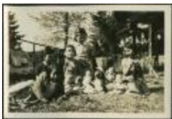
Port Simpson, B.C.: school, church, hospital (13d-c5702-d17-p37)