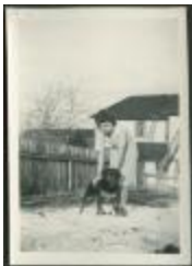
Port Simpson, B.C.: school, church, hospital (13d-c5702-d17-p52)