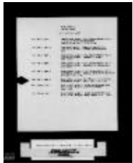
Skeena River Agency - Port Simpson United Church Residential School - School Land, 1913-1914 (2056055)