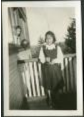
Port Simpson, B.C.: school, church, hospital (13d-c5702-d17-p33)