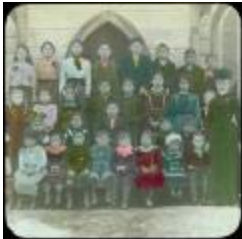
[Teacher and pupils, Indian day school, Port Simpson, B.C.] (13d-c5702-d15)