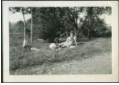
Port Simpson, B.C.: school, church, hospital (13d-c5702-d17-p41)