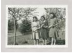
Port Simpson - Crosby Girls' Residential School - Graduates, 1943 (38f-c000137-d0001-001)