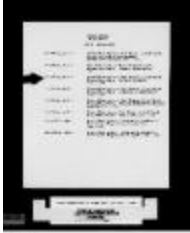
Skeena River Agency - Port Simpson United Church Residential School - Payments Of Grants, 1931-1948 (2056053)