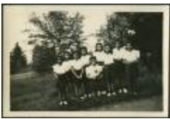
Port Simpson, B.C.: school, church, hospital (13d-c5702-d17-p27)