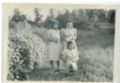
Port Simpson, B.C.: school, church, hospital (13d-c5702-d17-p22)