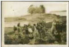
Port Simpson, B.C.: school, church, hospital (13d-c5702-d17-p45)