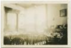
Port Simpson, B.C.: school, church, hospital (13d-c5702-d17-p7)