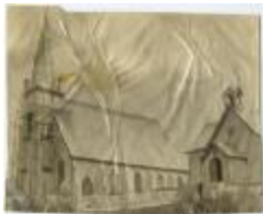
Methodist Church and mission school, Port Simpson, B.C. (13d-c5702-d1)