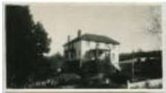
Port Simpson, B.C.: school, church, hospital (13d-c5702-d17)