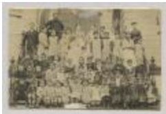
Teachers and students of Crosby Home (38f-c000133)