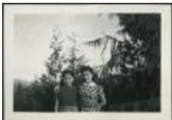
Port Simpson, B.C.: school, church, hospital (13d-c5702-d17-p53)