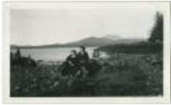
Port Simpson, B.C.: school, church, hospital (13d-c5702-d17-p24)