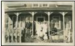
Port Simpson, B.C.: school, church, hospital (13d-c5702-d17-p58)