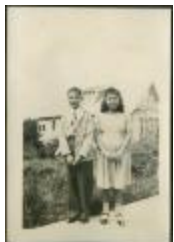
Port Simpson, B.C.: school, church, hospital (13d-c5702-d17-p60)