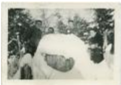
Port Simpson, B.C.: school, church, hospital (13d-c5702-d17-p13)