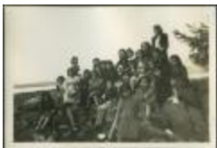
Port Simpson, B.C.: school, church, hospital (13d-c5702-d17-p47)