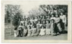
Port Simpson, B.C.: school, church, hospital (13d-c5702-d17-p25)