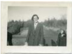
Port Simpson, B.C.: school, church, hospital (13d-c5702-d17-p10)