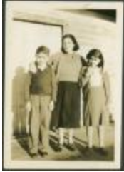
Port Simpson, B.C.: school, church, hospital (13d-c5702-d17-p55)