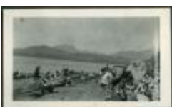
Port Simpson, B.C.: school, church, hospital (13d-c5702-d17-p31)