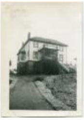
Port Simpson, B.C.: school, church, hospital (13d-c5702-d17-p5)