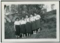
Port Simpson, B.C.: school, church, hospital (13d-c5702-d17-p35)