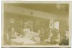
Port Simpson, B.C.: school, church, hospital (13d-c5702-d17-p6)