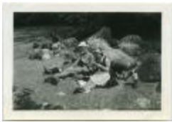
Port Simpson, B.C.: school, church, hospital (13d-c5702-d17-p3)