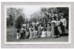
Port Simpson - Crosby Girls' Residential School, Students and Staff, 1943 (38f-c000103-d0001-001)