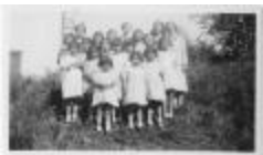
Staff and girls of the Crosby Girls' School (13d-c5702-d11)