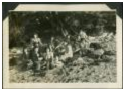
Port Simpson, B.C.: school, church, hospital (13d-c5702-d17-p46)