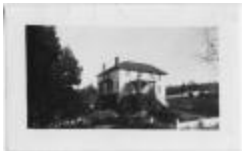
Crosby Girl's School, Port Simpson, B.C. (13d-c5702-d7)