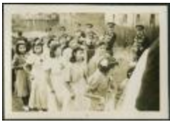
Port Simpson, B.C.: school, church, hospital (13d-c5702-d17-p57)