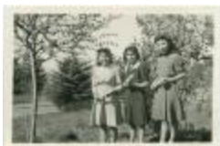
Port Simpson, B.C.: school, church, hospital (13d-c5702-d17-p21)