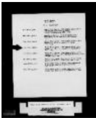
Skeena River Agency - Port Simpson United Church Residential School - Inspector Of Construction, 1913-1914 (2056054)