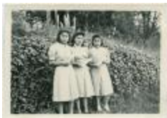
Port Simpson, B.C.: school, church, hospital (13d-c5702-d17-p20)