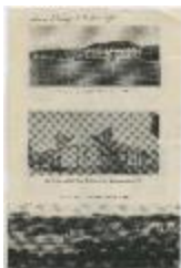
Morley Indian Residential School. rebuilt in 1935 (MOA_20180215_001)