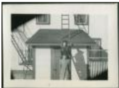
Port Simpson, B.C.: school, church, hospital (13d-c5702-d17-p43)