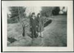
Port Simpson, B.C.: school, church, hospital (13d-c5702-d17-p40)