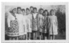
Girls at the Crosby Girls' School wearing aprons sent from Beaver Band Club of Trail, B.C. (13d-c5702-d14)