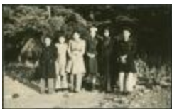
Port Simpson, B.C.: school, church, hospital (13d-c5702-d17-p61)