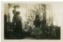
Port Simpson, B.C.: school, church, hospital (13d-c5702-d17-p4)