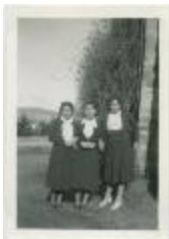
Port Simpson, B.C.: school, church, hospital (13d-c5702-d17-p19)