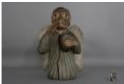
Baptismal Font (A1776 a-c)