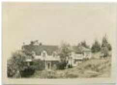
Port Simpson, B.C.: school, church, hospital (13d-c5702-d17-p2)