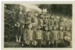
Port Simpson, B.C.: school, church, hospital (13d-c5702-d17-p15)