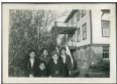
Port Simpson, B.C.: school, church, hospital (13d-c5702-d17-p36)