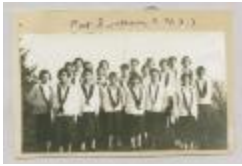
Port Simpson C.G.I.T. (38f-c000138-d0001-001)