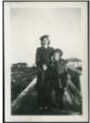
Port Simpson, B.C.: school, church, hospital (13d-c5702-d17-p50)