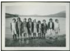
Port Simpson, B.C.: school, church, hospital (13d-c5702-d17-p38)