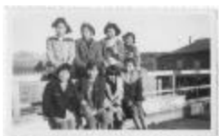
[Girls from the Crosby Girls' School, Port Simpson] (13d-c5702-d13)