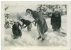
Port Simpson, B.C.: school, church, hospital (13d-c5702-d17-p12)