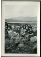
Port Simpson, B.C.: school, church, hospital (13d-c5702-d17-p49)