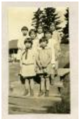
Port Simpson Group of Girls (38f-c000105-d0001-001)