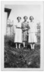
Staff of the Crosby Girls' School (13d-c5702-d12)