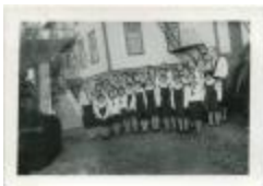
Port Simpson, B.C.: school, church, hospital (13d-c5702-d17-p17)