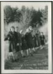
Port Simpson, B.C.: school, church, hospital (13d-c5702-d17-p34)