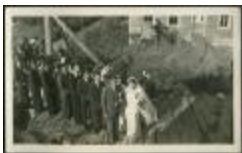
Port Simpson, B.C.: school, church, hospital (13d-c5702-d17-p59)