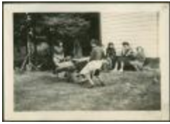
Port Simpson, B.C.: school, church, hospital (13d-c5702-d17-p54)