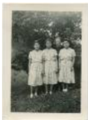
Port Simpson, B.C.: school, church, hospital (13d-c5702-d17-p18)