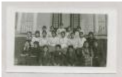
Children and teacher (38f-c000143-d0001-001)