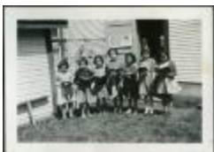
Port Simpson, B.C.: school, church, hospital (13d-c5702-d17-p39)