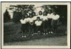
Port Simpson, B.C.: school, church, hospital (13d-c5702-d17-p29)