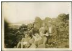
Port Simpson, B.C.: school, church, hospital (13d-c5702-d17-p44)