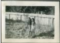
Port Simpson, B.C.: school, church, hospital (13d-c5702-d17-p42)