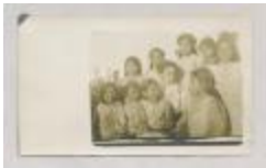
Children And Teacher (38f-c000144-d0001-001)