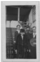
Staff of the Crosby Girls' School (13d-c5702-d8)