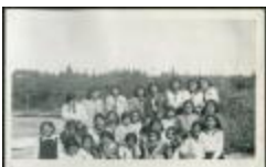
Port Simpson, B.C.: school, church, hospital (13d-c5702-d17-p30)