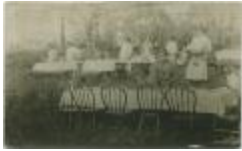
24th of May picnic at the Crosby Girls' Home (13d-c5702-d5)