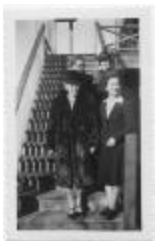
Staff of the Crosby Girls' School (13d-c5702-d9)