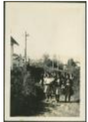
Port Simpson, B.C.: school, church, hospital (13d-c5702-d17-p51)