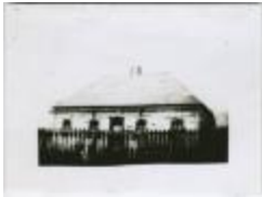
[House in which Evans developed Cree syllabic, Norway House, Man.] (13d-c5712-d84)