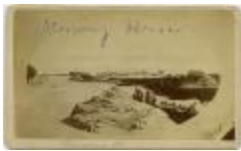
Norway House, Man. (13d-c5712-d73)