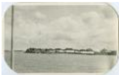
[Hudson's Bay Company Fort, Norway House] (13d-c5712-d76)