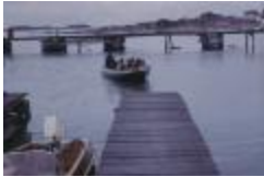
5 year olds arriving (sic) United Church school Norway House (13d-c5712-d149)