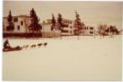
New Day School block. Principal's house on far right. (13d-c5712-d3)