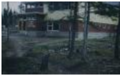
[Norway House Hospital] (13d-c5712-d140)