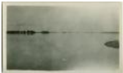
[View of the lake at Norway House] (13d-c5712-d57)