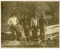
Four Cree Indian guides with their canoe, Norway House, Man. (13d-c5712-d50)