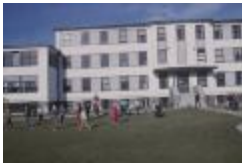
[United Church] Day and Residential School (13d-c5712-d151)