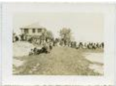
[Gathering of Cree Indians at Norway House to commemorate the 100th anniversary of the arrival of James Evans] (13d-c5712-d94)