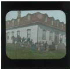
[Missionary to Norway House and Berns River] (13d-c5712-d137)