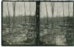
Portage where some Indians left their camp fire burning and started a great [blaze?] (13d-c5712-d69)