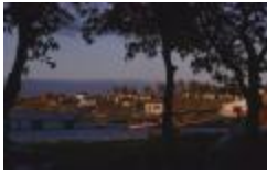
[Riverbank and dock] (13d-c5712-d143)