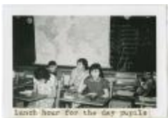
[Day pupils eating lunch, Norway House Indian Residential School] (13d-c5712-d25)