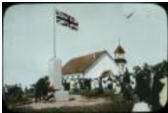
Dedication of Soldiers' Memorial, Norway House, Man. (13d-c5712-d130)