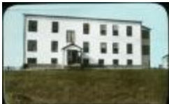
Norway House Hospital, Man. (13d-c5712-d80)