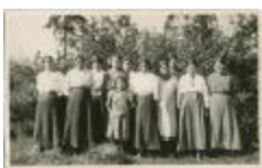
[Older girls from Poplar River attending the Indian Boarding School at Norway House] (13d-c5712-d34)