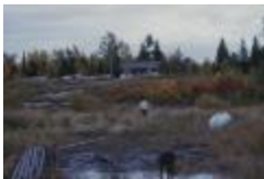
Marshy area around Norway House (13d-c5712-d145)