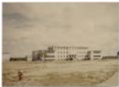
Norway House Indian Residential School, 1954-67. This new building opened September 1954. (13d-c5712-d2)