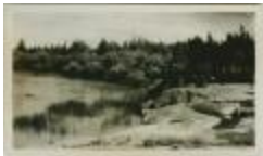
[View of Ross Island shoreline] (13d-c5712-d58)