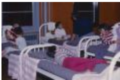
Primary grades dorm. [dormitory] at U.C. [United Church] day and residential school (13d-c5712-d156)