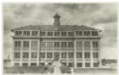
[A splendid picture of our Indian Boarding School at Norway House] (13d-c5712-d40)