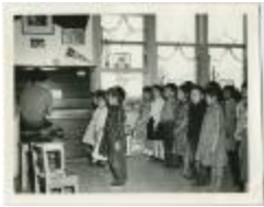
[Children performing a song with actions, Norway House Indian Residential School, Man.] (13d-c5712-d13)