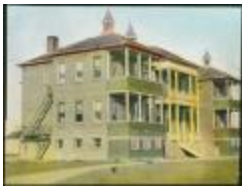
Norway House Boarding School (13d-c5712-d47)