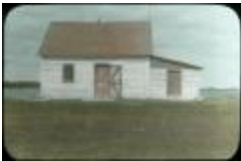
Council room, Norway House (13d-c5712-d131)