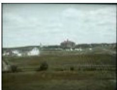
Tents at treaty time, Norway House, Man. (13d-c5712-d28)