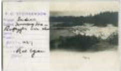
Rapids at Norway House, Man. (13d-c5712-d96)