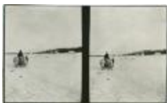
[Travelling by ox team, Norway House] (13d-c5712-d7)