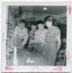
[Four students in a classroom at the Indian Residential School, Norway House] (13d-c5712-d17)