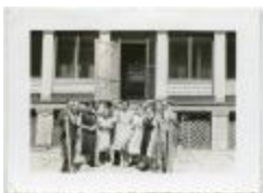
Staff of Norway House Residential School (13d-c5712-d11)