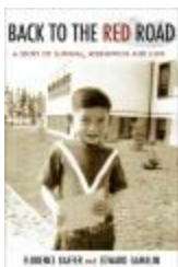
Back to the red road : a story of survival, redemption and love (7661659)