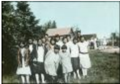
Graduation class picnic, Norway House, Man. (13d-c5712-d129)