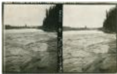
Some Rapids On River Journey, Fall 1910 (13d-c5712-d71)