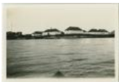
Hudson's Bay Company Fort, Norway House, Man. (13d-c5712-d62)