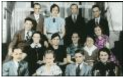
[Residential School staff '38, Norway House, Man.] (13d-c5712-d127)