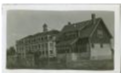
[Residential school and teachers' residence, Norway House] (13d-c5712-d31)