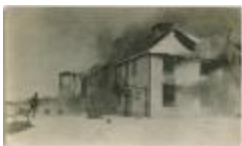
Norway House Indian Boarding School on fire (13d-c5712-d38)