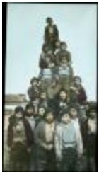
A pyramid of girls from Norway House Indian Residential School (13d-c5712-d8)