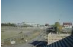
[Road leading to the grounds of Norway House] (13d-c5712-d141)