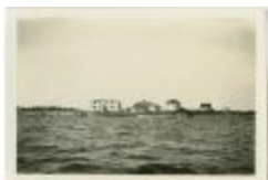
The hospital, the school, the agent's residence, and the doctor's residence, Norway House, Man. (13d-c5712-d66)