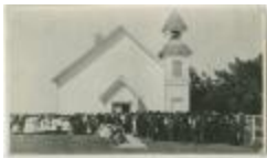
Sacrament Sunday at Norway House (13d-c5712-d122)