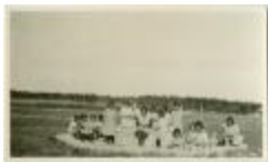
Little girls making mud pies in the sandbox at the Indian Boarding School, Norway House (13d-c5712-d32)