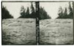
Some Rapids Encountered On The River Journey Taken In The Fall Of 1910 (13d-c5712-d70)