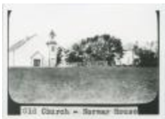
Old Church, Norway House (13d-c5712-d114)