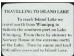
Travelling to Island Lake (13d-c5712-d123)