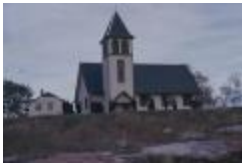
James Evans Memorial United Church (13d-c5712-d147)