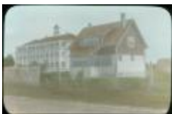
[Indian Residential School and Principal's residence, Norway House] (13d-c5712-d128)