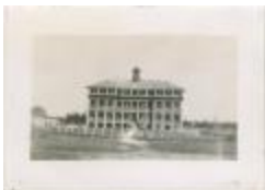
Norway House Indian Boarding School (13d-c5712-d29)