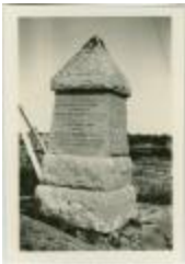
Hudson's Bay Co. monument to a factor who was drowned, Norway House (13d-c5712-d64)