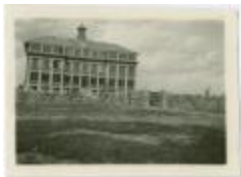
Norway House Indian Residential School (13d-c5712-d26)