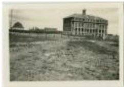
[Indian Boarding School, Norway House, Man.] (13d-c5712-d36)