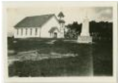
Rossville Mission and the memorial, Norway House (13d-c5712-d61)