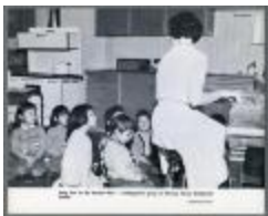
[Song Fest] (UCCPMR_20180221_006)