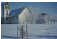
Norway House, Manitoba (13d-c5712-d139)