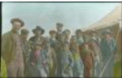
[Garden boys and instructors, Norway House Indian Boarding School] (13d-c5712-d90)