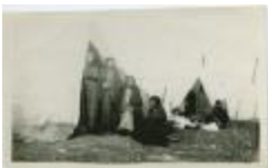
[Cree Indian women camping at Norway House at treaty time] (13d-c5712-d54)