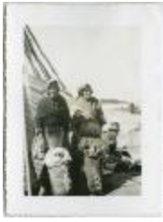
[Two Cree women watching over their swaddled infants, Norway House] (13d-c5712-d92)