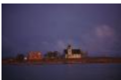
Reserve, James Evans Memorial UC [United Church] in centre (13d-c5712-d144)