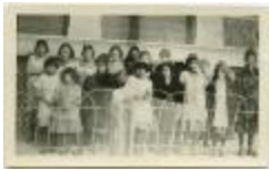
Some of the children who were under my sister's charge : there are about 110 boys and girls living in the school at Norway House (13d-c5712-d10)