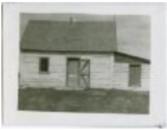
City hall, Norway House, Man. (13d-c5712-d85)