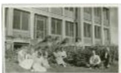
Staff of the Indian Boarding School at Norway House (13d-c5712-d41)