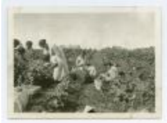
[Woman and children picking vegetables in the garden at Norway House Indian Boarding School] (13d-c5712-d121)