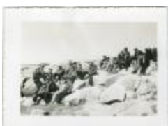
[Part of the assembly of Cree Indians attending the James Evans pageant at Norway House] (13d-c5712-d87)