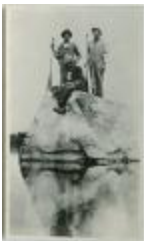
Three Indian guides on a rock, Norway House (13d-c5712-d111)