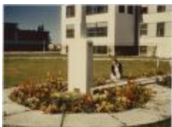
Flag pole base. Day School block at left. (13d-c5712-d4)