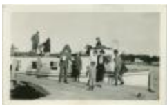
Fishing tug on which trip is made up Lake Winnipegosis (13d-c5712-d55)