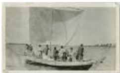
[An Indian crew setting sail for Oxford House carrying the missionary and his wife and child, Norway House, Man.] (13d-c5712-d72)