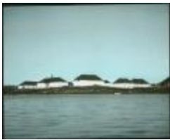
Hudson's Bay Post, Norway House, Man. (13d-c5712-d6)