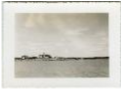
Mission Point, Norway House (13d-c5712-d86)