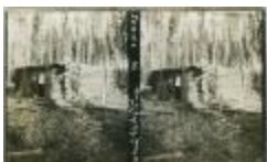
Winter Rapids hunting camp in summertime (13d-c5712-d68)