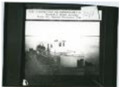
[The S.S. Keenora [i.e. Chikama] stopped at Warren's Landing, its most northerly call : from there passengers going farther travelled the twenty-five miles to Norway House down the Nelson River]