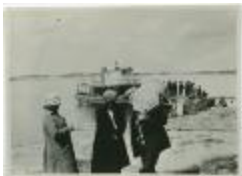
Superintendent of Indian Missions ready for inland trip, Norway House, Man. (13d-c5712-d110)