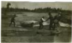
[Cree Indian guides portage across rapids near Norway House] (13d-c5712-d74)