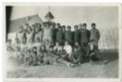
[Rev. Denyes and pupils from the Indian Boarding School assembled outside Norway House Methodist Church] (13d-c5712-d33)