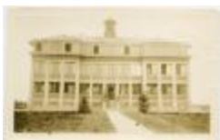
Indian Residential School, Norway House (13d-c5712-d46)