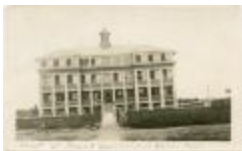
Norway House Indian Boarding School (13d-c5712-d27)