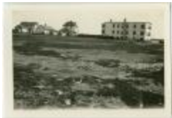
[Hospital run by the government, Norway House, Man.] (13d-c5712-d65)