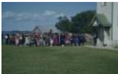
[Long shot of a group of people] (13d-c5712-d142)