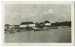
Hudson's Bay Company Fort, Norway House, Man. (13d-c5712-d75)