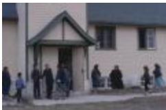
Jas. [James] Evans Memorial United Church (13d-c5712-d148)