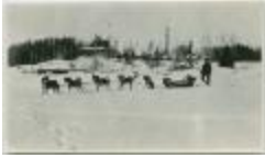
[Woman being pulled in a sleigh by a dog team : the chief fire ... house in the background] (13d-c5712-d113)