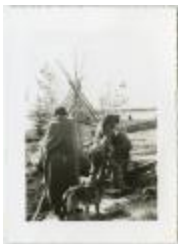
[Cree Indians making camp at Norway House] (13d-c5712-d93)