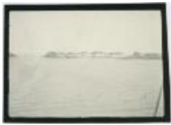
Hudson's Bay Post, Norway House (13d-c5712-d108)