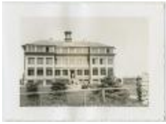
Indian Residential School, Norway House : 100 pupils attend (13d-c5712-d12)