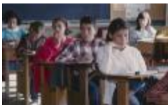
At U.C. [United Church] school (13d-c5712-d155)