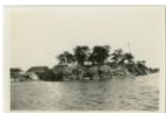
Signal Hill, Hudson's Bay Company Fort, Norway House, Man. (13d-c5712-d63)