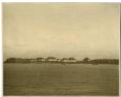
Village of Norway House, Man. (13d-c5712-d51)