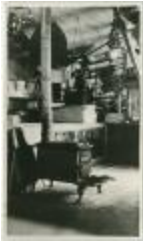
Interior of the Hudson's Bay store, Norway House, Man. (13d-c5712-d112)