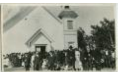
[Gathering outside Rosville Mission Church after Sunday service] (13d-c5712-d97)