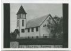
[Present?] Church, Norway House (13d-c5712-d115)