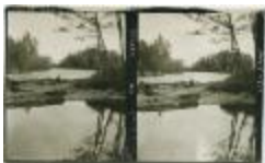
[Sunday camp on the river] (13d-c5712-d67)