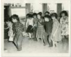
[Children performing a song with actions, Norway House Indian Residential School, Man.] (13d-c5712-d14)