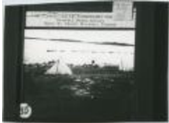
[These are freight canoes from Oxford House arriving at Norway House : they have come to pick up the treaty goods given by the government each summer] (13d-c5712-d116)