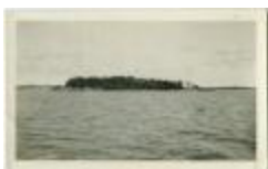
Forestry Island as seen from Norway House (13d-c5712-d56)