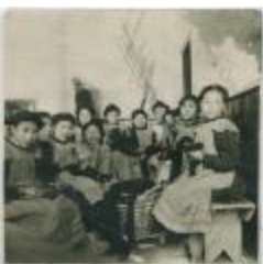
Girls' sewing class at Norway House Indian Boarding School (13d-c5712-d37)