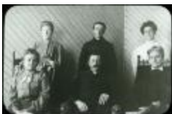
Staff at Norway House School (13d-c5712-d124)