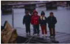
5 year olds on dock at Noway House to begin kindergarten and learn English (13d-c5712-d150)