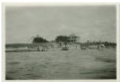
Mission house and church, Norway House (13d-c5712-d109)