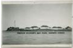
Hudson's Bay Post, Norway House (13d-c5712-d95)