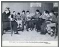
Midweek group of boys (38f-c000941-d0001-003)