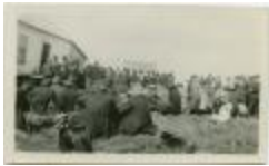
The quarterly council of the Cree Indians when they receive their treaty money from the government : the government agent is to be seen seated at the table, Norway House, Man. (13d-c5712-d53)