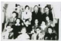
Staff of Norway House Indian Residential School (13d-c5712-d30)