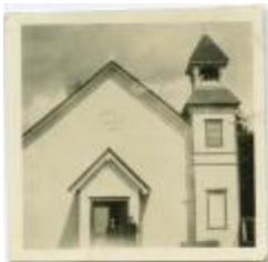
Rossville Mission Church, Norway House (13d-c5712-d77)