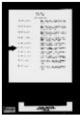
Stuart Lake Agency - Lejac Residential School - Cadet Corps Band, 1930 (2056024)