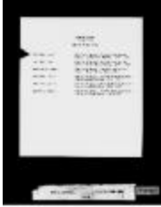
West Coast Agency - Ahousaht Residential School - Inspectors' Reports, 1933-1940 (2055993)