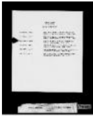
West Coast Agency - Ahousaht Residential School - School Land, 1930-1936 (2055996)