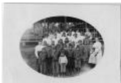
[Teachers and children, Elizabeth Long Memorial Home, Kitimat] (13d-c5703-d16)