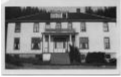
W.M.S. Home at Kitimaat (13d-c5703-d8)