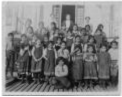
Children and staff of E.L.M. Home, Kitimaat