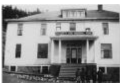
Elizabeth Long Memorial Home, Kitimaat, B.C. (13d-c5703-d6)