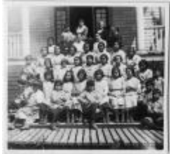
Children and staff of the Elizabeth Long Memorial Home (13d-c5703-d22)