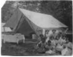
Girls of the Elizabeth Long Memorial Home sewing at camp (13d-c5703-d25)