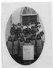
[Elizabeth Long Memorial Home : children and auxiliary women with banner] (13d-c5703-d18)