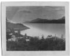
Looking south from the E.L.M. Home, Kitimaat (13d-c5703-d26)