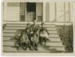
The preacher and the W.M.S. Home boys on the steps of the Home, Kitimaat (13d-c5703-d10)