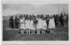
Graduation at Kitimaat (13d-c5703-d27)