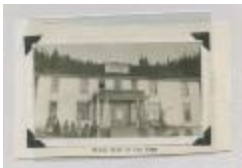
Front View of Home (38f-c000134-d0001-001)