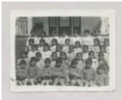
Children on steps of school, Kitimaat, B.C. (38f-c000136)