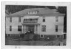
Elizabeth Long Memorial Home : before cement foundation (13d-c5703-d5)