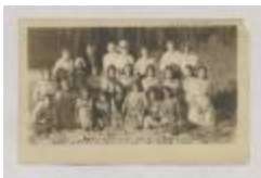
The Elizabeth Long Memorial Home, Pupils and Staff, Kitimaat, B.C. (38f-c000135-d0001-001)