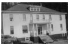
The "Home," Kitimaat, B.C. (13d-c5703-d4)