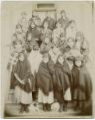
Indian girls when they first started the school, Kitimaat (13d-c5703-d9)