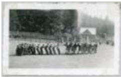
Elizabeth Long Memorial Home, Kitimat (sic) Indian Reserve, N.C. (13d-c5703-d1)