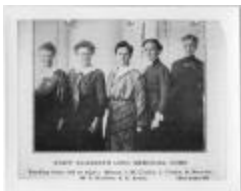
Staff Elizabeth Long Memorial Home (13d-c5703-d21)