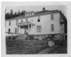
Elizabeth Long Memorial Home, Kitimaat (13d-c5703-d7)