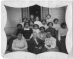
Kitimaat Auxiliary (13d-c5703-d13)