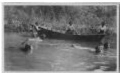
Girls of the Elizabeth Long Home (WMS) swimming at the summer camp, Kitimaat