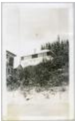
Elizabeth Long Memorial Home, Kitimat (sic) Indian Reserve, N.C. (13d-c5703-d3)