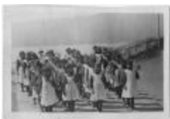
Marching on Empire Day (13d-c5703-d15)