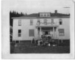
Elizabeth Long Memorial Home, Kitimaat : staff and children (13d-c5703-d23)