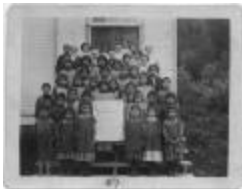
[Elizabeth Long Memorial Home : children and auxiliary women with banner] (13d-c5703-d17)