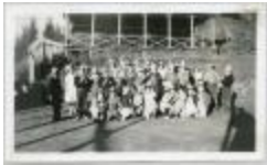
Elizabeth Long Memorial Home, Kitimat (sic) Indian Reserve, N.C. (13d-c5703-d2)