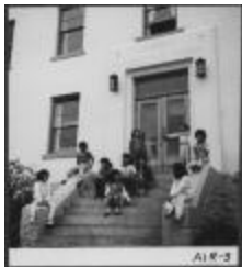
Alberni Indian Residence Alberni, B. C. Children sitting on front steps of residence. (13d-c5699-d22)