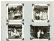
Cérémonies religieuses en 1959-1960 (45p-c000006-Cérémonies 1959)