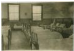
Dormitory, Coqualeetza Industrial Institute (13d-c5701-d19)