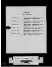
Vancouver Agency - Sechelt Residential School - Inspectors Of Construction, 1921-1922 (2057640)