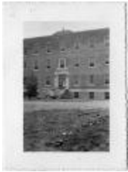
Alberni Indian School (13d-c5699-d18)