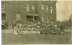
Teachers and students of the Coqualeetza Industrial Institute (13d-c5701-d1)