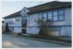
[Alberni Indian Residential School site] (13d-c5699-d70)