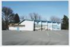
[Alberni Indian Residential School site] (13d-c5699-d71)