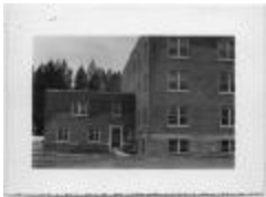
Indian Residential School, Alberni, B.C.