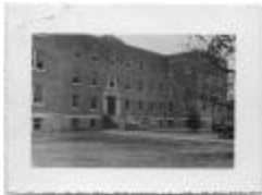
Indian Residential School, Alberni, B.C. (13d-c5699-d20)