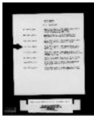
Skeena River Agency - Port Simpson United Church Residential School - Inspector Of Construction, 1913-1914 (2056054)