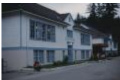
[Building facade] (13d-c5699-d74)