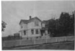
Principal's residence, completed in 1906, Coqualeetza (13d-c5701-d5)