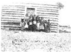
[Students who will attend Anahim Reserve School when completed] (38b-c000818-d0001-001)