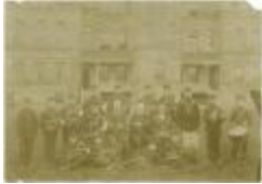
Band boys of Coqualeetza Institute (13d-c5701-d9)