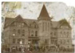
[Staff and students in front of the Coqualeetza Industrial Institute] (13d-c5701-d4)