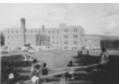
Alberni Residential School