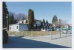
[Alberni Indian Residential School site] (13d-c5699-d69)