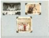
Autres cérémonies religieuses (45p-c000006-Autres cérémonies)