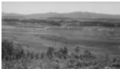
Morley, Alberta