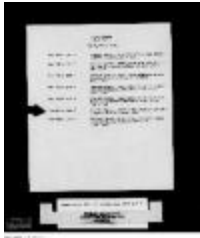
Cowichan Agency - Kuper Island Industrial School - Inspector Of Construction, 1914 (2057507)