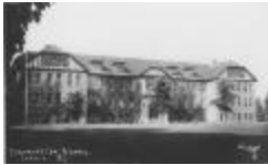
Coqualeetza Residential School in Sardis, Chilliwack, BC (a034774)