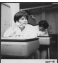
Alberni Indian Residence Alberni, B. C. Girl at desk in study room. Each grade level has its own room for study. (13d-c5699-d37)