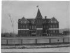
["We Mourn Our Beloved Queen" : Coqualeetza Industrial Institute] (13d-c5701-d7)