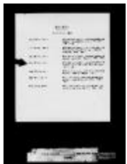
Williams Lake Agency - Caribou Residential School - Cadet Corps Band Set - Accounts, 1945-1946 (2056009)