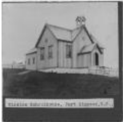
Mission school house, Port Simpson, B.C. (13d-c5702-d4)