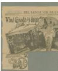
What Canada is Doing for Her Native Indian Children (38f-c000058-d0008-001)