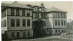
Former building, burned 1937. Replaced in 1939. (13d-c5699-d2)