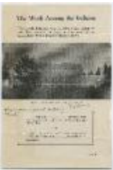
Telfer's room at Alberni Residential School (MOA_20180215_003)