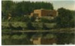
Indian Residential School, Alberni, B.C. (13d-c5699-d16)