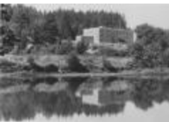
Alberni Residential School (a034772)