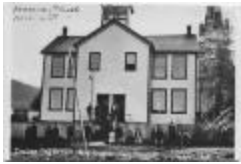
Indian day school, Port Simpson : Duke of Wellington, 79 years old (13d-c5702-d16)