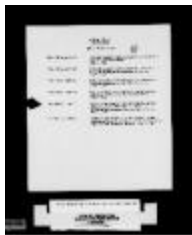
Kamloops Agency - Kamloops Industrial School - Agricultural Land - Irrigation With Accompanying Supplies And Accounts (Plans), 1912-1926 (2056034)