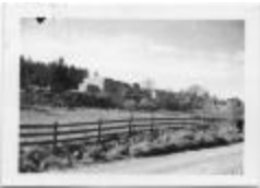
Alberni Residential School (13d-c5699-d17)