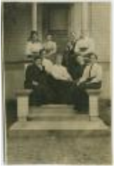
The principal, his wife, and the lady members of the staff of Coqualeetza Industrial Institute (13d-c5701-d2)