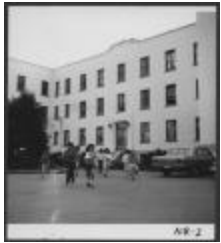
Alberni Indian Residence Alberni, B. C. Children crossing road in front of residence. (13d-c5699-d21)