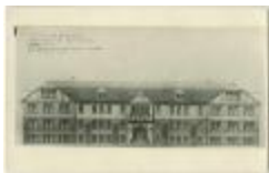
Sketch of proposed Coqualeetza Institute, Sardis, B.C. (13d-c5701-d17)