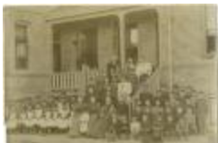
Staff and pupils of the Coqualeetza Institute (13d-c5701-d11)