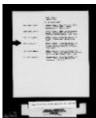
Stikine Agency - Lower Post Residential School (Teslin Lake) - Establishment - Accounts - Buildings Specifications (Plan), 1949-1950 (2057090)