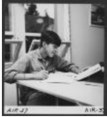
Alberni Indian Residence Alberni, B. C. Boy at homework in study room. (13d-c5699-d38)