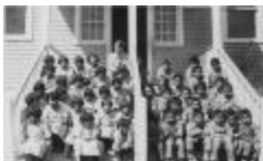
Junior Class of the Morley Residential School (a034729)