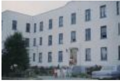
Alberni Indian Residence (13d-c5699-d72)