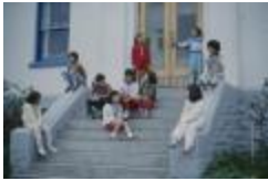
[Children seated by the front steps] (13d-c5699-d73)