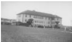
Morley Residential School after new wing was built (a034663)