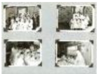
Cérémonies religieuses 1961 (45p-c000006-Cérémonies 1961)