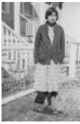
Stoney Nakoda girl in front of school building (a034694)