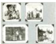
Photos de 1954 (45p-c000006-Photos de 1954)