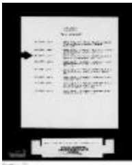
Lytton Agency - St. George's Residential School - Inspector Of Construction, 1927-1929 (2057510)