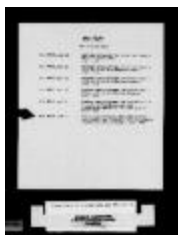
Kamloops Agency - Kamloops Industrial School - Agricultural Land - Irrigation With Accompanying Supplies And Accounts (Plans), 1926-1932 (2056717)