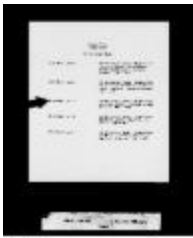
New Westminster Agency - Coqualeetza Industrial School - Inspector Of Construction, 1921-1934 (2057047)