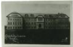
Coqualeetza Institute, Sardis, B.C. (13d-c5701-d12)