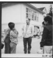
Alberni Indian Residence Alberni, B. C. Exterior of Residence. Boys with one of the housemasters. (13d-c5699-d46)