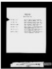
West Coast Agency - Ahousaht Residential School - Inspectors' Reports, 1933-1940 (2055993)