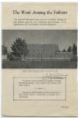
Telfer's room at Alberni Residential School (MOA_20180215_002)