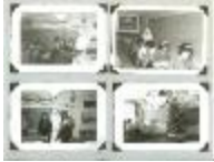
Autres photos de 1966 (45p-c000006-Autres photos 1966)