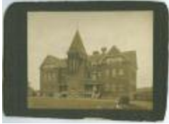
Coqualeetza Industrial Institute (13d-c5701-d14)