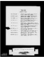
Vancouver Agency - Sechelt Residential School - Livestock - Accounts, 1923-1946 (2056058)