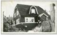
Ahousaht Residence 1937 (13d-c5700-d3)