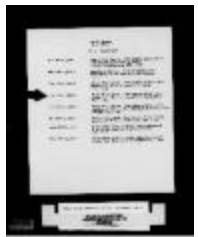
Skeena River Agency - Port Simpson United Church Residential School - Inspector Of Construction, 1913-1914 (2056054)