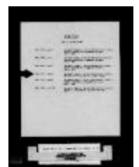
Vancouver Agency - Sechelt Residential School - Inspectors Of Construction, 1921-1922 (2057640)