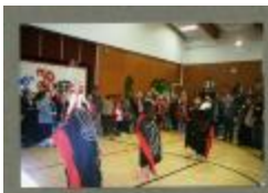
Hereditary chief and daughter and his sister