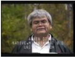
A Native brother's story (38f-c001581-d0001-001)