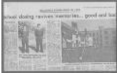
School Closing Revives Memories... Good And Bad (38f-c000527-d0001-001)