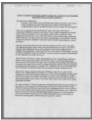
Evaluation of Worker's Wonderings: a gathering of those who worked in the Indian Residential Schools (38f-c000836-d0052-001)