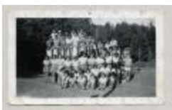
Children from Indian Residential School at their summer camp (38f-c000607-d0006-001)