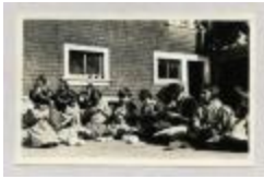
Junior Knitting Class, Ahousaht (38f-c000112-d0001-001)