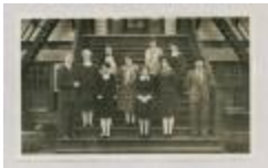
Staff Members (38f-c000130-d0001-001)