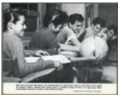
Boys from the Curve Lake Reserve (38f-c000941-d0001-006)