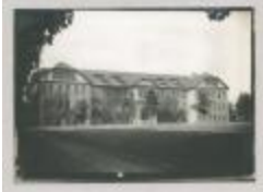
Coqualeetza Institute (38f-c000150-d0001-001)