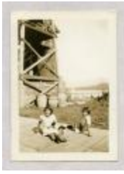
[Girls playing with puppy] (38f-c000109-d0001-001)