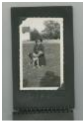
Pearl H. & Oscar (38f-c001582-d0002-001)