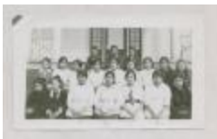
The Officers for past year of the Na Na Kwa Band, Port Simpson (38f-c000145-d0001-001)