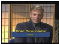
The Residential School Project (38f-c001581-d0006-001)