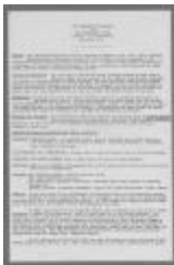
The Coqualeetza Fellowship and The Information Centre (38f-c000931-d0001-001)