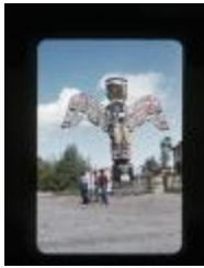
Three unidentified boys and a totem (UCCPMR_20180221_003)