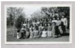
Port Simpson - Crosby Girls' Residential School, Students and Staff, 1943 (38f-c000103-d0001-001)