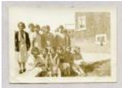
A Group Of Girls On The Basketball Court (38f-c000095-d0001-001)