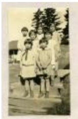
Port Simpson Group of Girls (38f-c000105-d0001-001)