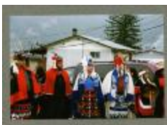
Hereditary chiefs (BCCA-2797.3)