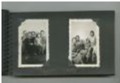
Senior girls (38f-c001582-d0010-001)