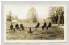
Group of Boys: Indian Residential School - Alberni