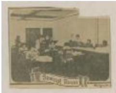
Sewing Room (38f-c000058-d0025-001)