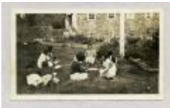
Me and S. S. Class on Front Lawn (38f-c000111-d0001-001)