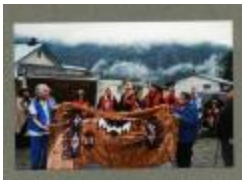
Plaque being Unveiled (BCCA-2797.11)