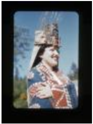
Unidentified young woman with headdress (UCCPMR_20180221_004)