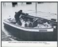
Children are brought in by power boat to the Norway House kindergarten in Northern Manitoba (38f-c000941-d0001-016)