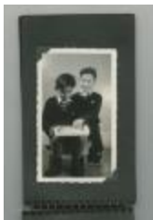
Two boys reading (38f-c001582-d0003-001)