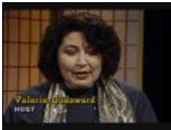
Rebirth in the face of darkness (38f-c001581-d0003-001)