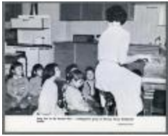
[Song Fest] (UCCPMR_20180221_006)