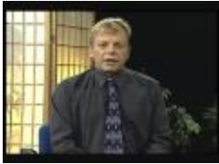
Questions about Residential Schools (38f-c001581-d0007-001)