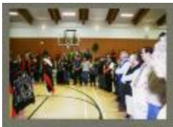
IRS survivors (BCCA-2797.40)