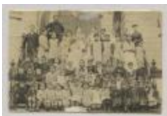
Teachers and students of Crosby Home (38f-c000133)