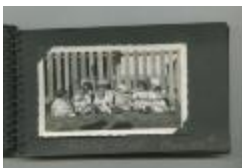
Future Pupils, May 24th (38f-c001582-d0014-001)