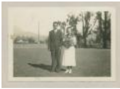
Unidentified boy and girl (38f-c000051-d0001-001)