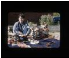
Unidentified young man with indigenous art (UCCPMR_20180221_005)