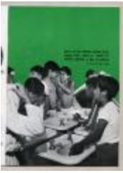
Boys at the Alberni Indian Residence, B.C., enjoy a "wash in" before starting a day at school (38f-c000919-d0002-006)