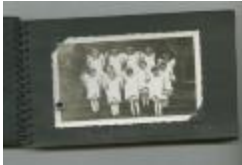
Christmas fairies 1936 (38f-c001582-d0008-001)