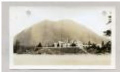
Christie School, "Kakawis," Tofino (38f-c000600-d0001-001)