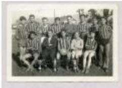
Boys' basketball team, Coqualeetza Institute, Sardis, B.C. (38f-c000607)