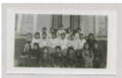
Children and teacher (38f-c000143-d0001-001)