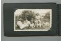
Children holding infants (38f-c001582-d0015-001)