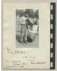
My Family (38f-c000576-d0001-001)