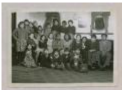
Alberni Indian Residential School (38f-c000118-d0001-001)