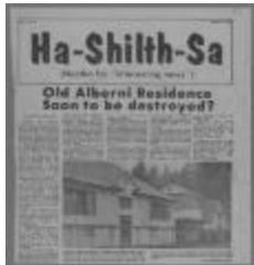
Old Alberni Residence soon to be destroyed? (38f-c000528-d0016-001)