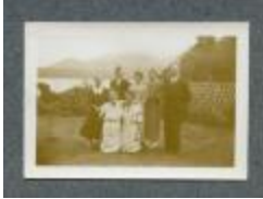
Staff, 1935 (38f-c000094-d0001-001)