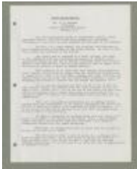
Staff Relationships (38f-c000924-d0004-003)