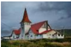
Grace United Church (38f-c001524-d0085-001)