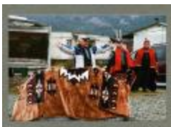
Blessings from elder and IRS survivor (BCCA-2797.2)