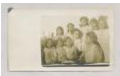
Children And Teacher (38f-c000144-d0001-001)