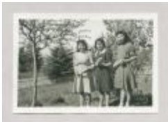
Port Simpson - Crosby Girls' Residential School - Graduates, 1943 (38f-c000137-d0001-001)