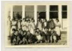
Senior Classes, Grades V to VIII (38f-c000113-d0001-001)