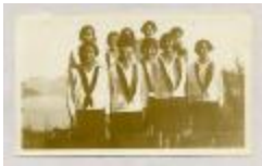
The Humming Bird C.G.I.T. Group, Ahousaht, BC (38f-c000110-d0001-001)