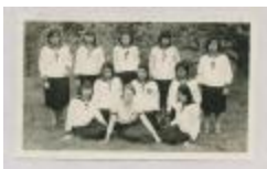
Junior C.G.I.T Group, Indian Residential School, Alberni, B.C. (38f-c000131-d0001-001)