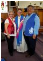
United Church and First Nations elders (38f-c001524-d0063-001)