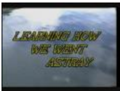
Learning how we went astray (38f-c001581-d0004-001)