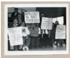
Residential School Survivors Protesting (38f-c000872-d0004-001)