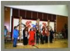
Ladies that made the headbands (BCCA-2797.28)