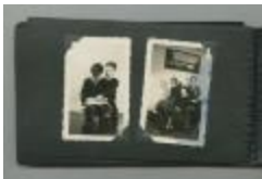
Some Alberni students and teachers (38f-c001582-d0018-001)