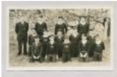
Intermediate S. S. Class (38f-c000123-d0001-001)