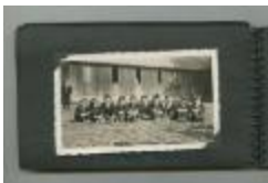
Junior boys (38f-c001582-d0013-001)