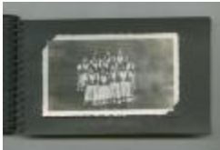
Christmas 1936 (38f-c001582-d0012-001)