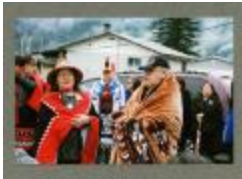
IRS survivor receives the blanket (BCCA-2797.12)