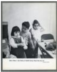
Indian children in play kitchen of Nimkish Nursery School, Alert Bay, B.C. (38f-c000941-d0001-005)