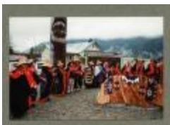
Song before unveiling of IRS Plaque (BCCA-2797.10)