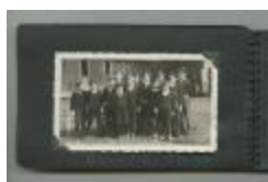
Dressed for church (38f-c001582-d0007-001)