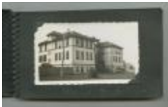
Alberni Residential School (38f-c001582-d0001-002)