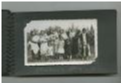
Mother's Day, 1936 (38f-c001582-d0016-001)