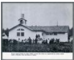
Summer school activities for Indian children at Cross Lake United (38f-c000941-d0001-014)