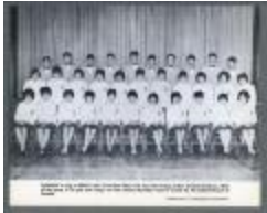
Glee Club from the Portage Indian Student Residence (38f-c000941-d0001-001)