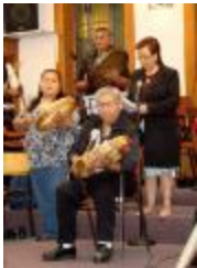
The Four Crest Singers (38f-c001524-d0177-001)