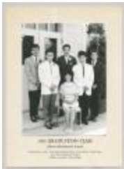
1963 Graduation Class, Alberni Residential School (38f-c000152-d0001-001)