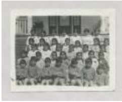
Children on steps of school, Kitamaat, B.C. (38f-c000136)