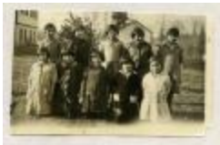
Alberni Indian Residential School Students (38f-c000098-d0001-001)