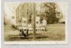
Alberni Indian Residential School Students (38f-c000097-d0001-001)