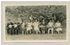
Orchestra - Indian Residential School, Alberni, B.C. (38f-c000117-d0001-001)