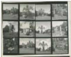
Totem Poles And Children (38f-c000860-d0001-001)