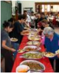
The feast (38f-c001524-d0071-001)