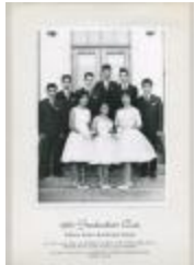
1962 Graduation Class, Alberni Indian Residential School (38f-c000154-d0001-001)