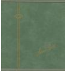
Alberni Indian Residential School Scrapbook (38f-c000003-d0001-001)