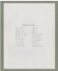
Coqualeetza Staff 1899 (38f-c000058-d0007-001)