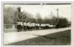
Alberni - Students of Residential School (38f-c000116-d0001-001)