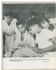
Dormitory party watches one of their painting members, at the Alberni Indian Residential School, Alberni, B.C. (38f-c000282-d0006-001)