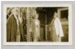
King Hilary and the Beggarman: Christmas Concert, 1934 (38f-c000092-d0001-001)