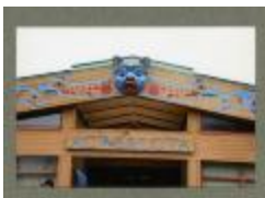
Bella Coola School entrance (BCCA-2797.13)