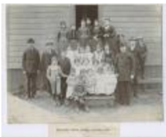
Methodist Indian School, Nanaimo, 1896 (38f-c000151-d0001-001)