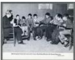
Midweek group of boys (38f-c000941-d0001-003)