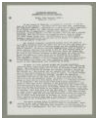
Background Knowledge: Supervisors In Indian Schools (38f-c000924-d0004-005)