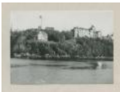
[Alberni?] Residential School (38f-c000591-d0001-002)