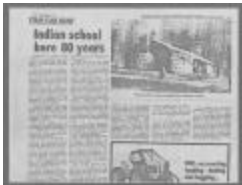
Indian School Here 80 Years (38f-c000527-d0002-001)