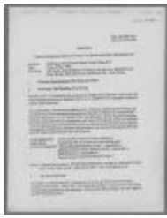
Technical Implementation Group for the Residential School Healing Fund Minutes (38f-c000005-d0007-001)