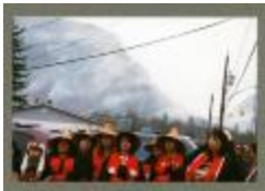
Bella Coola matrons (BCCA-2797.4)