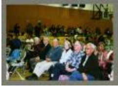
Moderator And friends (5223)