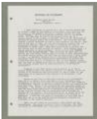
Discipline And Our Children (38f-c000924-d0004-006)