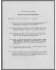
Management Of Government-Owned Residences (38f-c000528-d0017-001)