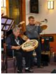
The Four Crest Singers (38f-c001524-d0174-001)