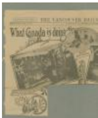
What Canada is Doing for Her Native Indian Children (38f-c000058-d0008-001)