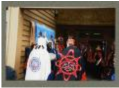
Honour dance for IRS survivors (BCCA-2797.17)