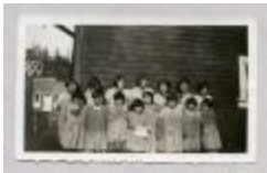
Ahousaht School Girls (38f-c000096-d0001-001)