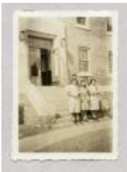
Graduating class for first year of the new Alberni Residential School