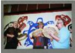
Nuu-Chah-Nulth Chiefs singing a supper song (BCCA-2797.26)