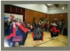
IRS survivor being honoured ( BCCA-2797.29)