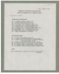
Conference Of Residential School Principals (38f-c000924-d0005-001)