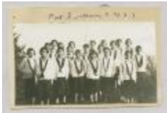
Port Simpson C.G.I.T. (38f-c000138-d0001-001)