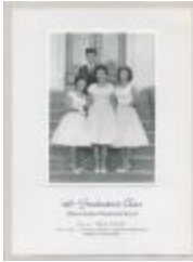
1961 Graduation Class, Alberni Indian Residential School (38f-c000153-d0001-001)