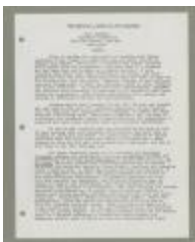
The Emotional Needs Of Our Children (38f-c000924-d0004-004)