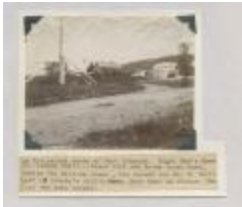
An historical scene of Port Simpson (38f-c000140-d0001-001)