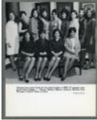
Hostesses from across Canada for the Indian Pavilion at EXPO '67 (38f-c000941-d0001-013)