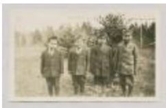
Group of Youngest Boys, Alberni Indian School (38f-c000129-d0001-001)