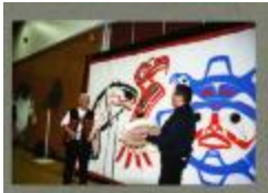
Nuxalk Drummers And Singers (BCCA-2797.27)