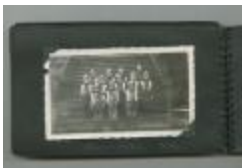
Brownies 1936 (38f-c001582-d0011-001)