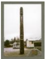
Totem with story of Indian Residential Schools (BCCA-2797.34)