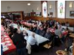
The community gathers (38f-c001524-d0004-001)