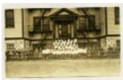
Alberni Indian Residential School and Students (38f-c000115-d0001-001)