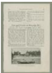
Past and Present at Ahousaht, B.C. (38f-c000170-d0005-001)