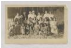
The Elizabeth Long Memorial Home, Pupils and Staff, Kitamaat, B.C. (38f-c000135-d0001-001)