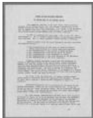
Report Of The Advisory Committee To Indian Work In The Alberni Valley (38f-c000516-d0001-001)