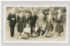
Staff of Alberni Residential School (38f-c000121-d0001-001)