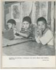
Lunch-time and small boys at kindergarten class held in Alberni Indian Residence, Alberni, B.C. (38f-c000282-d0005-001)