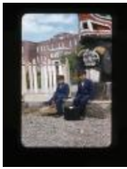
Two unidentified boys and a totem (UCCPMR_20180221_002)