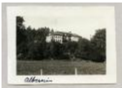
Alberni Indian Residential School (38f-c000099-d0001-001)