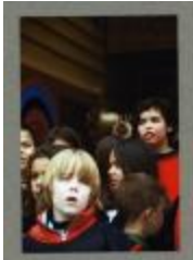
Children singing (BCCA-2797.21)