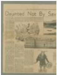
Daunted Not By Savage Curses (38f-c000058-d0022-001)