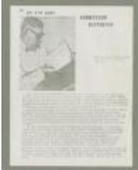
An Era Ends: Khowutzum Historian (38f-c000058-d0024-001)