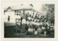
Mt. Elgin Indian Day School Band Muncey] (13d-c5715-d53)