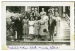
The staff at the Residential Indian School, Muncey (13d-c5715-d32)