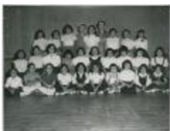
St. Thomas Music Festival. (13d-c5715-d62)