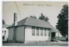
ONEIDA #2 - Junior Room. (13d-c5715-d42)