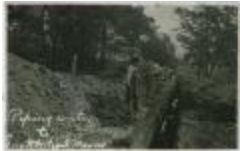
Students digging trenches for water pipes at the Mount Elgin Indian Industrial Institute, Muncney (13d-c5715-d23)