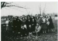
November 1946. First group of pupils, Grades VII - X. (13d-c5715-d48)