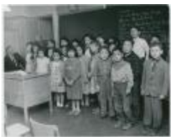
Nov. 19, 1953. Oneida #4 Pupils. (13d-c5715-d50)