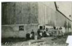
Milkmaids at the Mount Elgin Indian Industrial Institute, Muncey (13d-c5715-d22)