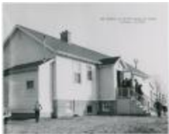
THE OPENING OF THE NEW ONEIDA #4 SCHOOL. November 19, 1953. (13d-c5715-d49)