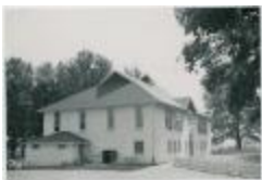
NEW SCHOOL, viewed from the south. Not occupied until January 17, 1949. (13d-c5715-d46)