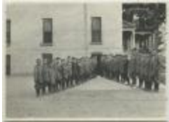
Indian boys at the Mount Elgin Indian Industrial Institute, Muncey (13d-c5715-d30)