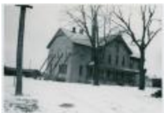
THE ORIGINAL MT. ELGIN SCHOOL, opened 1849. (13d-c5715-d47)