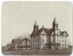
Buildings at the Mount Elgin Indian Industrial Institute, Muncey (13d-c5715-d21)