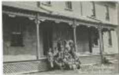
Mount Elgin Indian Residential School, Teacher's Residence and Hospital, Muncey (13d-c5715-d24)