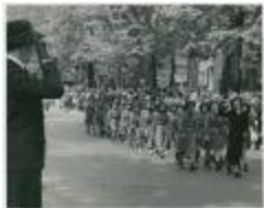
ON PARADE, LONDON. 1953 or 1955. (13d-c5715-d56)