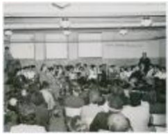
FIRST CONCERT Nov. 16. 1953 (13d-c5715-d57)