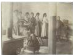
Pupils doing the laundry at the Mount Elgin Indian Industrial Institute, Muncey (13d-c5715-d27)