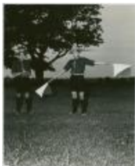
[Practicing flags at Cub Scouts] (13d-c5715-d63)