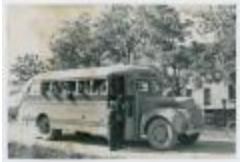
[School bus at Mt. Elgin Indian Day School] (13d-c5715-d40)