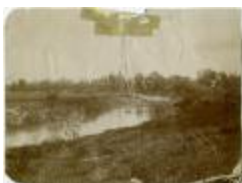
Mount Elgin Indian Industrial Institute, view of the River Thames and the Institute, Muncey (13d-c5715-d25)