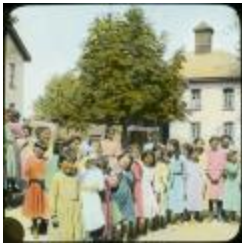
Indian girls, Muncey Indian Inst. (13d-c5715-d35)