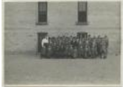
Boys with some of the staff at the Mount Elgin Indian Industrial Institute, Muncey (13d-c5715-d31)