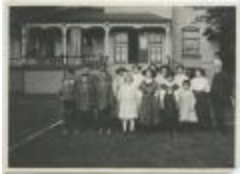
Some of the younger boys and girls at the Mount Elgin Indian Industrial Institute, Muncey (13d-c5715-d29)