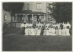
Staff and girls at the Mount Elgin Indian Industrial Institute, Muncey (13d-c5715-d28)