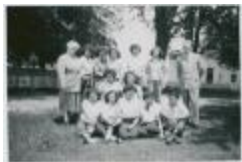
High School Class (13d-c5715-d59)