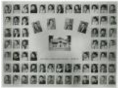
Mt. Elgin Indian Day School 1952-53 (13d-c5715-d58)