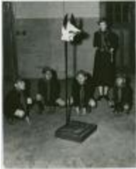
[Students at Cub Scouts] (13d-c5715-d68)