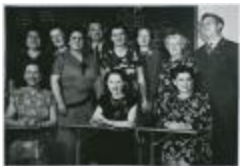
Staff 1948-49 (13d-c5715-d41)