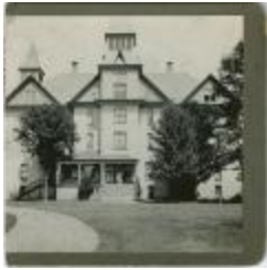
Exterior of the Mount Elgin Indian Industrial Institute, Muncey (13d-c5715-d20)