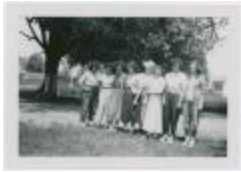
1952-53 Gr. IX ? (13d-c5715-d52)