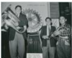
ST. THOMAS FESTIVAL, Nov. 1956 (13d-c5715-d61)