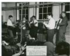
OFFICIAL OPENING, NEW SCHOOL Feb. 18. 1949. (13d-c5715-d39)