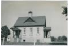
ONEIDA #3 - One of the older schools. Continued in use. (13d-c5715-d45)