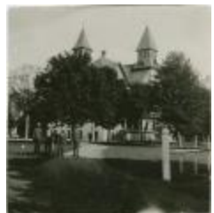
Exterior of the Mount Elgin Indian Industrial Institute, Muncey (13d-c5715-d19)