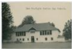
New Mt. Elgin Indian Day School (13d-c5715-d44)