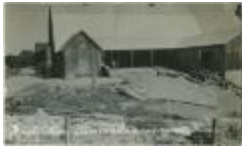
Institution barn undergoing repair, Muncey (13d-c5715-d37)