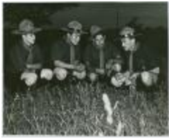
[Student at Cub Scouts] (13d-c5715-d67)