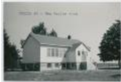
ONEIDA #2 - New Senior Room (13d-c5715-d43)