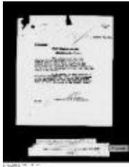
Memorandum, 27 October 1952 (c-8760_40.pdf)