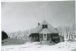
Principal's Residence (13d-c5713-d2)