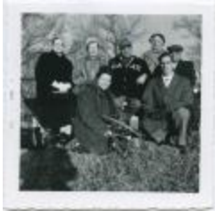
My trip to Berens River (13d-c5713-d26)