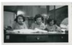
In the Sewing Room Mar. [March] 1952, Portage la Prairie Indian Res. [Residential] School (13d-c5713-d23)