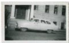
Portage la Prairie, June 1951. The new car (13d-c5713-d25)