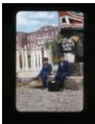
Two unidentified boys and a totem (UCCPMR_20180221_002)