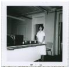
Asst. [Assistant] Indian Girl Cook, Portage Residential 1959 (13d-c5713-d19)