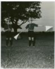
[Practicing flags at Cub Scouts] (13d-c5715-d63)