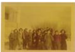
[Indian girls from Round Lake Residential School outside the mission] (13d-c5710-d13)