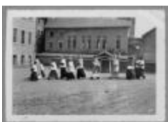
Photograph, 10 June 1951 (10a-c000617-d0010-001)