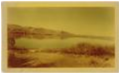
Round Lake taken from the school property : across the Lake is the Reserve (13d-c5710-d27)