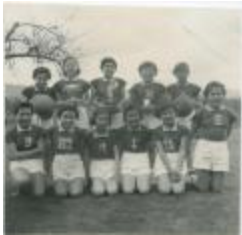
Pre-midget champions B.C. Basketball, 1955 (13d-c5699-d3)