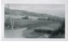
Road leading out from the school to the Principal's Residence with the Qu'Appelle hills in the background, Round Lake, Sask. (13d-c5710-d26)