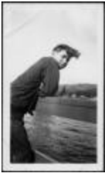
Photograph, 1950 (10a-c000480-d0022-001)