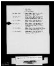
Stikine Agency - Lower Post Residential School (Teslin Lake) - Establishment - Accounts - Buildings Specifications (Plan), 1949-1950 (2057090)