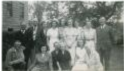
Portage la Prairie staff 1951 (13d-c5713-d3)