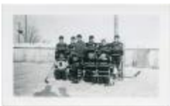
Portage la Prairie 1957, The "Cubs." The little boy's hockey team (13d-c5713-d11)