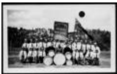
Photograph, 1952 (10a-c000392-d0061-001)