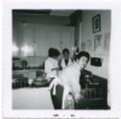
Cleaning up. Portage Residential (13d-c5713-d29)