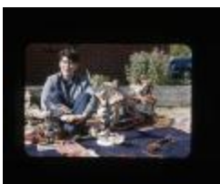
Unidentified young man with indigenous art (UCCPMR_20180221_005)