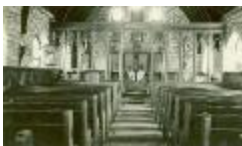
Chapel at Indian Residential School at Lytton (13a-c005010-d0004-001)