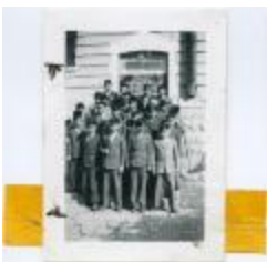
Portage la Prairie 1951, Ready for church (13d-c5713-d21)