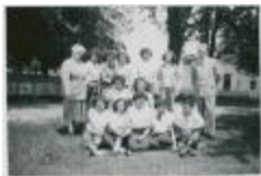
High School Class (13d-c5715-d59)