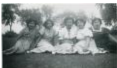
Part of the Senior Sewing Class, 1951-1952 (13d-c5713-d5)