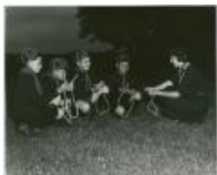
[Knot practice at Cub Scouts] (13d-c5715-d64)