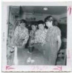
[Four students in a classroom at the Indian Residential School, Norway House] (13d-c5712-d17)