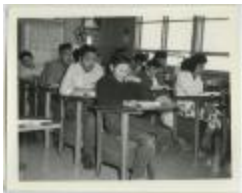
[Students of the Morley Indian Residential School] (13d-c5705-d19)