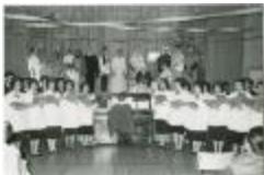
[Students' Christmas presentation] (13d-c5713-d34)