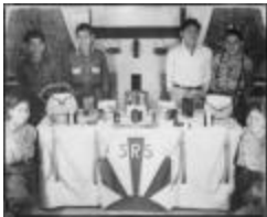
Photograph, 1958 (10a-c000480-d0054-001)