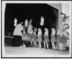
Photograph, 21 May 1950 (10a-c000450-d0064-001)