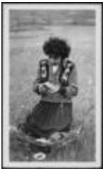
Photograph, 1950 (10a-c000450-d0065-001)