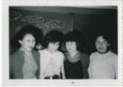
Four Indian students at I.R.S., Norway House : they were my teachers for the beginners (13d-c5712-d16)