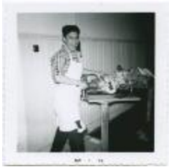
Portage Residential 1959 [Male student carving turkey]. (13d-c5713-d16)