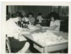
[Students at sewing class] (13d-c5713-d27)