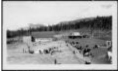
Photograph, 1950 (10a-c000480-d0021-001)