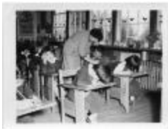
Indian Residential, K.P. class (13d-c5699-d11)