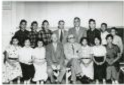
[A group of students with government and school officials] (13d-c5713-d31)