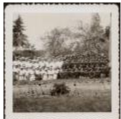
Photograph, May 1952 (10a-c000479-d0011-001)