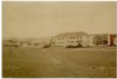
2-room day school, Residential s[school], New Day School [Morley Residential School] (13d-c5705-d2)