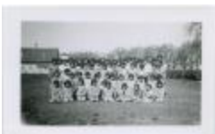
Portage la Prairie May 24, 1951. All the girls, 62 (13d-c5713-d17)