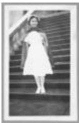
Photograph, 1952 (10a-c000432-d0030-001)