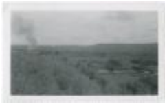
Road leading from the school across the bridge to the Reserve, Round Lake Sask. (13d-c5710-d25)