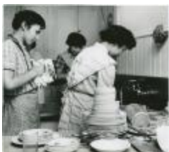
[Female students washing the dishes] (13d-c5713-d9)