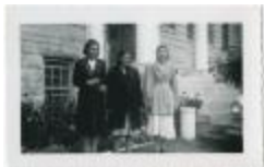
At the Homemakers Conference, Indian Res.[Residential] School, P. la P. [Portage la Prairie], August 1952, 3 Indian ladies (13d-c5713-d20)