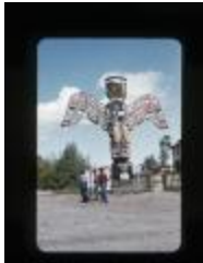
Three unidentified boys and a totem (UCCPMR_20180221_003)