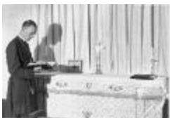
Chapel at Indian Residential School at Lytton (13a-c005010-d0001-001)