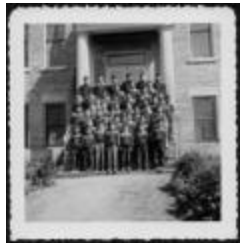
Photograph, May 1952 (10a-c000479-d0045-001)