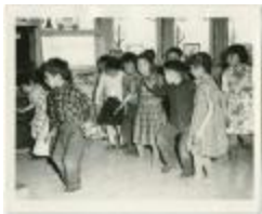
[Children performing a song with actions, Norway House Indian Residential School, Man.] (13d-c5712-d14)