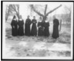
Photograph, 26 May 1950 (10a-c000392-d0081-001)