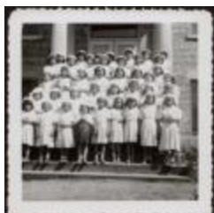
Photograph, May 1952 (10a-c000479-d0013-001)