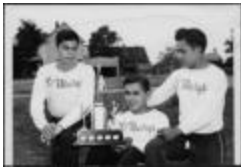
Photograph, 1950 (10a-c000450-d0024-001)