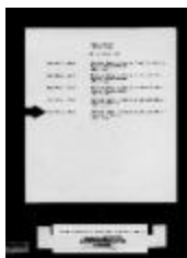
Kootenay Agency - Kootenay Residential School - Payments Of Grants, 1931-1951 (2056043)