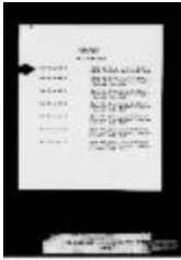
Stuart Lake Agency - Lejac Residential School - Payments Of Grants, 1917-1952 (2056027)