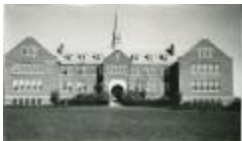
Edmonton Residential School (13d-c5704-d1)