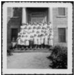
Photograph, May 1952 (10a-c000479-d0050-001)