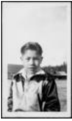
Photograph, 1950 (10a-c000480-d0020-001)