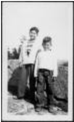
Photograph, 1950 (10a-c000480-d0025-001)