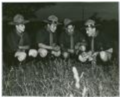
[Student at Cub Scouts] (13d-c5715-d67)