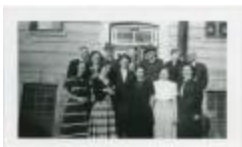
The staff, Indian Residential School, Portage la Prairie, September 1950 (13d-c5713-d12)