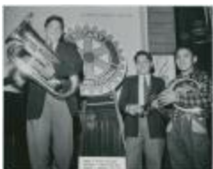
ST. THOMAS FESTIVAL, Nov. 1956 (13d-c5715-d61)