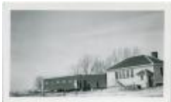
At Portage la Prairie, March 13, 1950 (13d-c5713-d22)