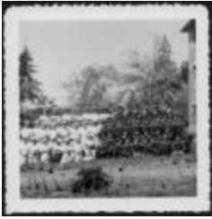
Photograph, 11 May 1952 (10a-c000479-d0031-001)