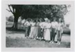
1952-53 Gr. IX ? (13d-c5715-d52)