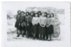
C.G.I.T. girls (not in uniform) in front of the cairn, Round Lake Residential School, Sask. (13d-c5710-d10)