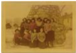
C.G.I.T. group in Sunday clothes with cairn back of them, Round Lake Residential School, Sask. (13d-c5710-d11)