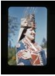
Unidentified young woman with headdress (UCCPMR_20180221_004)