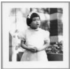
Photograph, 1959 (10a-c000432-d0013-001)