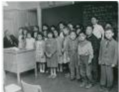
Nov. 19, 1953. Oneida #4 Pupils. (13d-c5715-d50)