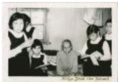
[Explorers holding service in an Indian home, Norway House, Man.] (13d-c5712-d15)