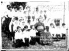
Mission City, Confirmation - St. Mary's Indian School (38b-c000819-d0003-001)