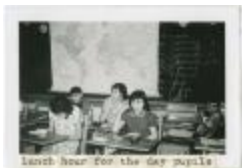
[Day pupils eating lunch, Norway House Indian Residential School] (13d-c5712-d25)