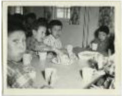
[Students of the Morley Indian Residential School] (13d-c5705-d20)