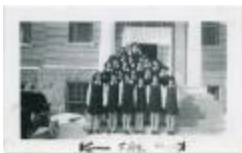
Ready for church in P. la P. [Portage la Prairie]. [Female students in school uniform standing in front of the school facade]. (13d-c5713-d33)