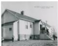
THE OPENING OF THE NEW ONEIDA #4 SCHOOL. November 19, 1953. (13d-c5715-d49)