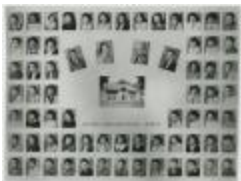
Mt. Elgin Indian Day School 1952-53 (13d-c5715-d58)