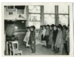
[Children performing a song with actions, Norway House Indian Residential School, Man.] (13d-c5712-d13)