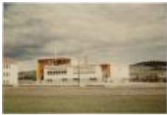
New school; 4 rooms, apt [apartment], office and basement rooms [Morley Residential School] (13d-c5705-d3)