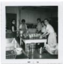
Sandwich making, Portage Residential 1959 (13d-c5713-d15)