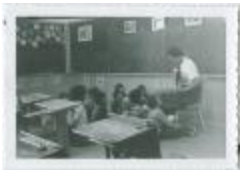
[Storytime at Norway House Indian Residential School] (13d-c5712-d19)