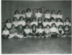
St. Thomas Music Festival. (13d-c5715-d62)