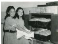
[Female students baking bread] (13d-c5713-d36)