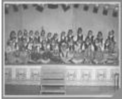
Photograph, 1958 (10a-c000435-d0021-001)