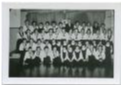
C.G.I.T. group, Norway House Indian Residential School (13d-c5712-d24)