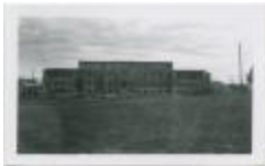
Norway House Indian Residential School : new building under construction (13d-c5712-d23)