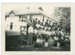
Mt. Elgin Indian Day School Band Muncey] (13d-c5715-d53)