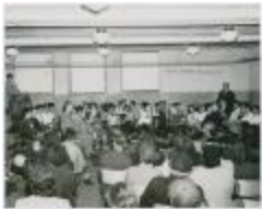
FIRST CONCERT Nov. 16. 1953 (13d-c5715-d57)