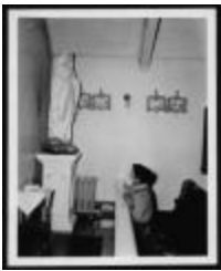
Photograph, 26 May 1950 (10a-c000392-d0079-001)