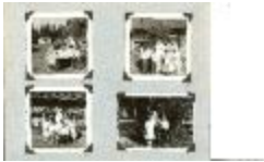
Cérémonies religieuses en 1959-1960 (45p-c000006-Cérémonies 1959)