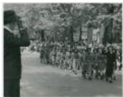
ON PARADE, LONDON. 1953 or 1955. (13d-c5715-d56)