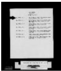
Cowichan Agency - Kuper Island Industrial School - Payments Of Grants, 1913-1952 (2056048)