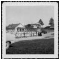
Photograph, May 1952 (10a-c000479-d0032-001)