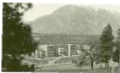
Indian Residential School at Lytton (13a-c005010-d0003-001)