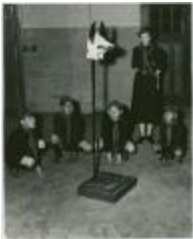
[Students at Cub Scouts] (13d-c5715-d68)