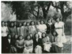
This Snap Was Taken A Year Ago, So All Our Big Girls Are Not Here Now (13d-c5711-d4)