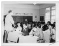
[Teacher and class, Alberni Indian Residential School]