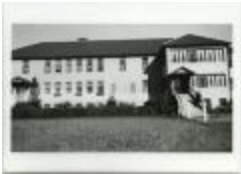
Morley Indian Residential School, Morley, Alta. (13d-c5705-d22)