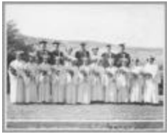
Photograph, 1956 (10a-c000435-d0036-001)