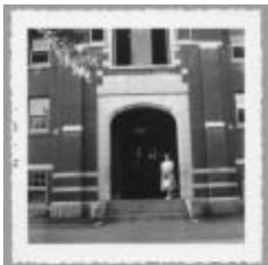
Photograph, July 1958 (10a-c000435-d0003-001)