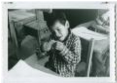
[Student shaping his play dough : art class at Norway House Indian Residential School] (13d-c5712-d21)