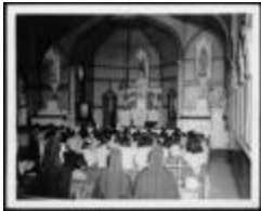
Photograph, 26 May 1950 (10a-c000392-d0082-001)