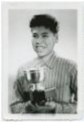
[Male student holding trophy] (13d-c5713-d30)