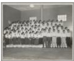
Photograph, 1956 (10a-c000435-d0018-001)