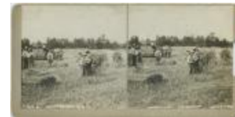
Boys gathering the grain sheaves at the Muncey Indian Residential School (13d-c5715-d10)