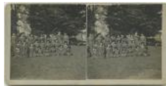
Girls at the Muncey Indian Residential School (13d-c5715-d8)