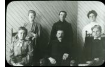
Staff at Norway House School (13d-c5712-d124)