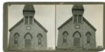
Church at the Mount Elgin Indian Industrial Institute, Muncey (13d-c5715-d15)