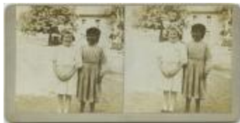
An Indian and white child at the Muncey Indian Residential School (13d-c5715-d7)