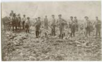
[Harvest time in the vegetable garden, Brandon Indian School farm] (13d-c5711-d18)