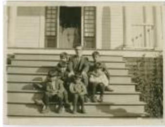
The preacher and the W.M.S. Home boys on the steps of the Home, Kitimaat (13d-c5703-d10)