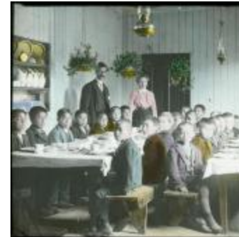
[Brandon boys in the dining room, Brandon Industrial Institute] (13d-c5711-d5)