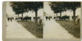
Boys gathering the cows for milking at the Mount Elgin Indian Industrial Institute, Muncey (13d-c5715-d11)