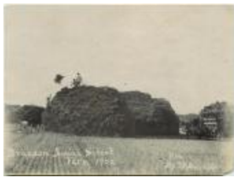
[Bringing in the hay, Brandon Indian School farm] (13d-c5711-d14)