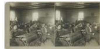
Class at the Mount Elgin Indian Industrial Institute, Muncey (13d-c5715-d6)