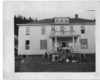
Elizabeth Long Memorial Home, Kitimaat : staff and children (13d-c5703-d23)