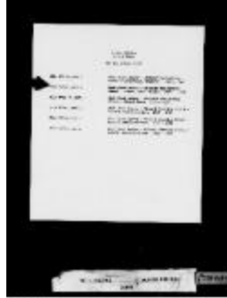
West Coast Agency - Ahousaht Residential School - School Land (Plan), 1907-1936 (2055994)