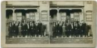
Convention of Church Officials and Indian Missionaries Mount Elgin Indian Industrial Institute, Muncey (13d-c5715-d3)