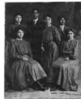
Graduate students of the Coqualeetza Industrial Institute (13d-c5701-d15)