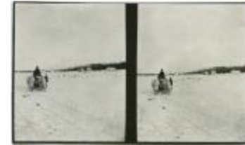
[Travelling by ox team, Norway House] (13d-c5712-d7)