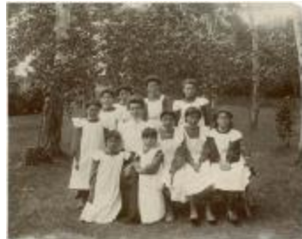
S.S. class, Brandon Industrial Institute (13d-c5711-d12)