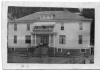
Elizabeth Long Memorial Home : before cement foundation (13d-c5703-d5)