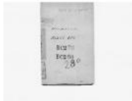
Field Book, 1 January 1904 (91a-c000062-d0001-001)