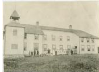
[Staff and students assembled outside the Indian Boarding School at Norway House] (13d-c5712-d39)