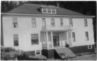
The "Home," Kitimaat, B.C. (13d-c5703-d4)