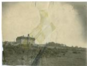
[Brandon Industrial Institute, Brandon, Man.] (13d-c5711-d9)