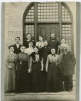
Staff of the Brandon Indian Industrial Institute