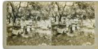
Boys working with the bees at the Muncey Indian Residential School (13d-c5715-d9)