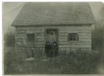
Norway House jail on Jail Island : two government nurses sitting on steps (13d-c5712-d49)