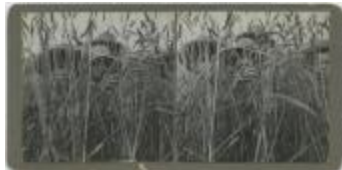
Boys in the wheat field at the Mount Elgin Indian Industrial Institute, Muncey (13d-c5715-d12)