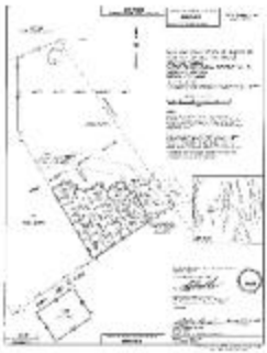
Plan, 1 July 1905 (91a-c000045-d0001-001)