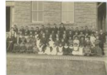
[Teachers and students, Red Deer Industrial Institute] (13d-c5706-d7)