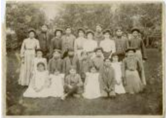
Indian children from Fisher River, Portage la Prairie Indian Boarding School (13d-c5713-d38)