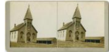
Exterior of the church and shed at the Mount Elgin Indian Industrial Institute, Muncey (13d-c5715-d16)