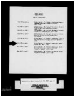
Lytton Agency - St. George's Residential School - School Land, 1891-1929 (2056071)