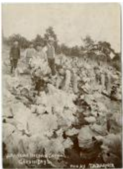
[Garden boys harvesting cabbages under the watchful eye of their instructor, Brandon Indian School farm] (13d-c5711-d16)