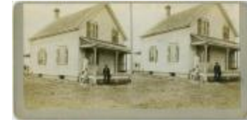
House on the Mount Elgin Indian Industrial Institute, Muncey (13d-c5715-d4)