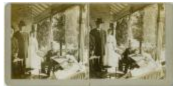
Muncey Indian Institute, 1909 (13d-c5715-d26)