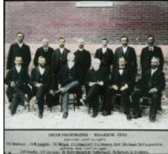
Indian missionaries, Brandon (13d-c5711-d56)