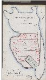
Plan, 3 April 1905 (91a-c000046-d0001-001)