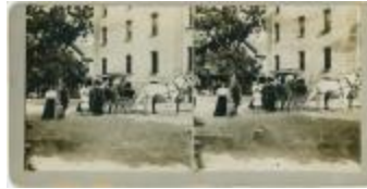
Horse and carriage in front of the Mount Elgin Indian Industrial Institute, Muncey (13d-c5715-d18)