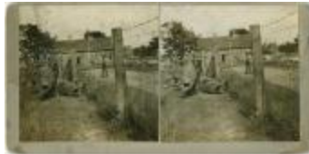
Boys watching the pigs at the Mount Elgin Indian Industrial Institute, Muncey (13d-c5715-d13)