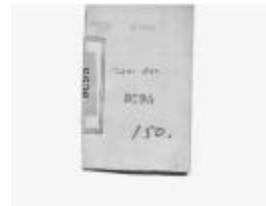
Field Book, 1 November 1904 (91a-c000057-d0001-001)