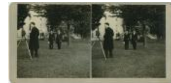
Photographer on the Mount Elgin Indian Industrial Institute, Muncey (13d-c5715-d5)