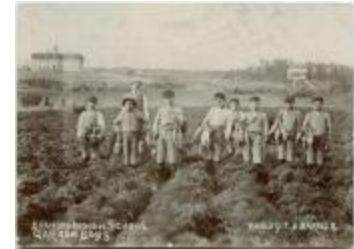
[Garden boys, Brandon Indian School : boys and their instructor showing some of the fruits of their labours in the carrot patch] (13d-c5711-d17)