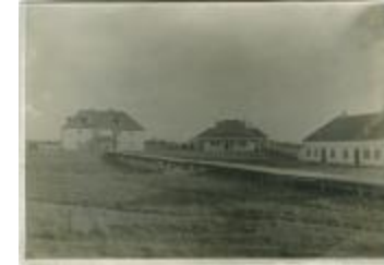
Interior of the Hudson's Bay Company Fort at Norway House (13d-c5712-d48)