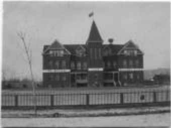
["We Mourn Our Beloved Queen" : Coqualeetza Industrial Institute] (13d-c5701-d7)