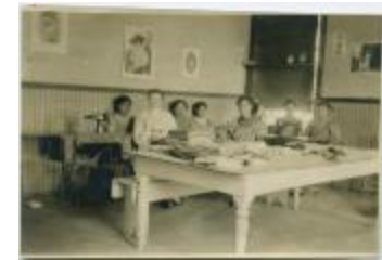
[Sewing class, Brandon Industrial Institute] (13d-c5711-d13)