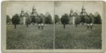
Exterior of the Muncey Indian Residential School (13d-c5715-d17)