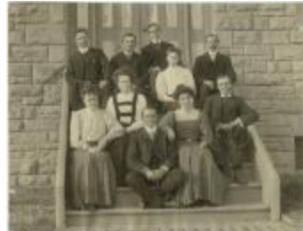
[Staff of the Red Deer Industrial School] (13d-c5706-d11)