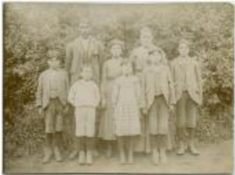
[Some staff and students of the Brandon Industrial Institute] (13d-c5711-d11)