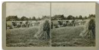
[Boys and instructors bringing in the hay, Muncey Indian Institute] (13d-c5715-d36)