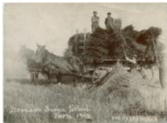
[Gathering stooks, Brandon Indian School farm] (13d-c5711-d15)