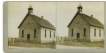
School house at the Muncey Indian Residential School (13d-c5715-d14)