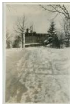
[Brandon Institute in winter (side view)] (13d-c5711-d50)