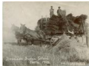
[Gathering stooks, Brandon Indian School farm] (13d-c5711-d15)