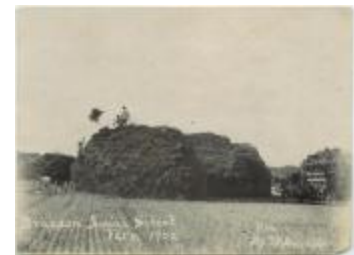
[Bringing in the hay, Brandon Indian School farm]