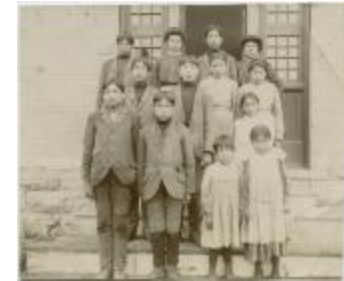
[Students of the Brandon Industrial Institute] (13d-c5711-d10)