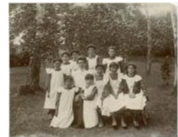
S.S. class, Brandon Industrial Institute (13d-c5711-d12)