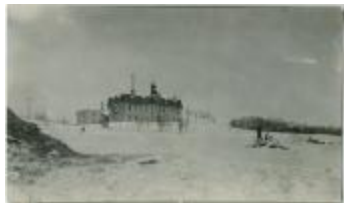
Brandon Indian Institute, Man. (13d-c5711-d51)