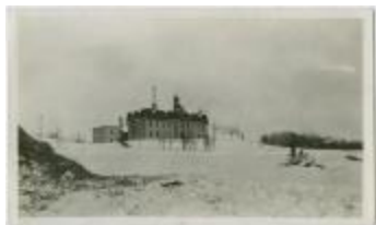
Brandon Institute (13d-c5711-d39)