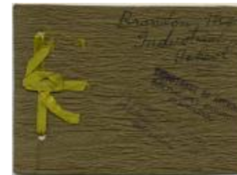
With heartiest Christmas greetings ... from the principal and staff of the Indian Industrial School, Brandon, Man. (13d-c5711-d54)