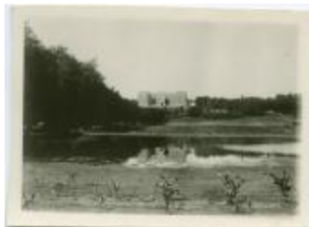
Brandon Indian Institute, Man. (13d-c5711-d53)