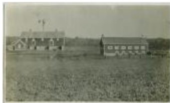
[Barns and pasture, Brandon Industrial Institute] (13d-c5711-d48)