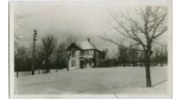
House of the instructor in carpentry, Brandon, Man. (13d-c5711-d38)