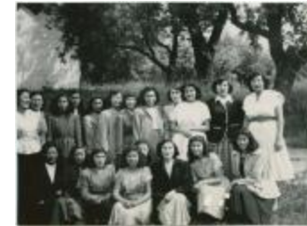
This Snap Was Taken A Year Ago, So All Our Big Girls Are Not Here Now (13d-c5711-d4)