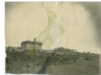
[Brandon Industrial Institute, Brandon, Man.] (13d-c5711-d9)