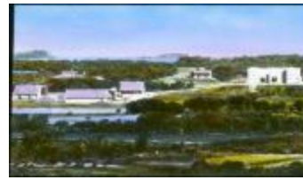
Brandon Indian Inst., Man. (13d-c5711-d58)