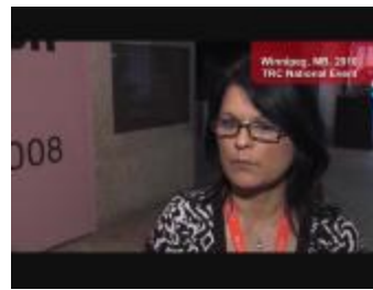
Older Than America (MDWNE110b)