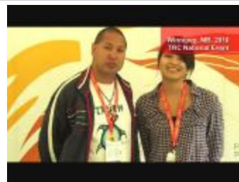
Sharing Corner (MDWNE115b)