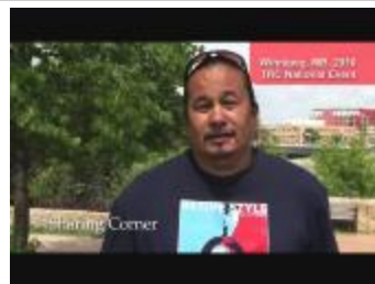
Sharing Corner (MDWNE114b)