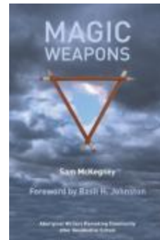
Magic weapons : Aboriginal writers remaking community after residential school (3913987)