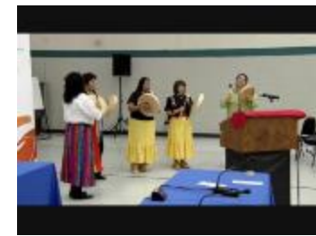
Ontario Hearings (MDOCE102)