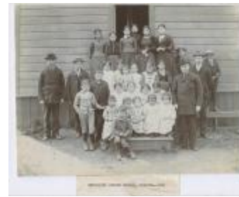
Methodist Indian School, Nanaimo, 1896 (38f-c000151-d0001-001)