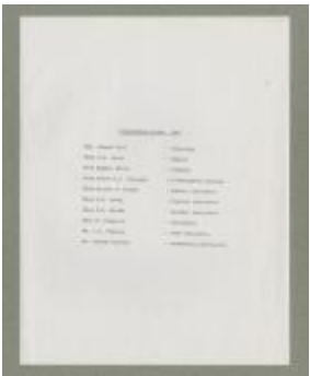
Coqualeetza Staff 1899 (38f-c000058-d0007-001)