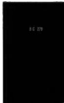
Field Book, 1 January 1891 (91a-c000063-d0001-001)