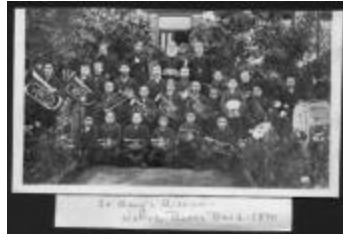
Photograph, 1890 (10a-c000779-d0003-001)