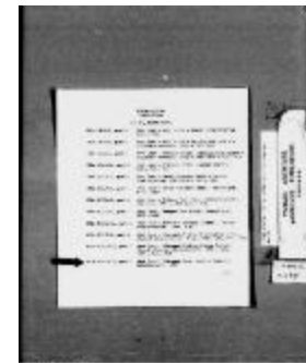
West Coast Agency - Clayoquot Roman Catholic School - Establishment, 1897 (2054355)