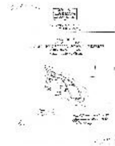
Plan, 1 January 1891 (91a-c000065-d0001-001)