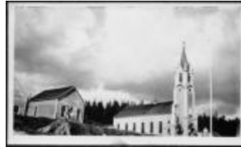
Photograph, 1895 (10a-c000480-d0035-001)