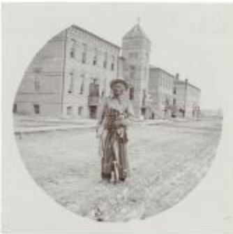
Outdoor portrait of Chief Washakie or Shoots-on-the-Run or The Rattle, posed in front of Shoshone School, Shoshone Reservation, Wyoming