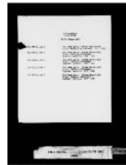
West Coast Agency - Alberni Residential School - Establishment (Plans), 1892-1895 (2056005)