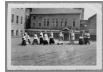
Photograph, 10 June 1951 (10a-c000617-d0010-001)