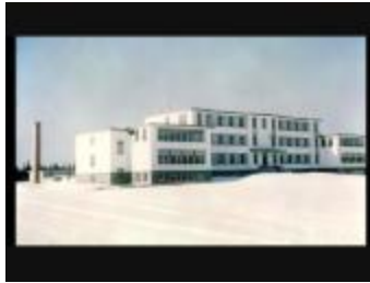
Survol des témoignages au Québec / Overview of Quebec statements (MDQH101)