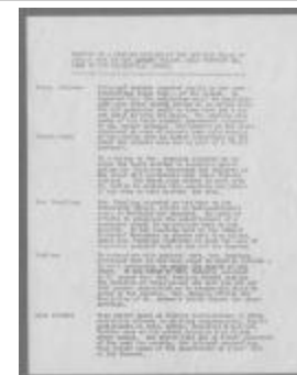
Minutes of a regular meeting of the Advisory Board to Indian Work in the Alberni Valley (38f-c000516-d0006-001)