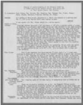
Minutes of a regular meeting of the Advisory Committee on Indian Work in the Alberni Valley (38f-c000516-d0004-001)