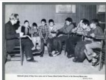
Midweek group of boys (38f-c000941-d0001-003)