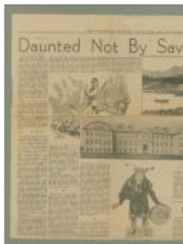
Daunted Not By Savage Curses (38f-c000058-d0022-001)