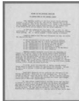
Report Of The Advisory Committee To Indian Work In The Alberni Valley (38f-c000516-d0001-001)