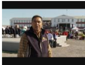
Bearing Witness (MDNNE103a)