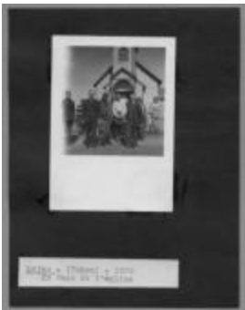
Photograph, 1939 (10a-c000618-d0001-001)