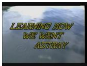
Learning how we went astray (38f-c001581-d0004-001)