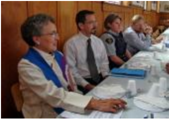
Some representatives of the church and government (38f-c001524-d0006-001)