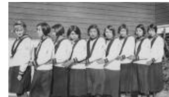
C.G.I.T. Canadian Girls in Training, United Church (a034751)