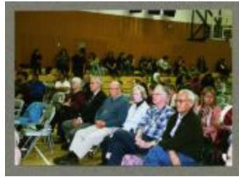
Moderator and friends (5223)