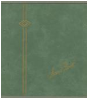
Alberni Indian Residential School Scrapbook (38f-c000003-d0001-001)