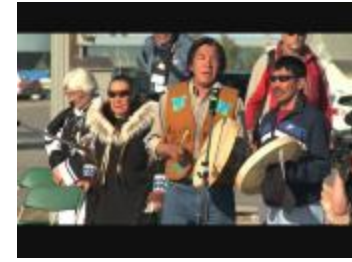
Opening Ceremonies (MDNNE114b)