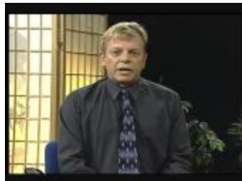
Questions about Residential Schools (38f-c001581-d0007-001)