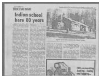
Indian School Here 80 Years (38f-c000527-d0002-001)