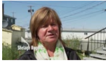
Honourary Witness Ceremony (MDNNE126)