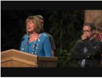
Honorary Witnesses on Truth and Reconciliation (MDOCE104)