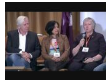
Honorary Witnesses on Moving Forward (MDOCE106)