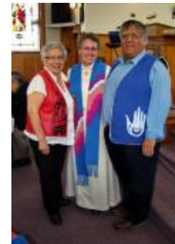
United Church and First Nations elders (38f-c001524-d0063-001)