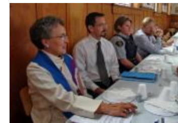
Some representatives of the church and government (38f-c001524-d0006-001)