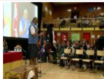
Expressions of Reconciliation - Day 4 (MDNNE108)