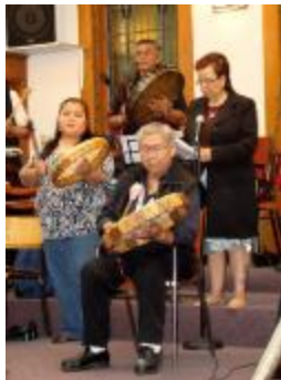
The Four Crest Singers (38f-c001524-d0177-001)