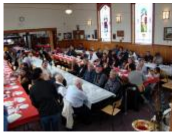
The community gathers (38f-c001524-d0004-001)