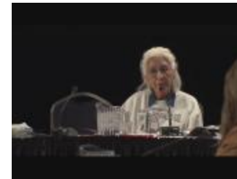
Commissioners Sharing panel (MDANE102)