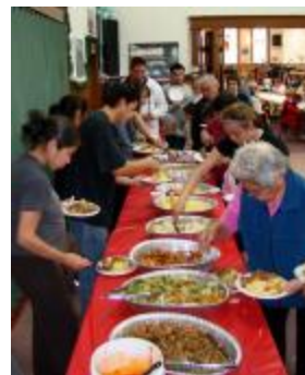
The feast (38f-c001524-d0071-001)