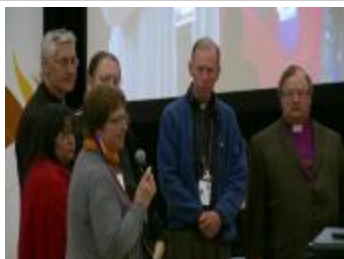
Expressions of Reconciliation - Anglican Church (MDNNE106a)