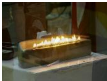
Expressions of Reconciliation - Day 2 (MDNNE107)