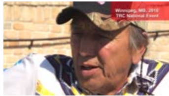
Pipe Ceremony (MDWNE111b)