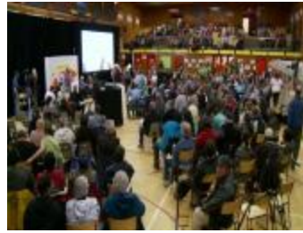
Interpreters of the Truth (MDNNE110)