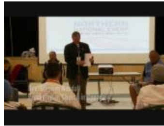
Presbyterian Act of Reconciliation (MDNNE117)