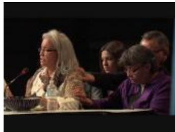
A National Journey for Reconciliation (MDAB652)