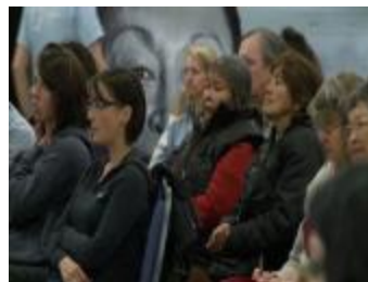
Screening of Hope (MDNNE118a)