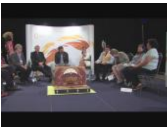
Road to Reconciliation (MDANE107)