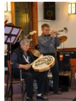
The Four Crest Singers (38f-c001524-d0174-001)