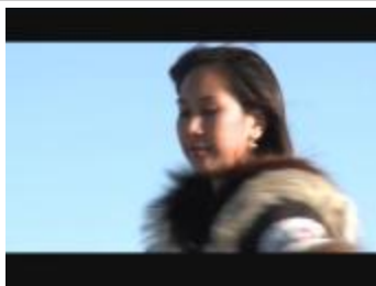
Welcome to Inuvik (MDNNE122a)