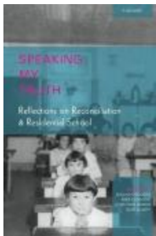
"Speaking my truth" : reflections on reconciliation & residential school (7283167)