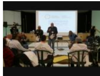
United Church Act of Reconciliation (MDNNE121)