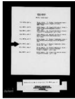
Lytton Agency - St. George's Residential School - School Land, 1891-1929 (2056071)