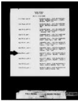
Kwakwewth Agency - Alert Bay Residential School - Livestock - Supplies - Accounts, 1921-1932 (2055984)