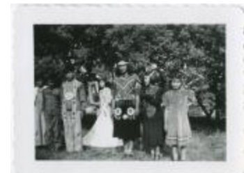
Indian Children In Theatrical Costumes : We Were Invited To Take The Program To Some Towns, But Someone With Higher Authority Than The Staff Said "no More" (13d-c5710-d7)