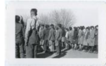
Indian children at flag raising at beginning of every school day, Round Lake, Sask. (13d-c5710-d18)