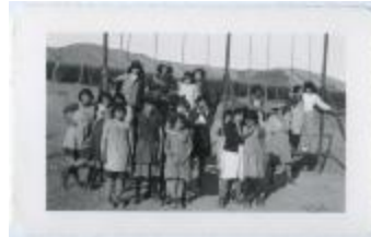
Girls with their dress-up hats at the swings on their playground, Round Lake, Sask. (13d-c5710-d20)