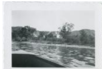
The residence and the school from the Lake with the Qu'Appelle hills in the background (13d-c5710-d23)