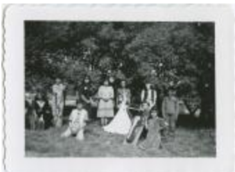
Indian Children In Theatrical Costumes : We Were Invited To Take The Program To Some Towns, But Someone With Higher Authority Than The Staff Said "no More" (13d-c5710-d4)