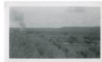
Road leading from the school across the bridge to the Reserve, Round Lake Sask. (13d-c5710-d25)