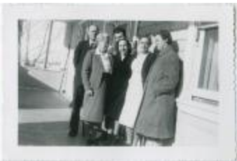
[Staff of the Round Lake Residential School, Sask.] (13d-c5710-d14)