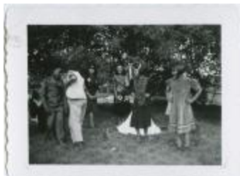
Indian Children In Theatrical Costumes : We Were Invited To Take The Program To Some Towns, But Someone With Higher Authority Than The Staff Said "no More" (13d-c5710-d5)