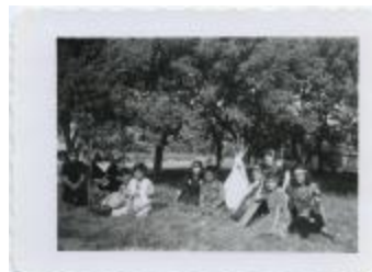
Indian Children In Theatrical Costumes : We Were Invited To Take The Program To Some Towns, But Someone With Higher Authority Than The Staff Said "no More" (13d-c5710-d6)