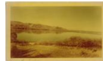
Round Lake taken from the school property : across the Lake is the Reserve (13d-c5710-d27)