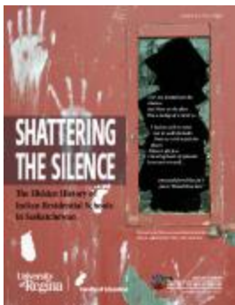
Shattering the silence : the hidden history of Indian residential schools in Saskatchewan (992527243603479)