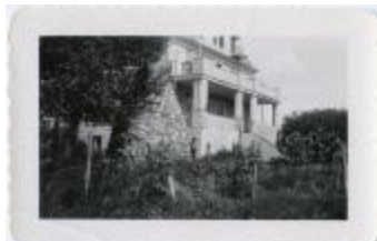
A view of the residence with the cairn, Round Lake Residential School, Sask. (13d-c5710-d24)