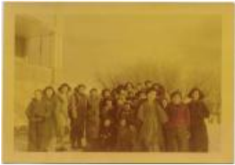
[Indian girls from Round Lake Residential School outside the mission] (13d-c5710-d13)