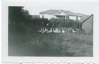
Mr. Bell's ducks with the school building in the background, Round Lake, Sask. (13d-c5710-d16)