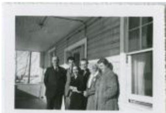
[Staff of the Round Lake Residential School, Sask.] (13d-c5710-d15)