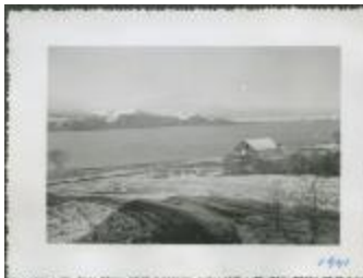
Round Lake [Residential School] (13d-c5710-d3)