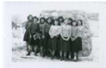
C.G.I.T. girls (not in uniform) in front of the cairn, Round Lake Residential School, Sask. (13d-c5710-d10)