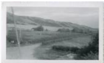
Road leading out from the school to the Principal's Residence with the Qu'Appelle hills in the background, Round Lake, Sask. (13d-c5710-d26)