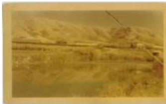
Principal's Residence, Round Lake Residential School (13d-c5710-d12)