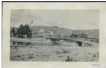
Round Lake [Residential School] (13d-c5710-d1)