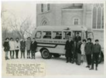
Church bus on the Round Lake Indian mission, Grenfell, Sask. : the students are from the Sintaluta Reserve, grades 7 & 8 : they are on their way to join other students at Broadview, Sask. (13d-c5710-d31)