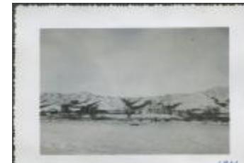
[View of the school from the lake] (13d-c5710-d2)