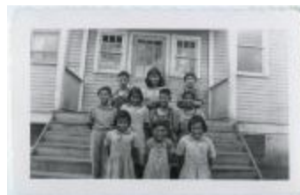
Some of the children on the steps of the school, Round Lake, Sask. (13d-c5710-d19)