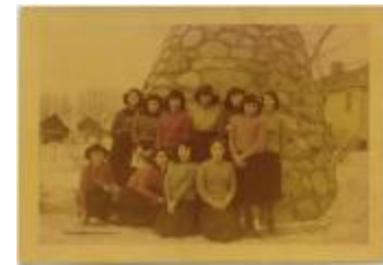
C.G.I.T. group in Sunday clothes with cairn back of them, Round Lake Residential School, Sask. (13d-c5710-d11)