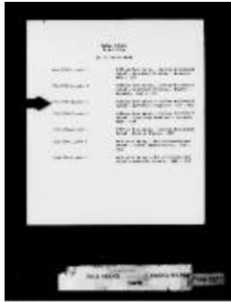
Williams Lake Agency - Caribou Residential School - Livestock - Supplies, 1927-1932 (2056008)