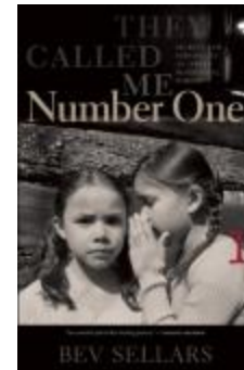
They called me number one : secrets and survival at an Indian residential school (6549711)

Tilly : a story of hope and resilience (7284724)