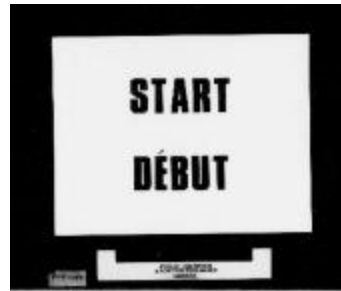
Kootenay Agency - Kootenay Residential School - Livestock - Accounts, 1925-1944 (2096121)