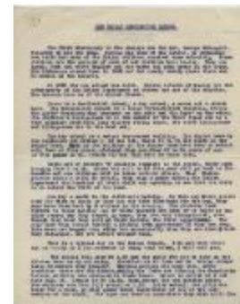
The Indian Residential School (MOA_20180215_005)