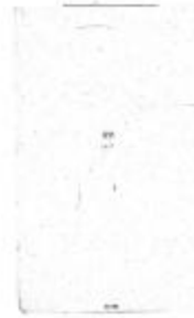
Davin Report (UNKNOWN_20180307_003)