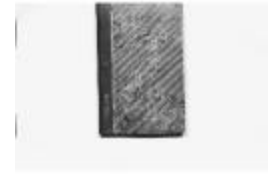
Field Notes, 1919 (91a-c000033-d0001-001)