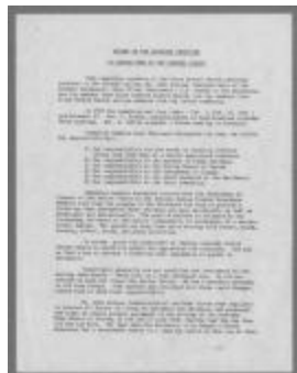
Report Of The Advisory Committee To Indian Work In The Alberni Valley (38f-c000516-d0001-001)