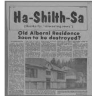
Old Alberni Residence soon to be destroyed? (38f-c000528-d0016-001)