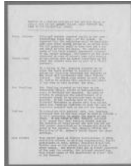
Minutes of a regular meeting of the Advisory Board to Indian Work in the Alberni Valley (38f-c000516-d0006-001)