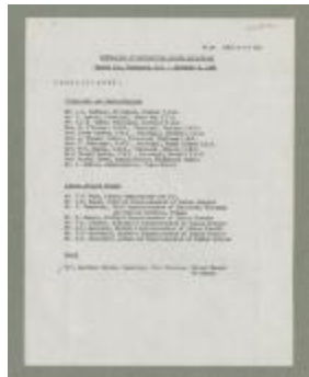
Conference Of Residential School Principals (38f-c000924-d0005-001)