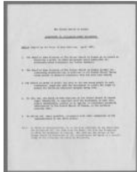
Management Of Government-Owned Residences (38f-c000528-d0017-001)