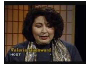
Rebirth in the face of darkness (38f-c001581-d0003-001)