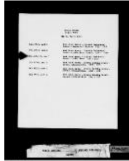
West Coast Agency - Ahousaht Residential School - School Land, 1930-1936 (2055996)