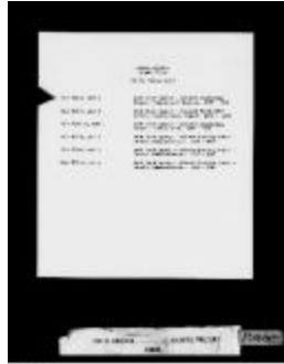
West Coast Agency - Ahousaht Residential School - Inspectors' Reports, 1933-1940 (2055993)