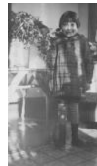
Young girl by note table at Morley Residential School (a034735)