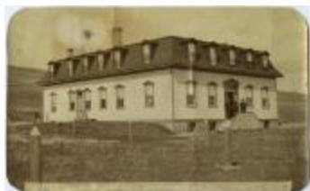
McDougall Orphanage for Indian children, Morley Alta.