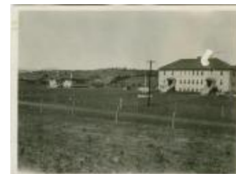
Morley Home And School (13d-c5705-d8)