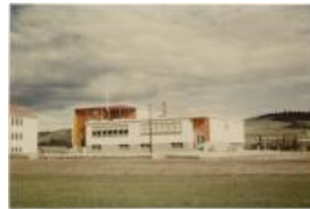
New school; 4 rooms, apt [apartment], office and basement rooms [Morley Residential School] (13d-c5705-d3)