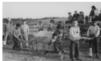
Young boys playing "Stampede" in Morley, Alberta (a034687)