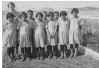
Part Of Junior Choir (a034734)