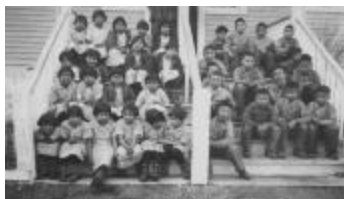
Junior class at Morley Residential School (a034742)