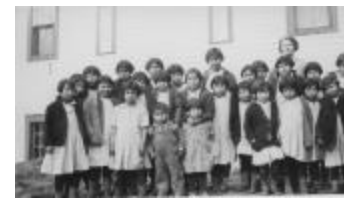
Junior girls at Morley Residential School (a034743)