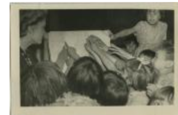
Scenes from Morley Indian Residential School, Morley, Alta. (13d-c5705-d15)