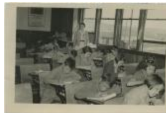
Scenes from Morley Indian Residential School, Morley, Alta. (13d-c5705-d14)