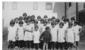
Junior division at the Morley Residential School (a034731)