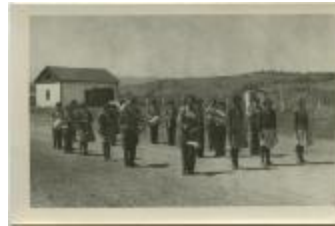
Morley Reservation school band (13d-c5705-d12)