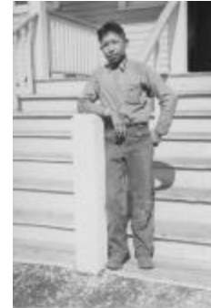
Stoney Nakoda boy at Morley Residential School (a034736)