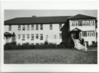
Morley Indian Residential School, Morley, Alta. (13d-c5705-d22)