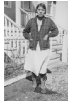
Stoney Nakoda girl at school (a034744)