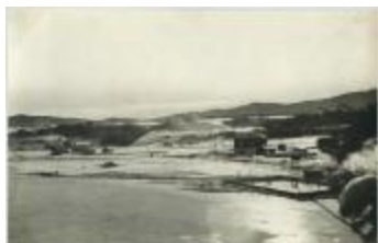
United Church mission and Indian Residential School, Morley, Alta.