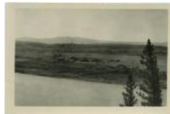
Scenes from Morley Indian Residential School, Morley, Alta. (13d-c5705-d13)