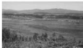
Morley, Alberta