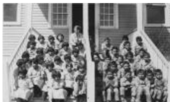
Junior Class of the Morley Residential School (a034729)