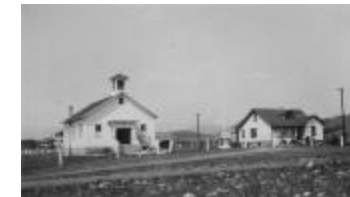
United Church and minister's house in Morley, Alberta (a034700)