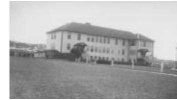
Morley Residential School after new wing was built (a034663)