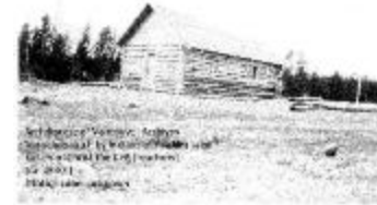
Log school built by Indians at Anahim Lake (38b-c000818-d0002-001)