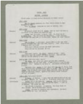
Indian Work in British Columbia (38f-c00062-d0003-001)