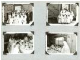
Cérémonies religieuses 1961 (45p-c000006-Cérémonies 1961)