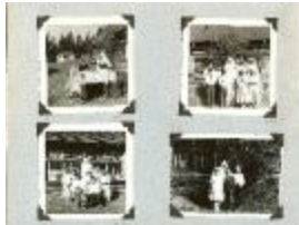
Cérémonies religieuses en 1959-1960 (45p-c000006-Cérémonies 1959)