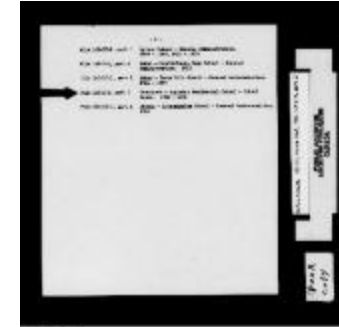
Vancouver Agency - Squamish Residential School - School Lands, 1922-1932 (2054384)