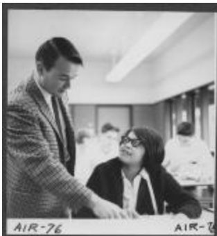
Alberni Indian Residence Alberni, B. C. Teacher and Indian student at the E. J. Dunn School in Port Alberni. (13d-c5699-d50)