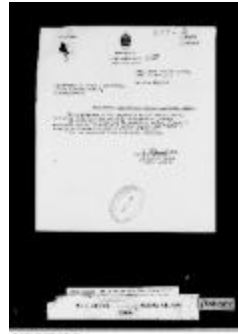
Letter, 19 October 1949 (c-8760_19.pdf)