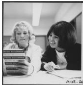
Alberni Indian Residence Alberni, B. C. Girls in class at E. J. Dunn School in Port Alberni, where some of the Indian residence students (13d-c5699-150)