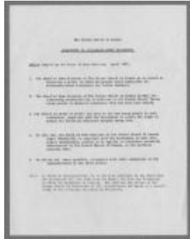
Management Of Government-Owned Residences (38f-c000528-d0017-001)