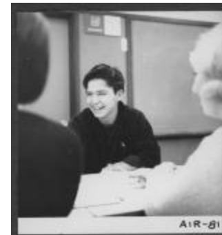
Alberni Indian Residence Alberni, B. C. Indian boy participating in discussion at E. J. Dunn School in Port Alberni. (13d-c5699-150)