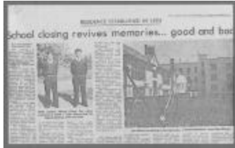
School Closing Revives Memories... Good And Bad (38f-c000527-d0001-001)