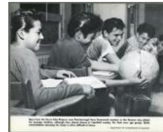
Boys from the Curve Lake Reserve (38f-c000941-d0001-006)