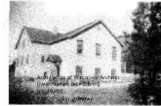
[New Anahim Lake School] (38b-c000818-d0003-001)