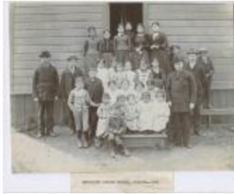
Methodist Indian School, Nanaimo, 1896 (38f-c000151-d0001-001)