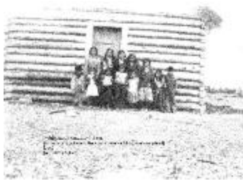
[Students who will attend Anahim Reserve School when completed] (38b-c000818-d0001-001)