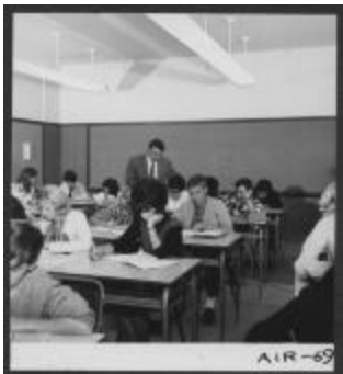
Alberni Indian Residence Alberni, B. C. Classroom of E. J. Dunn School in Port Alberni, where some of Indian Residence students (13d-c5699-150)