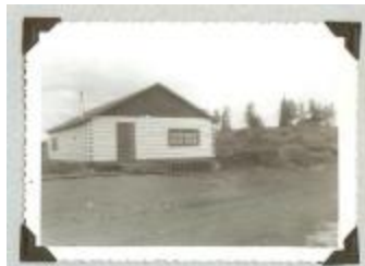
Bâtiments en 1962 (45p-c000006-Batiments en 1962)