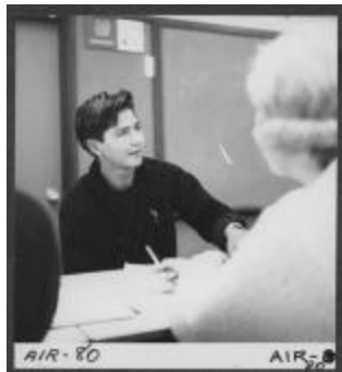
Alberni Indian Residence Alberni, B. C. E. J. Dunn School in Port Alberni. Indian boy facing camera involved with others in class (13d-c5699-150)