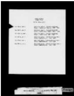
West Coast Agency - Ahousaht Residential School - Inspectors' Reports, 1933-1940 (2055993)