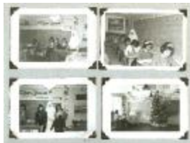
Autres photos de 1966 (45p-c000006-Autres photos 1966)