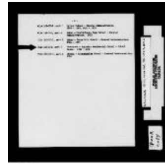
Vancouver Agency - Squamish Residential School - School Lands, 1922-1932 (2054384)