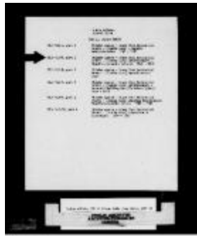
Stikine Agency - Lower Post Residential School (Teslin Lake) - Establishment - Supplies - Accounts (Plans), 1946-1949 (2056755)