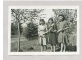
Port Simpson - Crosby Girls' Residential School - Graduates, 1943 (38f-c000137-d0001-001)