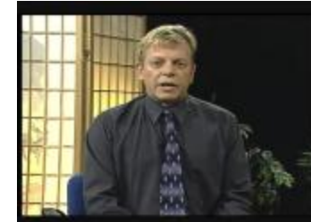
Questions about Residential Schools (38f-c001581-d0007-001)