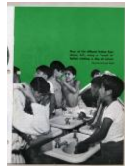
Boys at the Alberni Indian Residence, B.C., enjoy a "wash in" before starting a day at school (38f-c000919-d0002-006)