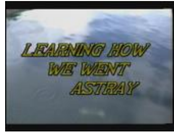
Learning how we went astray (38f-c001581-d0004-001)