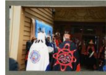
Honour dance for IRS survivors (BCCA-2797.17)