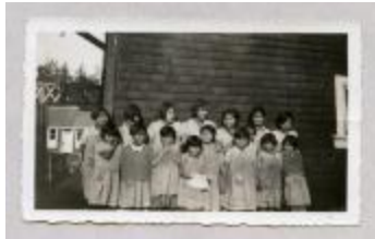
Ahousaht School Girls (38f-c000096-d0001-001)