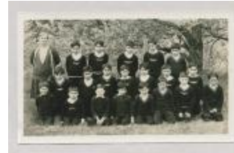
Miss Storkissen & Primary Boys' Class (38f-c000126-d0001-001)