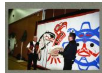
Nuxalk Drummers And Singers (BCCA-2797.27)