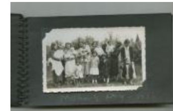
Mother's Day, 1936 (38f-c001582-d0016-001)