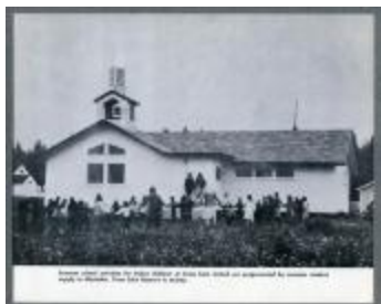
Summer school activities for Indian children at Cross Lake United (38f-c000941-d0001-014)