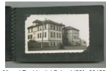
Alberni Residential School (38f-c001582-d0001-002)