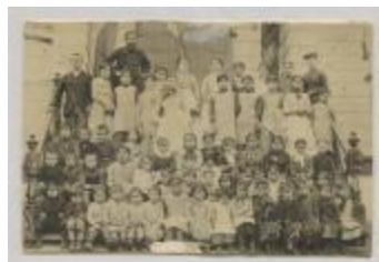
Teachers and students of Crosby Home (38f-c000133)