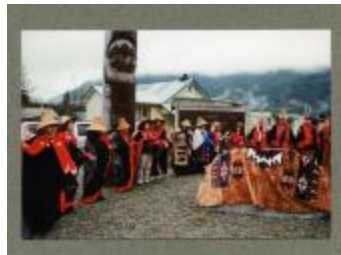
Song before unveiling of IRS Plaque (BCCA-2797.10)