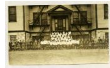
Alberni Indian Residential School and Students (38f-c000115-d0001-001)