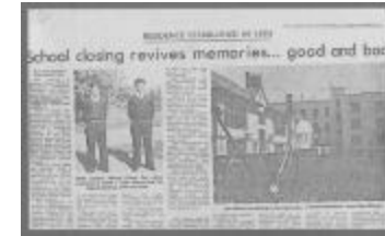
School Closing Revives Memories... Good And Bad (38f-c000527-d0001-001)