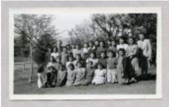
Port Simpson - Crosby Girls' Residential School, Students and Staff, 1943 (38f-c000103-d0001-001)