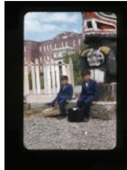
Two unidentified boys and a totem (UCCPMR_20180221_002)