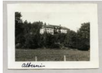
Alberni Indian Residential School (38f-c000099-d0001-001)