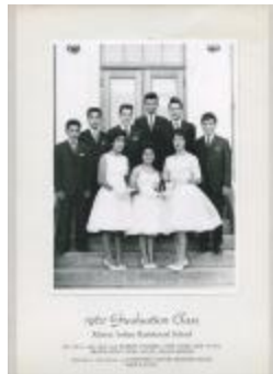
1962 Graduation Class, Alberni Indian Residential School (38f-c000154-d0001-001)