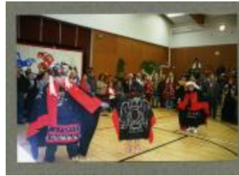
IRS survivor being honoured ( BCCA-2797.29)