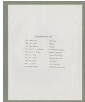
Coqualeetza Staff 1899 (38f-c000058-d0007-001)