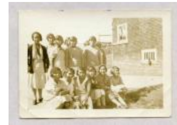
A Group Of Girls On The Basketball Court (38f-c000095-d0001-001)