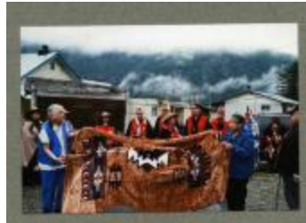
Plaque being Unveiled (BCCA-2797.11)