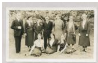
Staff of Alberni Residential School (38f-c000121-d0001-001)