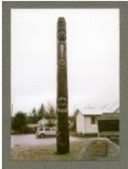
Totem with story of Indian Residential Schools (BCCA-2797.34)