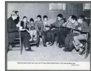
Midweek group of boys (38f-c000941-d0001-003)