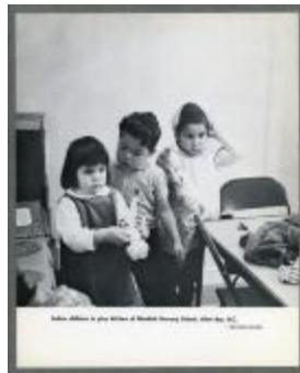
Indian children in play kitchen of Nimkish Nursery School, Alert Bay, B.C. (38f-c000941-d0001-005)