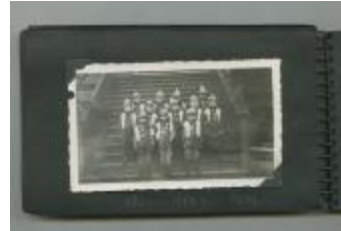
Brownies 1936 (38f-c001582-d0011-001)