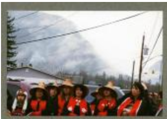
Bella Coola matrons (BCCA-2797.4)