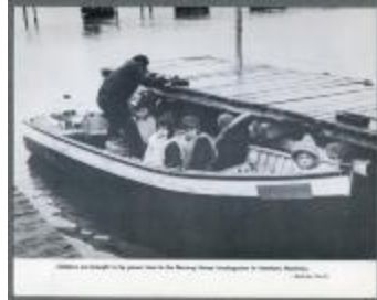
Children are brought in by power boat to the Norway House kindergarten in Northern Manitoba (38f-c000941-d0001-016)