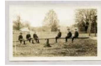
Group of Boys: Indian Residential School - Alberni (38f-c000100-d0001-001)