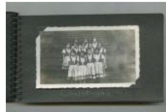
Christmas 1936 (38f-c001582-d0012-001)