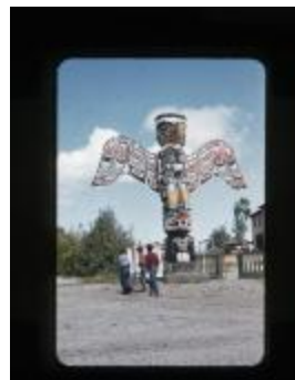
Three unidentified boys and a totem (UCCPMR_20180221_003)