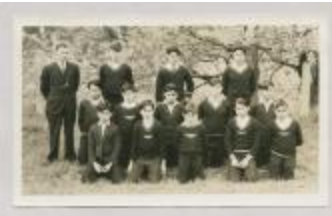
Intermediate S. S. Class (38f-c000123-d0001-001)