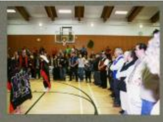
IRS survivors (BCCA-2797.40)