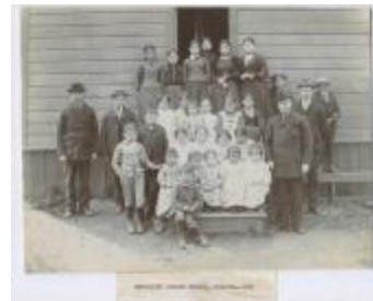
Methodist Indian School, Nanaimo, 1896 (38f-c000151-d0001-001)