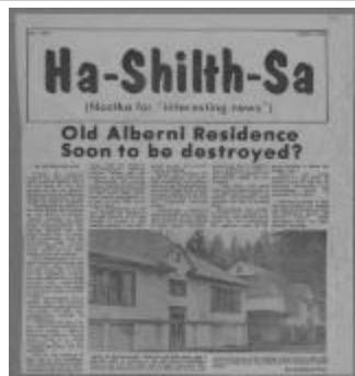
Old Alberni Residence soon to be destroyed? (38f-c000528-d0016-001)