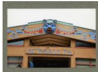
Bella Coola School entrance (BCCA-2797.13)