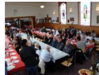
The community gathers (38f-c001524-d0004-001)