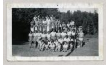
Children from Indian Residential School at their summer camp (38f-c000607-d0006-001)