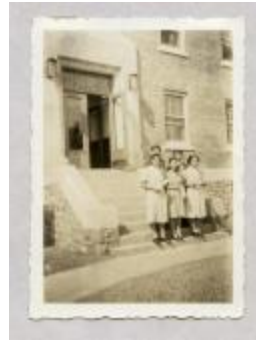
Graduating class for first year of the new Alberni Residential School (38f-c000609-d0003-001)