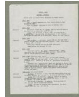
Indian Work in British Columbia (38f-c000062-d0003-001)