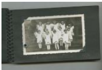
Christmas fairies 1936 (38f-c001582-d0008-001)