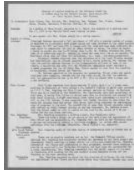
Minutes of a regular meeting of the Advisory Committee on Indian Work in the Alberni Valley (38f-c000516-d0004-001)