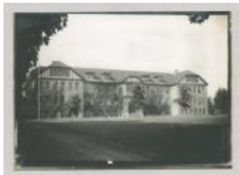
Coqualeetza Institute (38f-c000150-d0001-001)