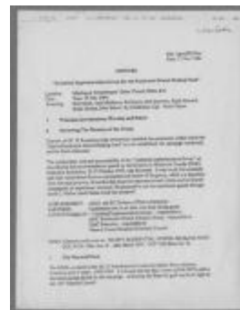
Technical Implementation Group for the Residential School Healing Fund Minutes (38f-c000005-d0007-001)