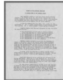
Report Of The Advisory Committee To Indian Work In The Alberni Valley (38f-c000516-d0001-001)