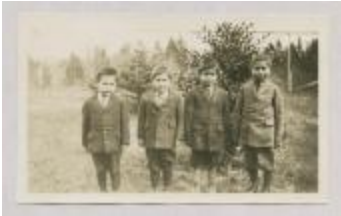
Group of Youngest Boys, Alberni Indian School (38f-c000129-d0001-001)