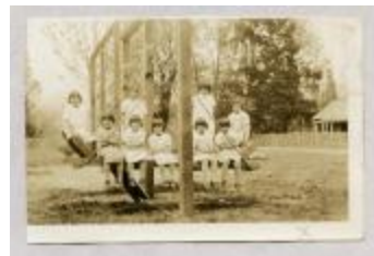
Alberni Indian Residential School Students (38f-c000097-d0001-001)