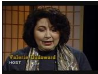
Rebirth in the face of darkness (38f-c001581-d0003-001)