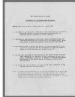
Management Of Government-Owned Residences (38f-c000528-d0017-001)