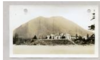
Christie School, "Kakawis," Tofino (38f-c000600-d0001-001)