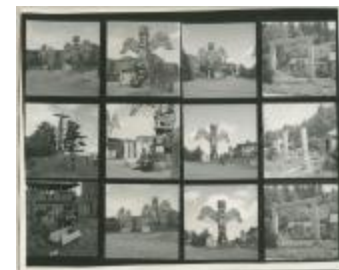
Totem Poles And Children (38f-c000860-d0001-001)