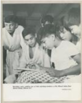
Dormitory party watches one of their painting members, at the Alberni Indian Residential School, Alberni, B.C. (38f-c000282-d0006-001)