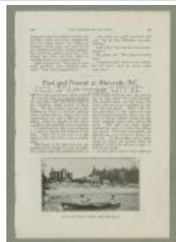
Past and Present at Ahousaht, B.C. (38f-c000170-d0005-001)