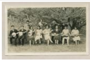
Orchestra - Indian Residential School, Alberni, B.C. (38f-c000117-d0001-001)