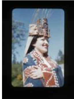
Unidentified young woman with headdress (UCCPMR_20180221_004)