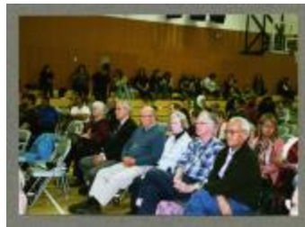
Moderator And friends (5223)