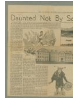
Daunted Not By Savage Curses (38f-c000058-d0022-001)