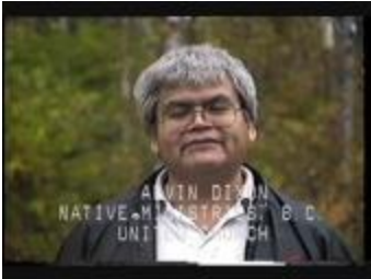
A Native brother's story (38f-c001581-d0001-001)