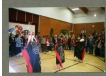
Hereditary chief and daughter and his sister (BCCA-2797.30)