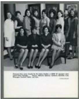
Hostesses from across Canada for the Indian Pavilion at EXPO '67 (38f-c000941-d0001-013)