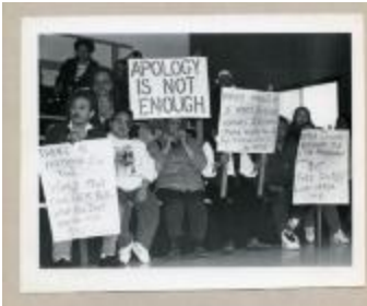
Residential School Survivors Protesting (38f-c000872-d0004-001)