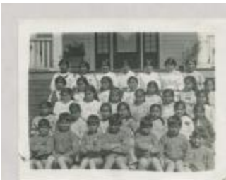
Children on steps of school, Kitamaat, B.C. (38f-c000136)