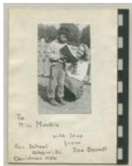
My Family (38f-c000576-d0001-001)