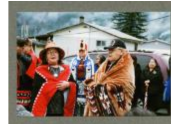
IRS survivor receives the blanket (BCCA-2797.12)