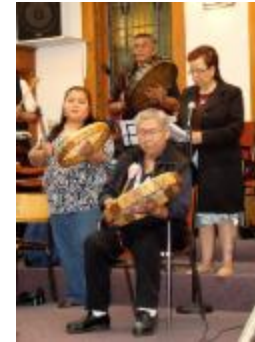
The Four Crest Singers (38f-c001524-d0177-001)