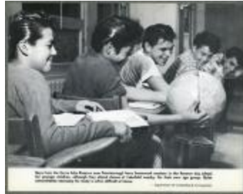
Boys from the Curve Lake Reserve (38f-c000941-d0001-006)