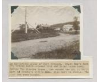
An historical scene of Port Simpson (38f-c000140-d0001-001)