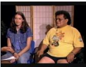
The struggles over an apology (38f-c001581-d0005-001)