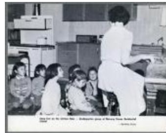
[Song Fest] (UCCPMR_20180221_006)