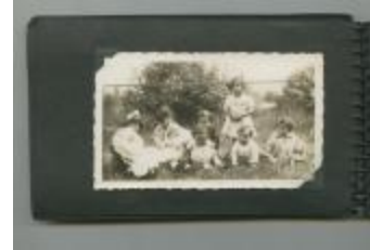
Children holding infants (38f-c001582-d0015-001)