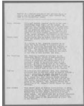
Minutes of a regular meeting of the Advisory Board to Indian Work in the Alberni Valley (38f-c000516-d0006-001)