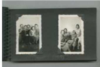
Senior girls (38f-c001582-d0010-001)