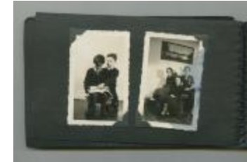
Some Alberni students and teachers (38f-c001582-d0018-001)