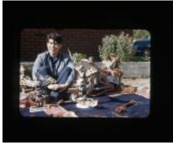
Unidentified young man with indigenous art (UCCPMR_20180221_005)