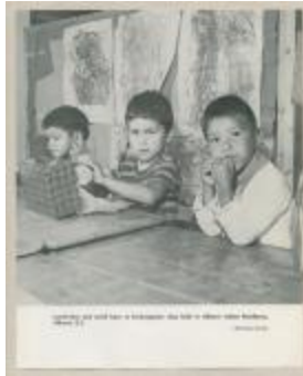
Lunch-time and small boys at kindergarten class held in Alberni Indian Residence, Alberni, B.C. (38f-c000282-d0005-001)