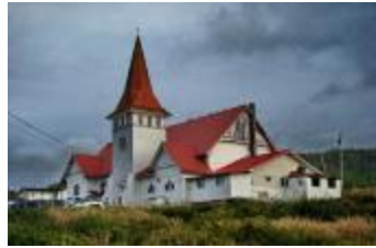
Grace United Church (38f-c001524-d0085-001)