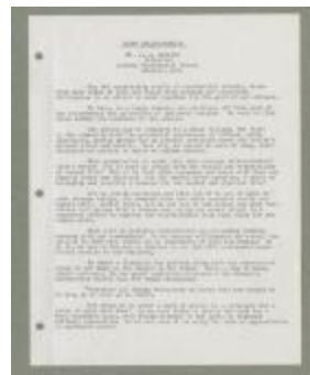
Staff Relationships (38f-c000924-d0004-003)