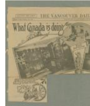
What Canada is Doing for Her Native Indian Children (38f-c000058-d0008-001)