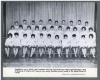
Glee Club from the Portage Indian Student Residence (38f-c000941-d0001-001)