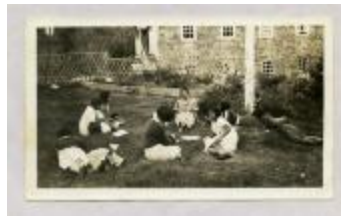
Me and S. S. Class on Front Lawn (38f-c000111-d0001-001)