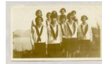
The Humming Bird C.G.I.T. Group, Ahousaht, BC (38f-c000110-d0001-001)