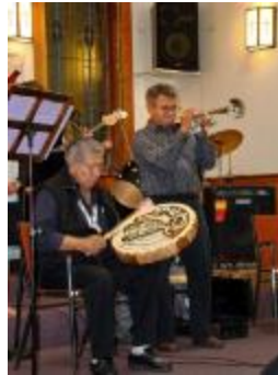
The Four Crest Singers (38f-c001524-d0174-001)