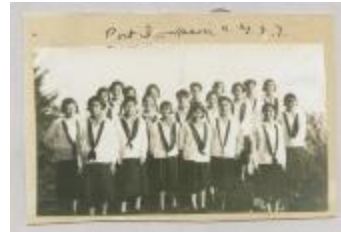
Port Simpson C.G.I.T. (38f-c000138-d0001-001)