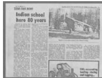
Indian School Here 80 Years (38f-c000527-d0002-001)