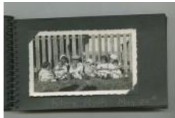
Future Pupils, May 24th (38f-c001582-d0014-001)