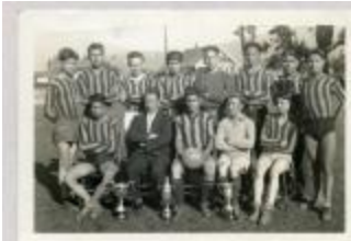
Boys' basketball team, Coqualeetza Institute, Sardis, B.C. (38f-c000607)