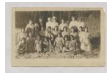
The Elizabeth Long Memorial Home, Pupils and Staff, Kitamaat, B.C. (38f-c000135-d0001-001)