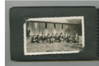
Junior boys (38f-c001582-d0013-001)