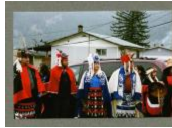
Hereditary chiefs (BCCA-2797.3)