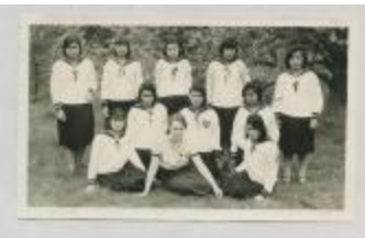
Junior C.G.I.T Group, Indian Residential School, Alberni, B.C. (38f-c000131-d0001-001)