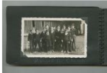
Dressed for church (38f-c001582-d0007-001)