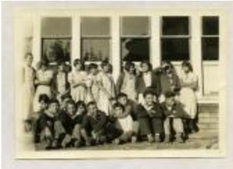
Senior Classes, Grades V to VIII (38f-c000113-d0001-001)