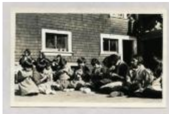
Junior Knitting Class, Ahousaht (38f-c000112-d0001-001)