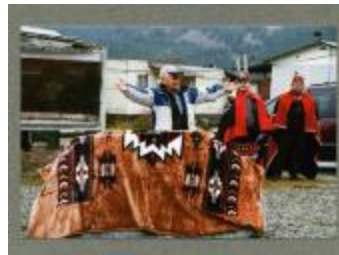
Blessings from elder and IRS survivor (BCCA-2797.2)