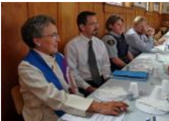
Some representatives of the church and government (38f-c001524-d0006-001)