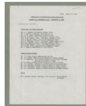
Conference Of Residential School Principals (38f-c000924-d0005-001)