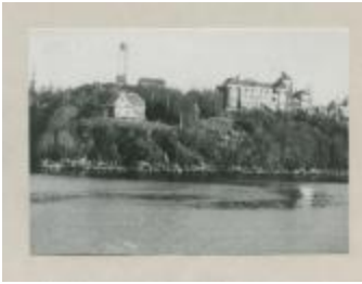
[Alberni?] Residential School (38f-c000591-d0001-002)