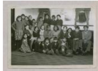
Alberni Indian Residential School (38f-c000118-d0001-001)