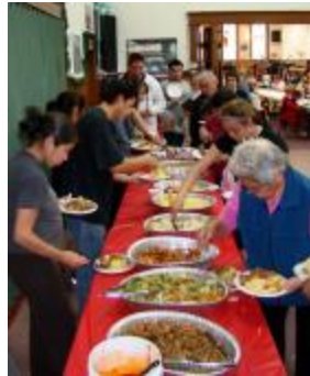
The feast (38f-c001524-d0071-001)