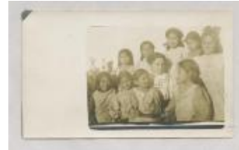
Children And Teacher (38f-c000144-d0001-001)