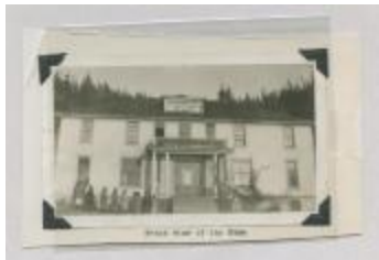
Front View of Home (38f-c000134-d0001-001)