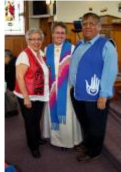
United Church and First Nations elders (38f-c001524-d0063-001)