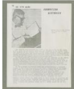
An Era Ends: Khowutzum Historian (38f-c000058-d0024-001)