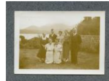
Staff, 1935 (38f-c000094-d0001-001)