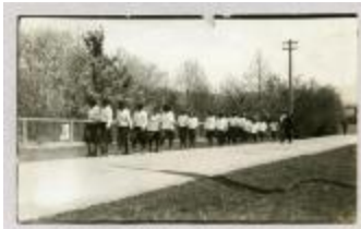
Alberni - Students of Residential School (38f-c000116-d0001-001)