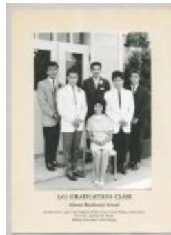
1963 Graduation Class, Alberni Residential School (38f-c000152-d0001-001)