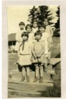
Port Simpson Group of Girls (38f-c000105-d0001-001)