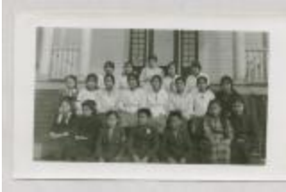
Children and teacher (38f-c000143-d0001-001)