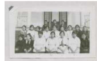
The Officers for past year of the Na Na Kwa Band, Port Simpson (38f-c000145-d0001-001)