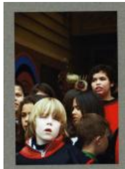
Children singing (BCCA-2797.21)