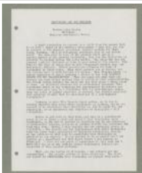
Discipline And Our Children (38f-c000924-d0004-006)