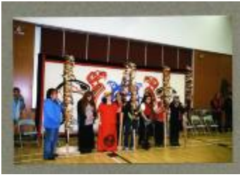
Ladies that made the headbands (BCCA-2797.28)