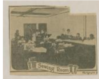
Sewing Room (38f-c000058-d0025-001)