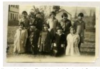
Alberni Indian Residential School Students (38f-c000098-d0001-001)