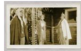
King Hilary and the Beggarman: Christmas Concert, 1934 (38f-c000092-d0001-001)