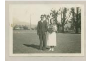
Unidentified boy and girl (38f-c000051-d0001-001)