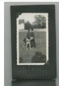
Pearl H. & Oscar (38f-c001582-d0002-001)