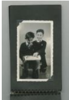
Two boys reading (38f-c001582-d0003-001)