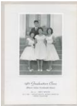
1961 Graduation Class, Alberni Indian Residential School (38f-c000153-d0001-001)