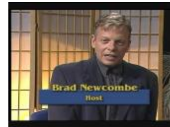
The Residential School Project (38f-c001581-d0006-001)