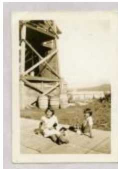
[Girls playing with puppy] (38f-c000109-d0001-001)