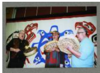
Nuu-Chah-Nulth Chiefs singing a supper song (BCCA-2797.26)