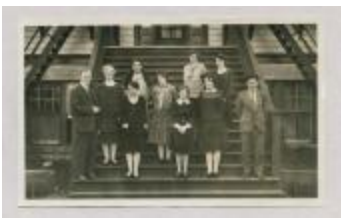
Staff Members (38f-c000130-d0001-001)