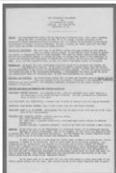
The Coqualeetza Fellowship and The Information Centre (38f-c000931-d0001-001)