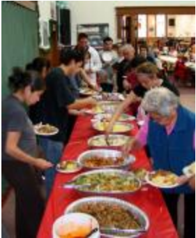
The feast (38f-c001524-d0071-001)