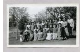
Port Simpson - Crosby Girls' Residential School, Students and Staff, 1943 (38f-c000103-d0001-001)