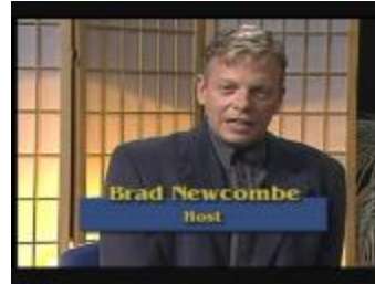
The Residential School Project (38f-c001581-d0006-001)