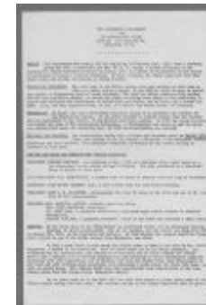
The Coqualeetza Fellowship and The Information Centre (38f-c000931-d0001-001)