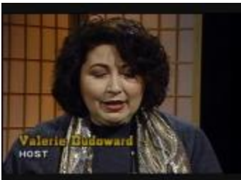
Rebirth in the face of darkness (38f-c001581-d0003-001)