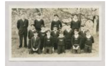
Intermediate S. S. Class (38f-c000123-d0001-001)