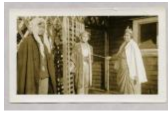
King Hilary and the Beggarman: Christmas Concert, 1934 (38f-c000092-d0001-001)