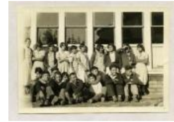
Senior Classes, Grades V to VIII (38f-c000113-d0001-001)