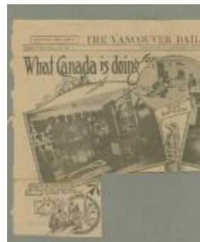
What Canada is Doing for Her Native Indian Children (38f-c000058-d0008-001)