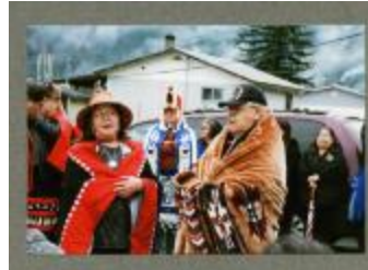
IRS survivor receives the blanket (BCCA-2797.12)