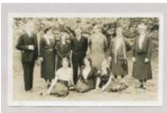
Staff of Alberni Residential School (38f-c000121-d0001-001)