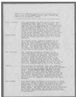
Minutes of a regular meeting of the Advisory Board to Indian Work in the Alberni Valley (38f-c000516-d0006-001)