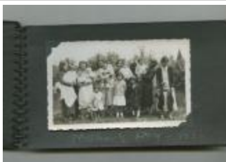
Mother's Day, 1936 (38f-c001582-d0016-001)