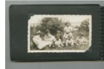
Children holding infants (38f-c001582-d0015-001)