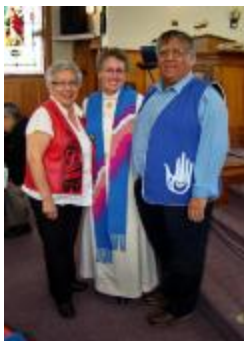
United Church and First Nations elders (38f-c001524-d0063-001)