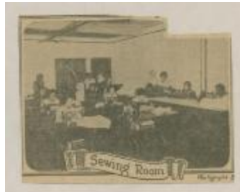
Sewing Room (38f-c000058-d0025-001)