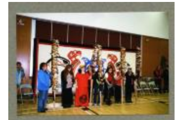
Ladies that made the headbands (BCCA-2797.28)