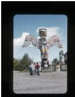
Three unidentified boys and a totem (UCCPMR_20180221_003)