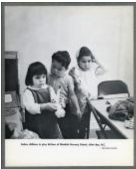
Indian children in play kitchen of Nimkish Nursery School, Alert Bay, B.C. (38f-c000941-d0001-005)