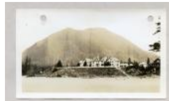
Christie School, "Kakawis," Tofino (38f-c000600-d0001-001)