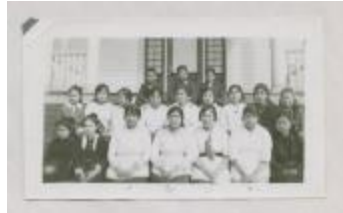
The Officers for past year of the Na Na Kwa Band, Port Simpson