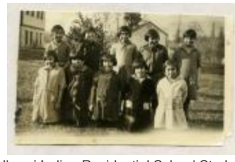
Alberni Indian Residential School Students (38f-c000098-d0001-001)