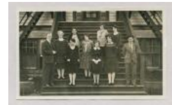
Staff Members (38f-c000130-d0001-001)