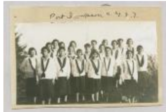
Port Simpson C.G.I.T. (38f-c000138-d0001-001)