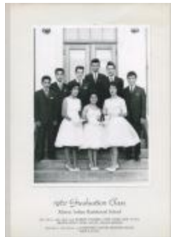
1962 Graduation Class, Alberni Indian Residential School (38f-c000154-d0001-001)