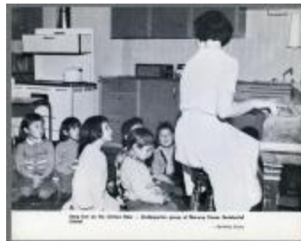
[Song Fest] (UCCPMR_20180221_006)