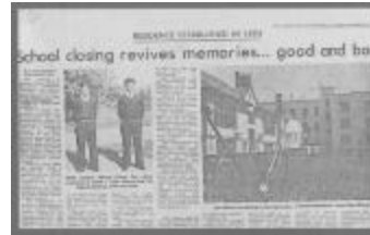
School Closing Revives Memories... Good And Bad (38f-c000527-d0001-001)