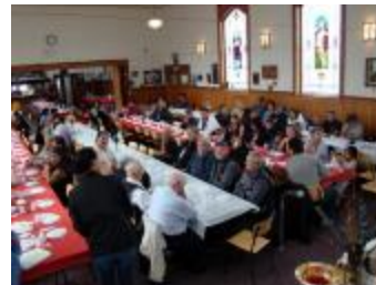
The community gathers (38f-c001524-d0004-001)