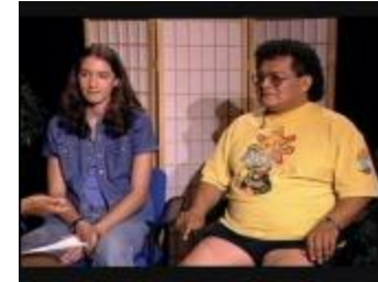
The struggles over an apology (38f-c001581-d0005-001)