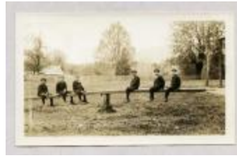
Group of Boys: Indian Residential School - Alberni (38f-c000100-d0001-001)