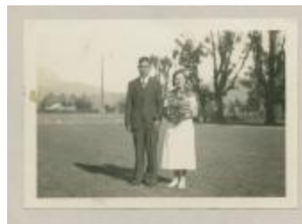
Unidentified boy and girl (38f-c000051-d0001-001)