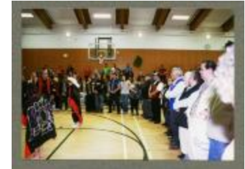
IRS survivors (BCCA-2797.40)