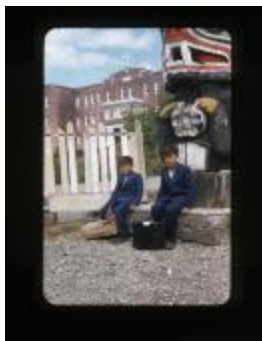
Two unidentified boys and a totem (UCCPMR_20180221_002)