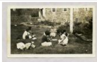
Me and S. S. Class on Front Lawn (38f-c000111-d0001-001)