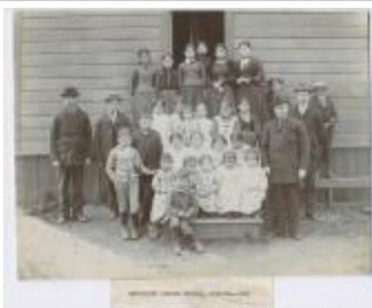
Methodist Indian School, Nanaimo, 1896 (38f-c000151-d0001-001)