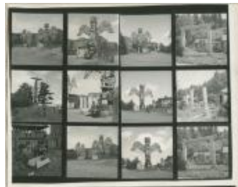
Totem Poles And Children (38f-c000860-d0001-001)