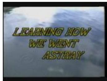
Learning how we went astray (38f-c001581-d0004-001)