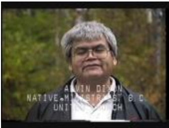
A Native brother's story (38f-c001581-d0001-001)