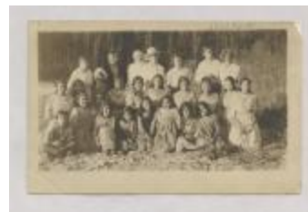
The Elizabeth Long Memorial Home, Pupils and Staff, Kitamaat, B.C. (38f-c000135-d0001-001)