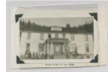
Front View of Home (38f-c000134-d0001-001)