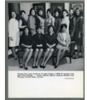
Hostesses from across Canada for the Indian Pavilion at EXPO '67 (38f-c000941-d0001-013)