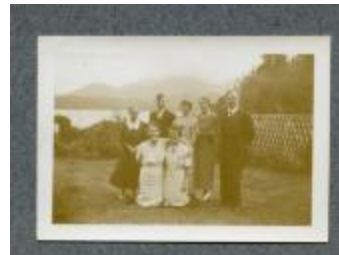
Staff, 1935 (38f-c000094-d0001-001)