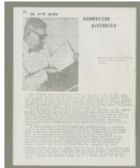
An Era Ends: Khowutzum Historian (38f-c000058-d0024-001)