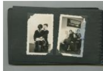
Some Alberni students and teachers (38f-c001582-d0018-001)