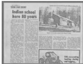
Indian School Here 80 Years (38f-c000527-d0002-001)