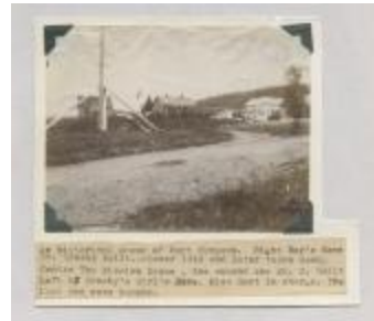
An historical scene of Port Simpson (38f-c000140-d0001-001)