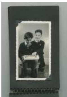
Two boys reading (38f-c001582-d0003-001)