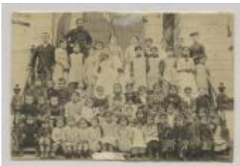
Teachers and students of Crosby Home (38f-c000133)