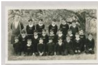
Miss Storkissen & Primary Boys' Class (38f-c000126-d0001-001)