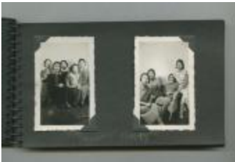
Senior girls (38f-c001582-d0010-001)