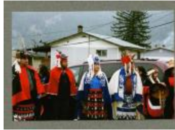
Hereditary chiefs (BCCA-2797.3)