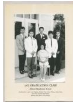
1963 Graduation Class, Alberni Residential School (38f-c000152-d0001-001)