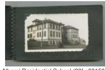
Alberni Residential School (38f-c001582-d0001-002)