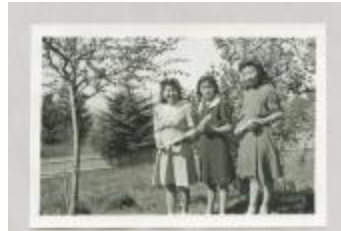
Port Simpson - Crosby Girls' Residential School - Graduates, 1943 (38f-c000137-d0001-001)