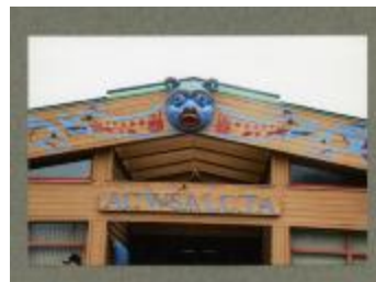
Bella Coola School entrance (BCCA-2797.13)