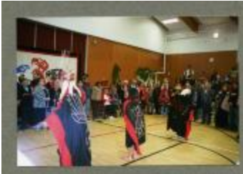
Hereditary chief and daughter and his sister