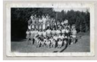
Children from Indian Residential School at their summer camp (38f-c000607-d0006-001)