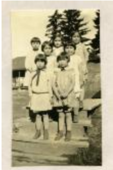
Port Simpson Group of Girls (38f-c000105-d0001-001)