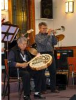
The Four Crest Singers (38f-c001524-d0174-001)