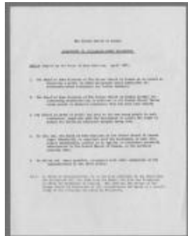
Management Of Government-Owned Residences (38f-c000528-d0017-001)