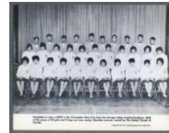
Glee Club from the Portage Indian Student Residence (38f-c000941-d0001-001)