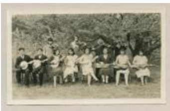
Orchestra - Indian Residential School, Alberni, B.C. (38f-c000117-d0001-001)