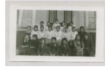
Children and teacher (38f-c000143-d0001-001)