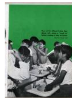
Boys at the Alberni Indian Residence, B.C., enjoy a "wash in" before starting a day at school (38f-c000919-d0002-006)