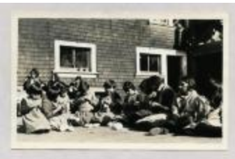
Junior Knitting Class, Ahousaht (38f-c000112-d0001-001)