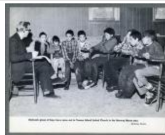
Midweek group of boys (38f-c000941-d0001-003)