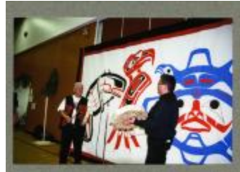
Nuxalk Drummers And Singers (BCCA-2797.27)