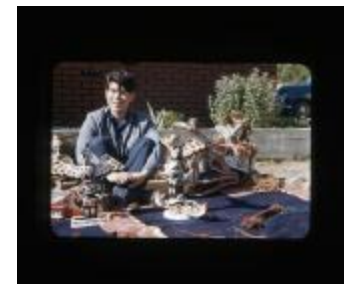
Unidentified young man with indigenous art (UCCPMR_20180221_005)