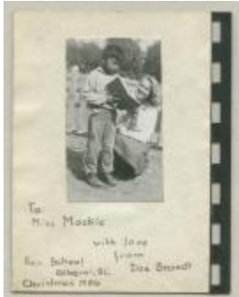
My Family (38f-c000576-d0001-001)