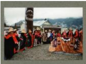
Song before unveiling of IRS Plaque (BCCA-2797.10)