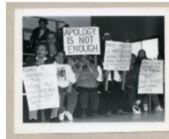
Residential School Survivors Protesting (38f-c000872-d0004-001)