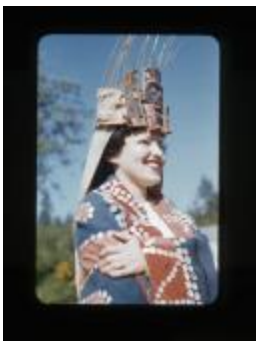
Unidentified young woman with headdress (UCCPMR_20180221_004)