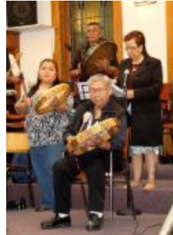
The Four Crest Singers (38f-c001524-d0177-001)