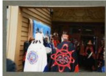
Honour dance for IRS survivors (BCCA-2797.17)