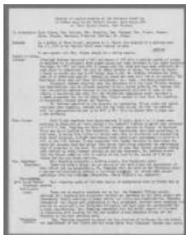
Minutes of a regular meeting of the Advisory Committee on Indian Work in the Alberni Valley (38f-c000516-d0004-001)