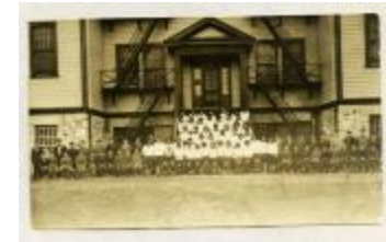
Alberni Indian Residential School and Students (38f-c000115-d0001-001)