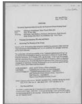
Technical Implementation Group for the Residential School Healing Fund Minutes (38f-c000005-d0007-001)