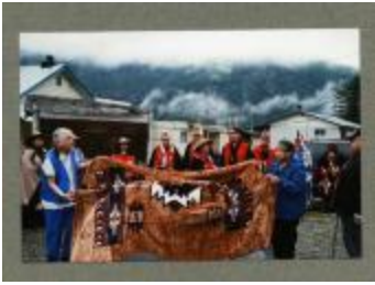
Plaque being Unveiled (BCCA-2797.11)