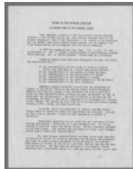
Report Of The Advisory Committee To Indian Work In The Alberni Valley (38f-c000516-d0001-001)