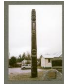
Totem with story of Indian Residential Schools (BCCA-2797.34)