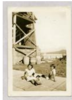
[Girls playing with puppy] (38f-c000109-d0001-001)