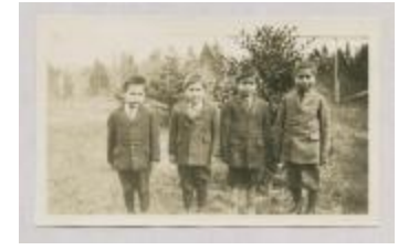
Group of Youngest Boys, Alberni Indian School (38f-c000129-d0001-001)