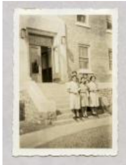
Graduating class for first year of the new Alberni Residential School (38f-c000609-d0003-001)