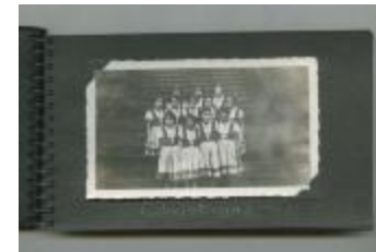
Christmas 1936 (38f-c001582-d0012-001)