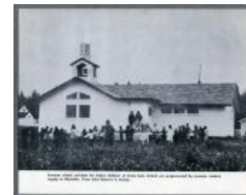
Summer school activities for Indian children at Cross Lake United (38f-c000941-d0001-014)