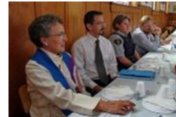
Some representatives of the church and government (38f-c001524-d0006-001)