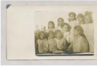
Children And Teacher (38f-c000144-d0001-001)