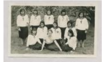
Junior C.G.I.T Group, Indian Residential School, Alberni, B.C. (38f-c000131-d0001-001)