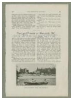
Past and Present at Ahousaht, B.C. (38f-c000170-d0005-001)