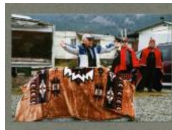
Blessings from elder and IRS survivor (BCCA-2797.2)