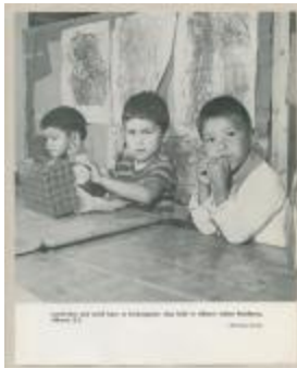
Lunch-time and small boys at kindergarten class held in Alberni Indian Residence, Alberni, B.C. (38f-c000282-d0005-001)