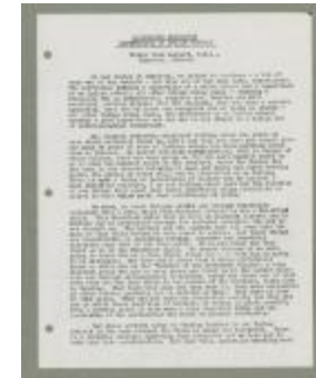
Background Knowledge: Supervisors In Indian Schools (38f-c000924-d0004-005)