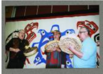
Nuu-Chah-Nulth Chiefs singing a supper song (BCCA-2797.26)