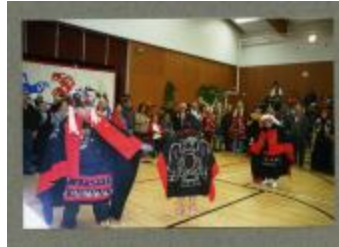
IRS survivor being honoured ( BCCA-2797.29)