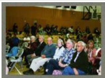
Moderator And friends (5223)