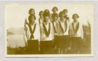
The Humming Bird C.G.I.T. Group, Ahousaht, BC (38f-c000110-d0001-001)