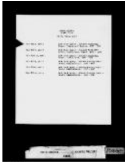
West Coast Agency - Ahousaht Residential School - Inspectors' Reports, 1933-1940 (2055993)