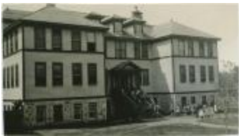
Former building, burned 1937. Replaced in 1939. (13d-c5699-d2)