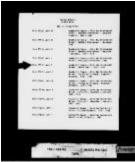
Kwakwewth Agency - Alert Bay Residential School - School Land, 1932-1948 (2057052)