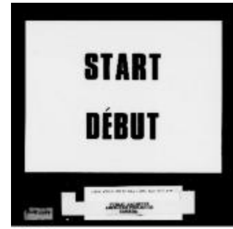
Kamloops Agency - Kamloops Industrial School - Agricultural Land - Irrigation With Accompanying Supplies And Accounts (2055993)