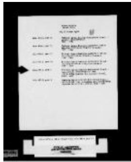
Kamloops Agency - Kamloops Industrial School - Agricultural Land - Irrigation With Accompanying Supplies And Accounts (2055993)