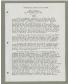
The Emotional Needs Of Our Children (38f-c000924-d0004-004)