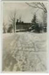
[Brandon Institute in winter (side view)] (13d-c5711-d50)