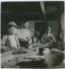
[Carpentry class, Brandon Industrial Institute] (13d-c5711-d22)