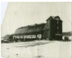
[Cows outside the dairy barn, Brandon Institute] (13d-c5711-d26)