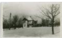
House of the instructor in carpentry, Brandon, Man. (13d-c5711-d38)