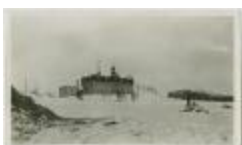
Brandon Institute (13d-c5711-d39)