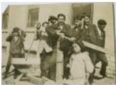
Children at the Brandon Indian School (13d-c5711-d20)