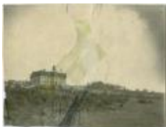
[Brandon Industrial Institute, Brandon, Man.] (13d-c5711-d9)