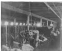
[Cows in stalls in the dairy barn, Brandon Institute] (13d-c5711-d32)