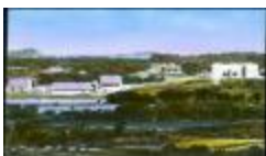
Brandon Indian Inst., Man. (13d-c5711-d58)