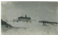
Brandon Indian Institute, Man. (13d-c5711-d51)