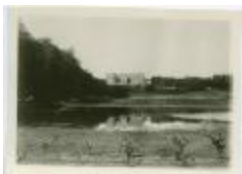
Brandon Indian Institute, Man. (13d-c5711-d53)