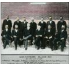
Indian missionaries, Brandon (13d-c5711-d56)