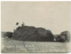
[Bringing in the hay, Brandon Indian School farm] (13d-c5711-d14)