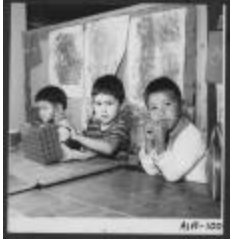
Alberni Indian Residence Alberni, B. C. Small boys at kindergarten class held at Residence. (13d-c5699-d55)