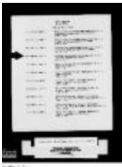
Kamloops Agency - Kamloops Residential School - Livestock - Supplies - Accounts, 1920-1938 (2056029)