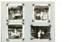
Cérémonies religieuses en 1959-1960 (45p-c000006-Cérémonies 1959)