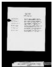
West Coast Agency - Ahousaht Residential School - School Land (Plan), 1907-1936 (2055994)