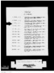
Lytton Agency - St. George's Residential School - Livestock - Accounts, 1933-1943 (2056065)