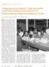
"Hunger was never absent": How residential school diets shaped current patterns of diabetes among Indigenous peoples in Canada (UBC_20180406_001)