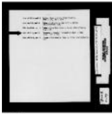
Vancouver Agency - Squamish Residential School - School Lands, 1922-1932 (2054384)