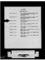
Kootenay Agency - Kootenay Residential School - Livestock - Accounts, 1925-1944 (2056039)