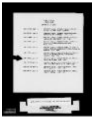
Vancouver Agency - Sechelt Residential School - Livestock - Accounts, 1923-1946 (2056058)