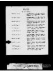
Kwawkwalth Agency - Alert Bay Residential School - Livestock - Supplies - Accounts, 1938-1947 (2056693)