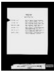
West Coast Agency - Ahousaht Residential School - Inspectors' Reports, 1933-1940 (2055993)