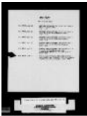
Kamloops Agency - Kamloops Industrial School - Agricultural Land - Irrigation With Accompanying Supplies And Accounts (Plans), 1926-1932 (2056717)