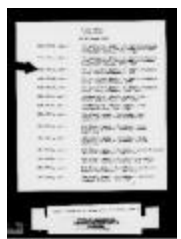
New Westminister Agency - St. Mary's Residential School - Livestock - Supplies, 1931 (2056079)