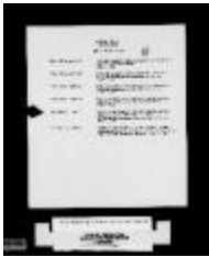
Kamloops Agency - Kamloops Industrial School - Agricultural Land - Irrigation With Accompanying Supplies And Accounts (Plans), 1912-1926 (2056034)