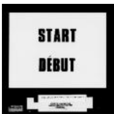
Kamloops Agency - Kamloops Industrial School - Agricultural Land - Irrigation With Accompanying Supplies And Accounts (Plans), 1912-1926 (2096117)