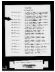
New Westminster Agency - St. Mary's Residential School - Livestock - Supplies, 1931 (2056079)