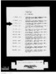
Lytton Agency - St. George's Residential School - Livestock - Accounts, 1933-1943 (2056065)