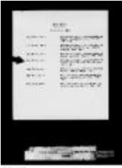
Williams Lake Agency - Caribou Residential School - Cadet Corps Band Set - Accounts, 1945-1946 (2056009)