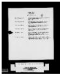
Kamloops Agency - Kamloops Industrial School - Agricultural Land - Irrigation With Accompanying Supplies And Accounts (Plans), 1912-1926 (2056034)