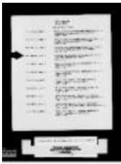
Kamloops Agency - Kamloops Residential School - Livestock - Supplies - Accounts, 1920-1938 (2056029)