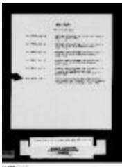
Kamloops Agency - Kamloops Industrial School - Agricultural Land - Irrigation With Accompanying Supplies And Accounts (Plans), 1926-1932 (2056717)