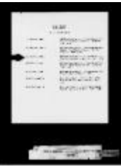
Williams Lake Agency - Caribou Residential School - Livestock - Supplies, 1927-1932 (2056008)