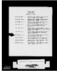
Vancouver Agency - Sechelt Residential School - Livestock - Accounts, 1923-1946 (2056058)