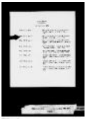
West Coast Agency - Alberni Residential School - Livestock, 1931-1940 (2055999)