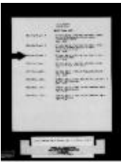
Kootenay Agency - Kootenay Residential School - Livestock - Accounts, 1925-1944 (2056039)