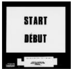
Kamloops Agency - Kamloops Industrial School - Agricultural Land - Irrigation With Accompanying Supplies And Accounts (Plans), 1912-1926 (2096117)