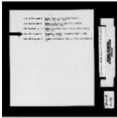
Vancouver Agency - Squamish Residential School - School Lands, 1922-1932 (2054384)