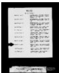
Kwawkewlth Agency - Alert Bay Residential School - Livestock - Supplies - Accounts, 1938-1947 (2056693)