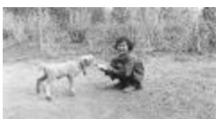
St. George's School, Lytton, B.C. - School girl feeding lamb (13a-c004554-d1038-001)