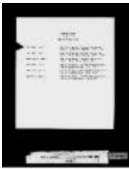
West Coast Agency - Ahousaht Residential School - Inspectors' Reports, 1933-1940 (2055993)