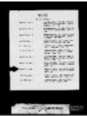
Kwawkwalth Agency - Alert Bay Residential School - Livestock - Supplies - Accounts, 1938-1947 (2056693)