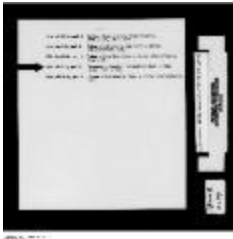
Vancouver Agency - Squamish Residential School - School Lands, 1922-1932 (2054384)