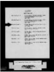
Kootenay Agency - Kootenay Residential School - Livestock - Accounts, 1925-1944 (2056039)