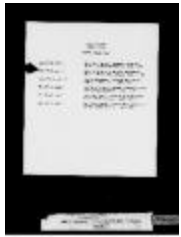
West Coast Agency - Ahousaht Residential School - School Land (Plan), 1907-1936 (2055994)