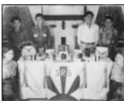
Photograph, 1958 (10a-c000480-d0054-001)