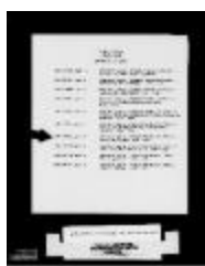
Vancouver Agency - Sechelt Residential School - Livestock - Accounts, 1923-1946 (2056058)