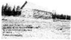
Log school built by Indians at Anahim Lake (38b-c000818-d0002-001)