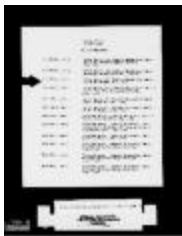
Lytton Agency - St. George's Residential School - Livestock - Accounts, 1933-1943 (2056065)