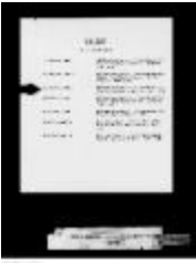
Williams Lake Agency - Caribou Residential School - Livestock - Supplies, 1927-1932 (2056008)