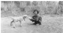
St. George's School, Lytton, B.C. - School girl feeding lamb (13a-c004554-d1038-001)