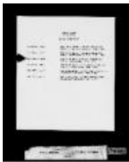
West Coast Agency - Ahousaht Residential School - School Land, 1930-1936 (2055996)