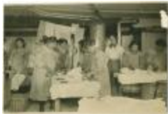
In the laundry room of the Coqualeetza Industrial School (13d-c5701-d18)