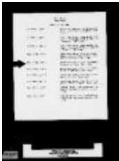
Stuart Lake Agency - Lejac Residential School - Livestock, 1925-1940 (2056023)