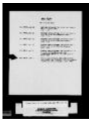
Kamloops Agency - Kamloops Industrial School - Agricultural Land - Irrigation With Accompanying Supplies And Accounts (Plans), 1926-1932 (2056717)