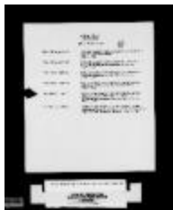
Kamloops Agency - Kamloops Industrial School - Agricultural Land - Irrigation With Accompanying Supplies And Accounts (Plans), 1912-1926 (2056034)