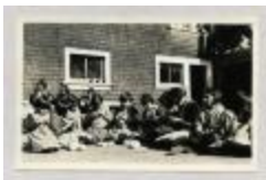
Junior Knitting Class, Ahousaht (38f-c000112-d0001-001)