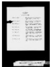
West Coast Agency - Alberni Residential School - Livestock, 1931-1940 (2055999)