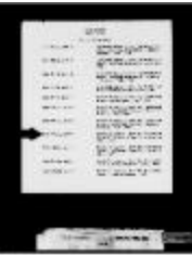
Kwawkwalth Agency - Alert Bay Residential School - Livestock - Supplies - Accounts, 1921-1932 (2055984)