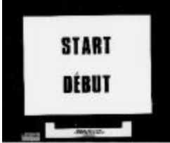
Kootenay Agency - Kootenay Residential School - Livestock - Accounts, 1925-1944 (2096121)