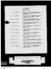
Kamloops Agency - Kamloops Residential School - Livestock - Supplies - Accounts, 1920-1938 (2056029)