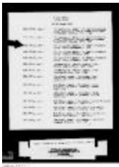
New Westminster Agency - St. Mary's Residential School - Livestock - Supplies, 1931 (2056079)