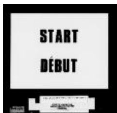
Kamloops Agency - Kamloops Industrial School - Agricultural Land - Irrigation With Accompanying Supplies And Accounts (Plans), 1912-1926 (2096117)