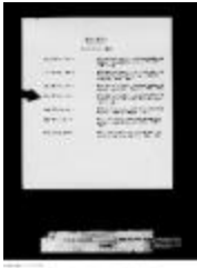
Williams Lake Agency - Caribou Residential School - Cadet Corps Band Set - Accounts, 1945-1946 (2056009)