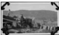
Photograph, 1926 (10a-c000511-d0027-001)