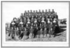
Photograph, 1943 (10a-c000512-d0007-001)