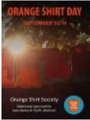
Orange Shirt Day, September 30th (2023976)