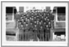
Photograph, 1943 (10a-c000512-d0008-001)