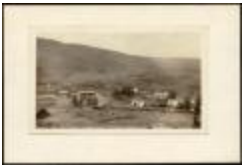
Photograph, 1938 (10a-c000511-d0030-001)