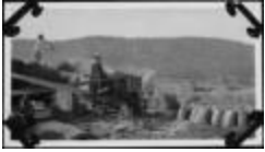
Photograph, 1926 (10a-c000511-d0027-001)