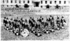
Cariboo Indian Girls' Pipe Band, William's Lake, BC (38b-c000819-d0001-001)