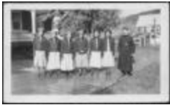
Photograph, 1941 (10a-c000479-d0037-001)