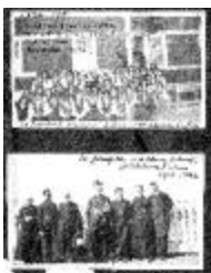
St. Joseph's Indian School, William's Lake (38b-c000818-d0011-001)