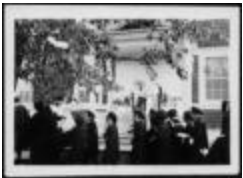
Photograph, 1940 (10a-c000511-d0012-001)