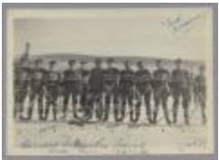
Photograph, 1940 (10a-c000512-d0034-001)