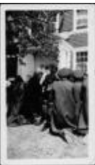
Photograph, 1941 (10a-c000511-d0011-001)