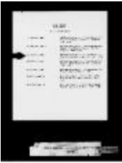
Williams Lake Agency - Caribou Residential School - Livestock - Supplies, 1927-1932 (2056008)