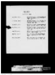
Williams Lake Agency - Caribou Residential School - Cadet Corps Band Set - Accounts, 1945-1946 (2056009)