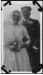
Photograph, 1926 (10a-c000511-d0006-001)