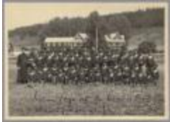
Photograph, 1941 (10a-c000512-d0010-001)