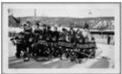
Photograph, 1940 (10a-c000512-d0020-001)