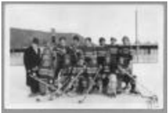
Photograph, 1939 (10a-c000512-d0019-001)