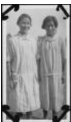
Photograph, 1926 (10a-c000511-d0004-001)